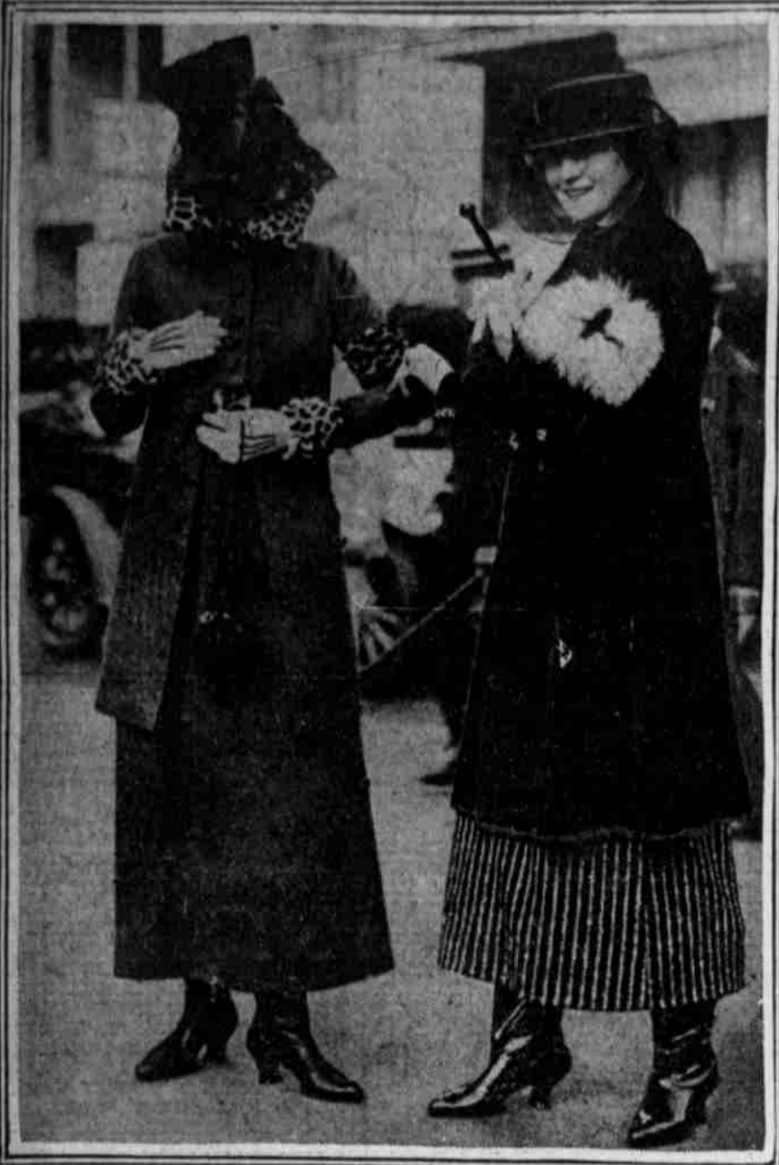
WE ALL TAKE AN INTEREST IN FASHIONS So here is something known as a "fur cross combination" that fascinated Fifth avenue the other day. Note the high-topped boots, too.

PERSONS, SCENES AND EVENTS THAT FIGURE IN THE NEWS OF THE DAY FROM DIVERS SOURCES