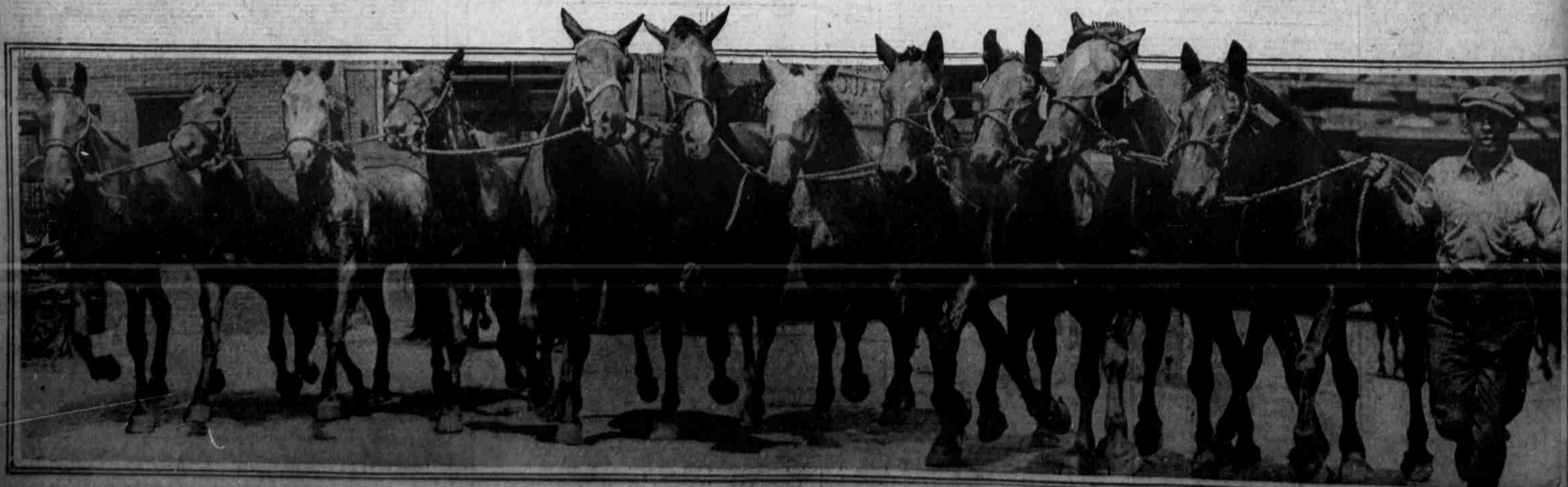
THE-LOOKING HORSES JUST PASSED ON AND ACCEPTED FOR THE FRENCH ARMY BY THE INSPECTORS, WHO ARE EXAMINING THOUSANDS OF MOUNTS AT THE BULL'S HEAD HORSE BAZAAR