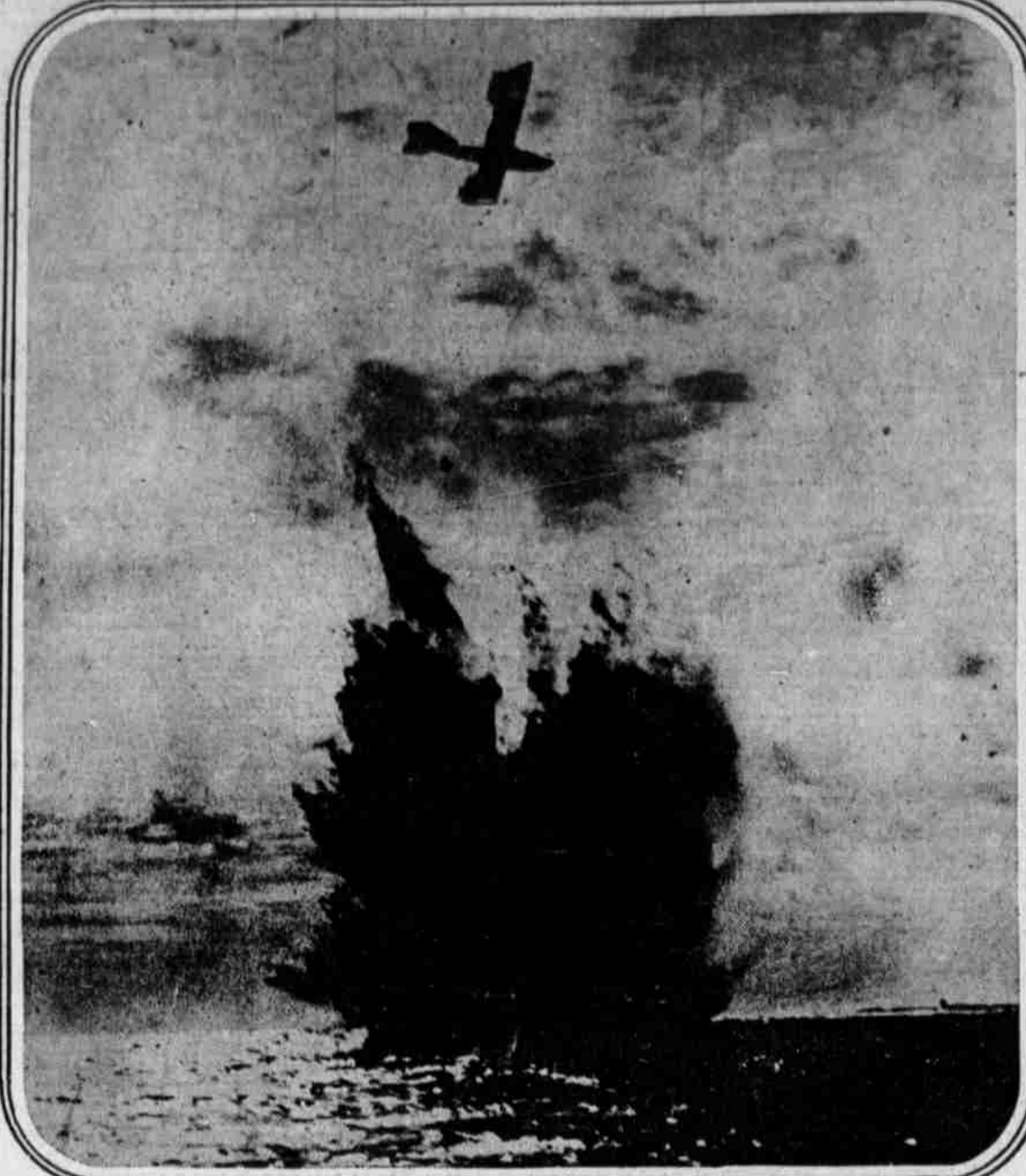
HOW AN AEROPLANE LOOKS IN ATTACK ON SUBMARINE A British aviator is reported to have sunk a submersible by dropping a bomb upon it. For this he received special commendation from the War Office. This picture, taken in practice, shows the enormous mass of water thrown up by an exploding bomb.