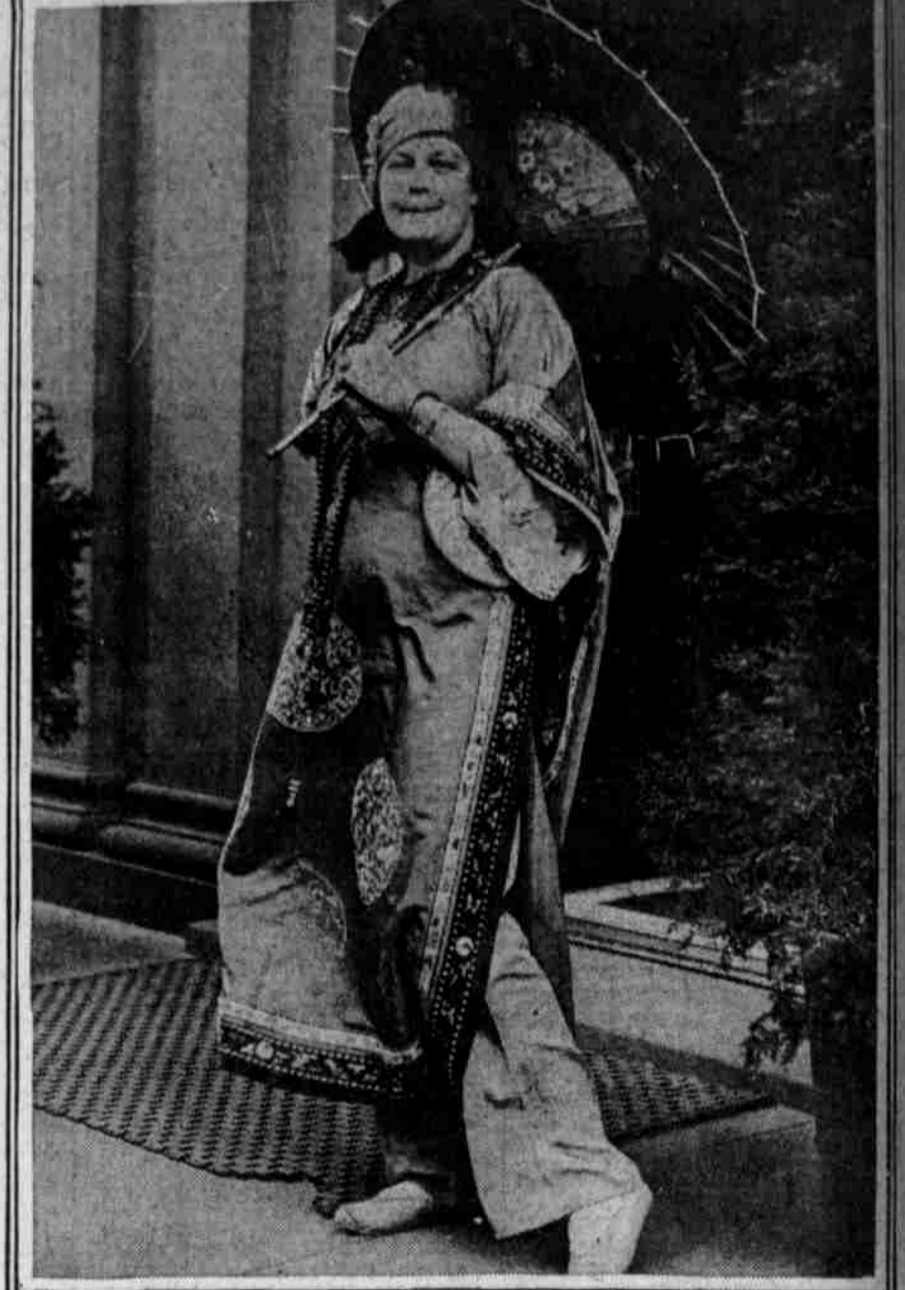
CHINESE CLOTHES, WHY NOT? Miss Kathleen Howard, opera singer, shown here, contends that they are not only comfortable, but can be made strikingly beautiful.