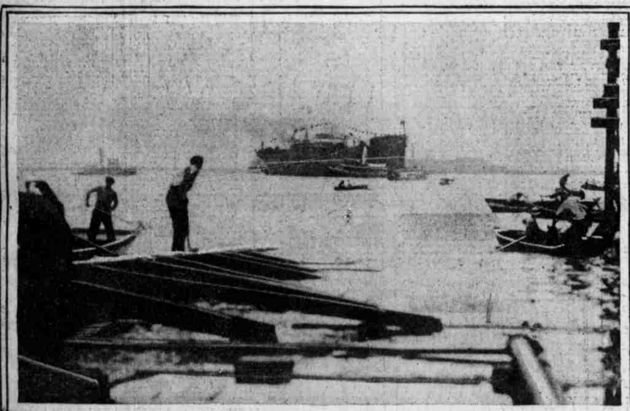
GATHERING UP WAX AFTER LAUNCHING SHIP

At the New York Shipbuilding Company yards a flock of men in rowboats salvage the wax used to grease the ways after the ships are given their baptism of wing and water. This picture was taken at the recent launching of the collier Franklin.