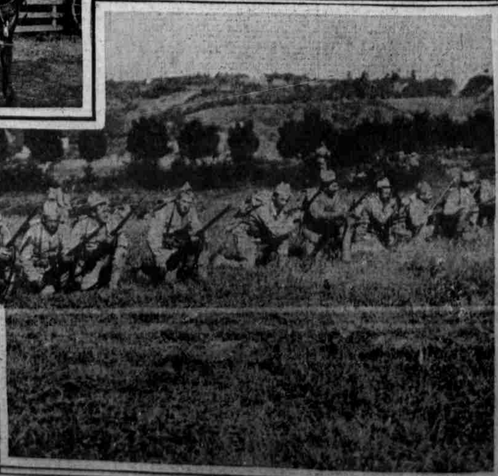
ITALIANS NEAR TRIESTE, IN THE AUSTRIAN TYROL King Victor Emanuel's men have shown great valor and wonderful fighting ability in the assaults against the Austrians in the Alps region, though their progress is slow. This shows a scouting party in one of the less hilly sections.

Millionaires are buying costly box bushes for their estates in large quantities. The larger one in the picture is being transplanted from Shiloh, N. J. It weighs 10 tons and is believed to be more than 200 years old. The price was $300.