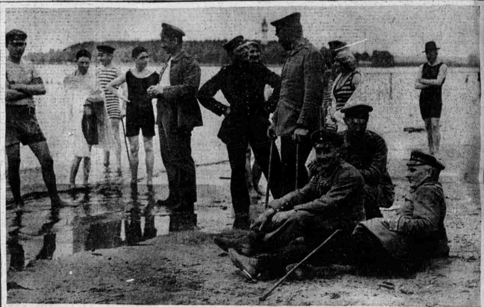
GERMAN SOLDIERS ENJOYING LIFE NEAR BERLIN The Kaiser realizes the immense advantages of complete relaxation for the men returned from the battle front. A few of the fighters recuperating from injuries or home on furlough are here shown with their wives and sweethearts in the Wannsee open-air bath.

At the New York Shipbuilding Company yards a flock of men in rowboats salvage the wax used to grease the ways after the ships are given their baptism of wing and water. This picture was taken at the recent launching of the collier Franklin.