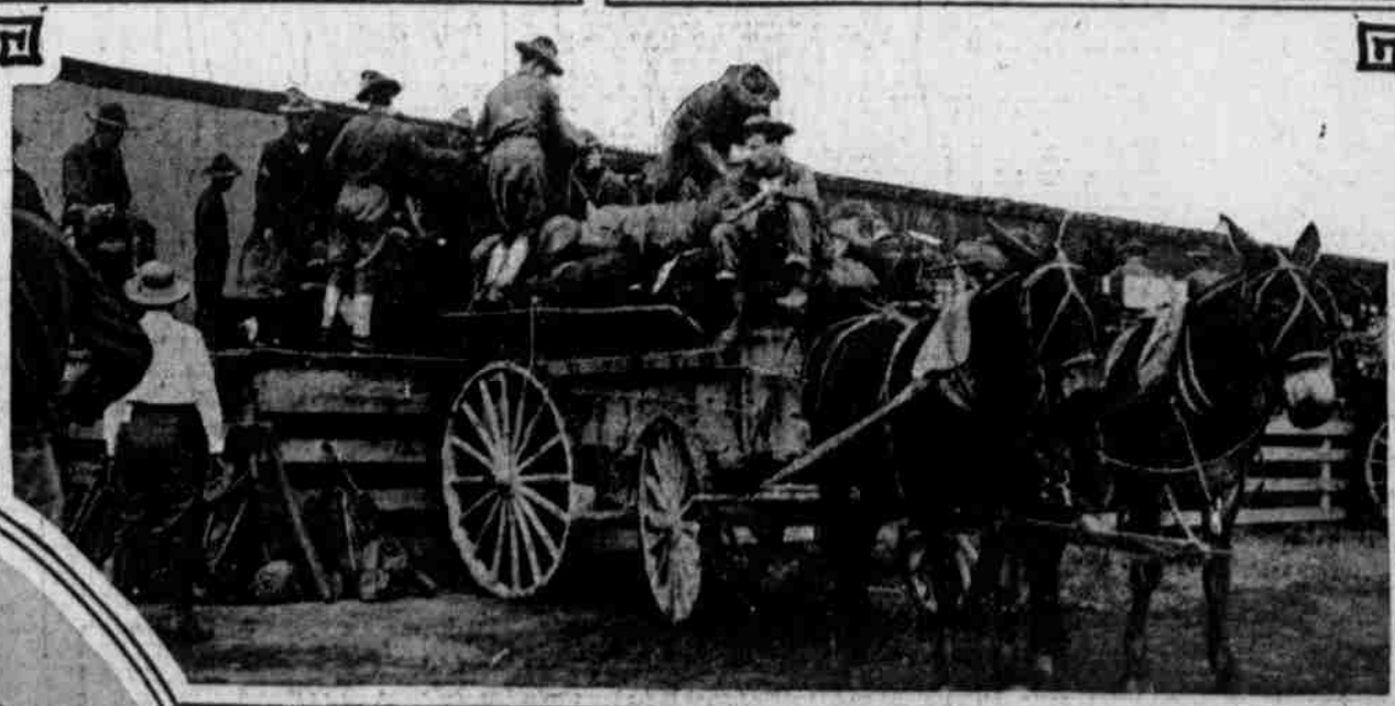
TROOPERS UNLOADING SUPPLIES AT BROWNSVILLE The 26th Infantry at the Mexican frontier.

This one-armed watchman at the central crossing between Shiloh and Bridgton, N. J., gets his winter supply of tubers free by exacting a toll from each load that passes his way. It is cheerfully given.