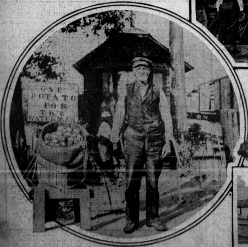
POTATOES COME EASY TO THIS MAN

This one-armed watchman at the central crossing between Shiloh and Bridgton, N. J., gets his winter supply of tubers free by exacting a toll from each load that passes his way. It is cheerfully given.