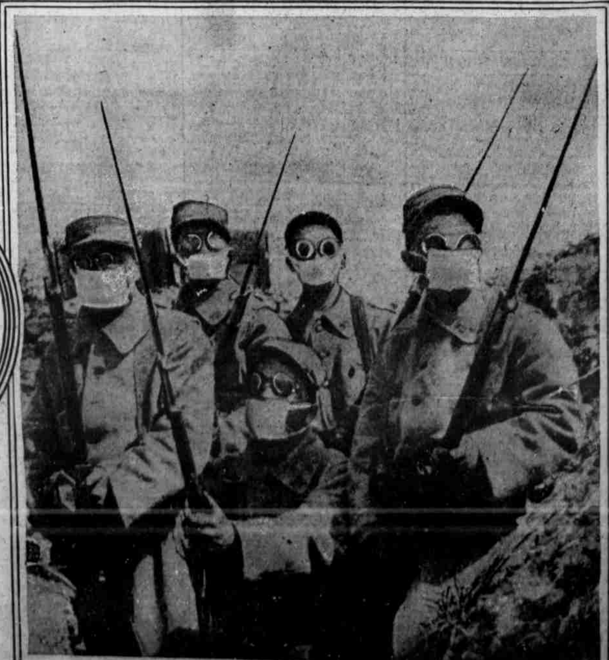
GAS BOMBS HAVE CHANGED EUROPE'S SOLDIERS INTO GROTESQUE APPARITIONS The antiquarian of the future who finds this photograph in old archives will probably decide that these French soldiers, in respirators and goggles, were raiders from some mysterious planet, perhaps Mars.