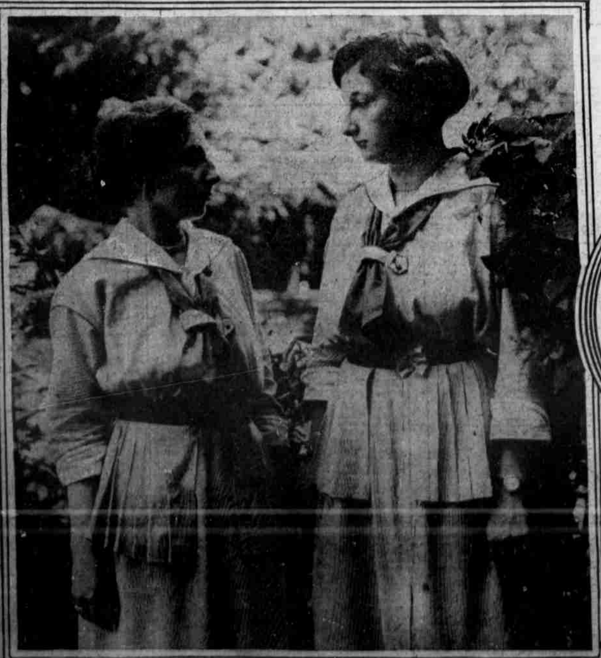
DAUGHTERS OF THE NEXT CZAR WHO MAY BE DRAWN INTO WORLD WAR The Princess Eudoxia, on the right, and the Princess Nadejda, respectively, 17 and 16, are shown on the grounds of the palace of their father, Ferdinand of Bulgaria. They have what is known in Europe as the typical "Coburg nose."