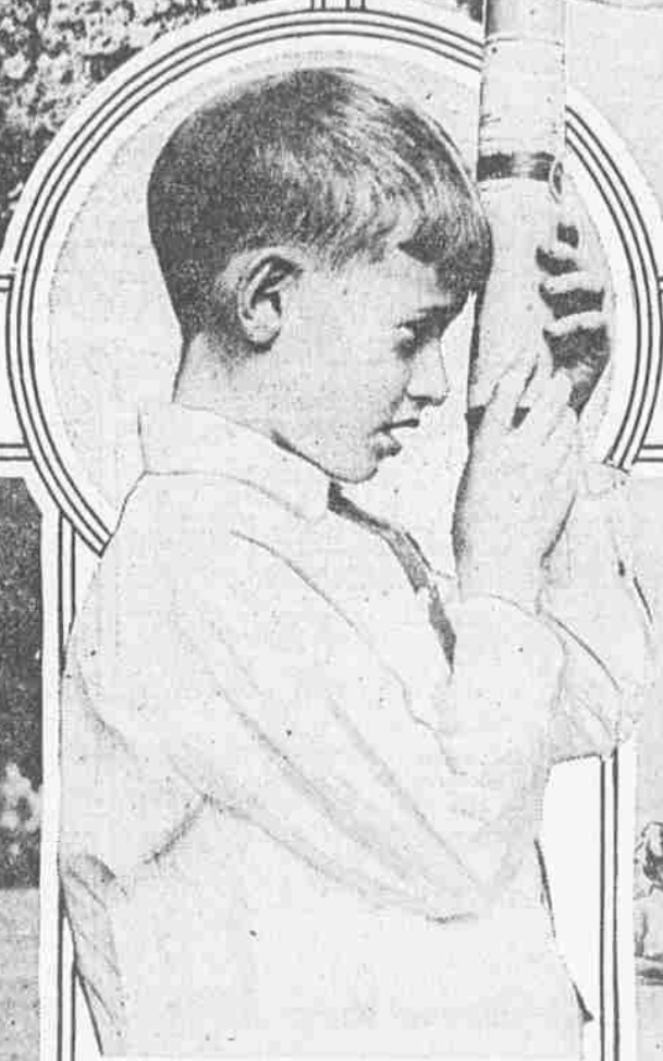
PERISCOPE IS LATEST TOY

The closeness of the opposing trenches to each other on the western front has made the British realize that if the Germans are to be driven out of France and Belgium it must be largely at the point of the bayonet, hence thrusting tournaments are now popular.