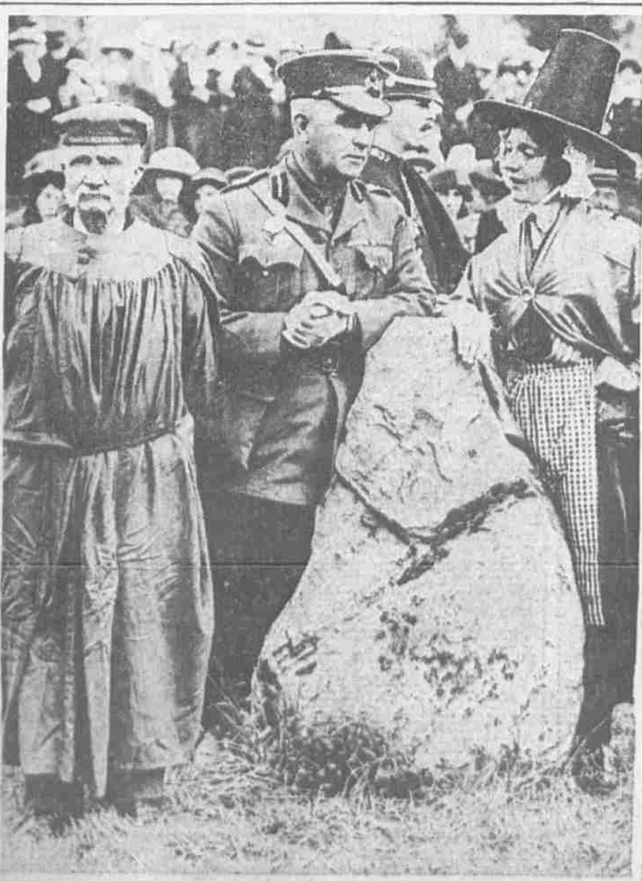
CANADIAN GENERAL AT WELSH EISTEDFODD

The picture was taken at 9th and Race streets when the American Rescue Workers took several score of youngsters off for a day in the open at Willow Grove Park.