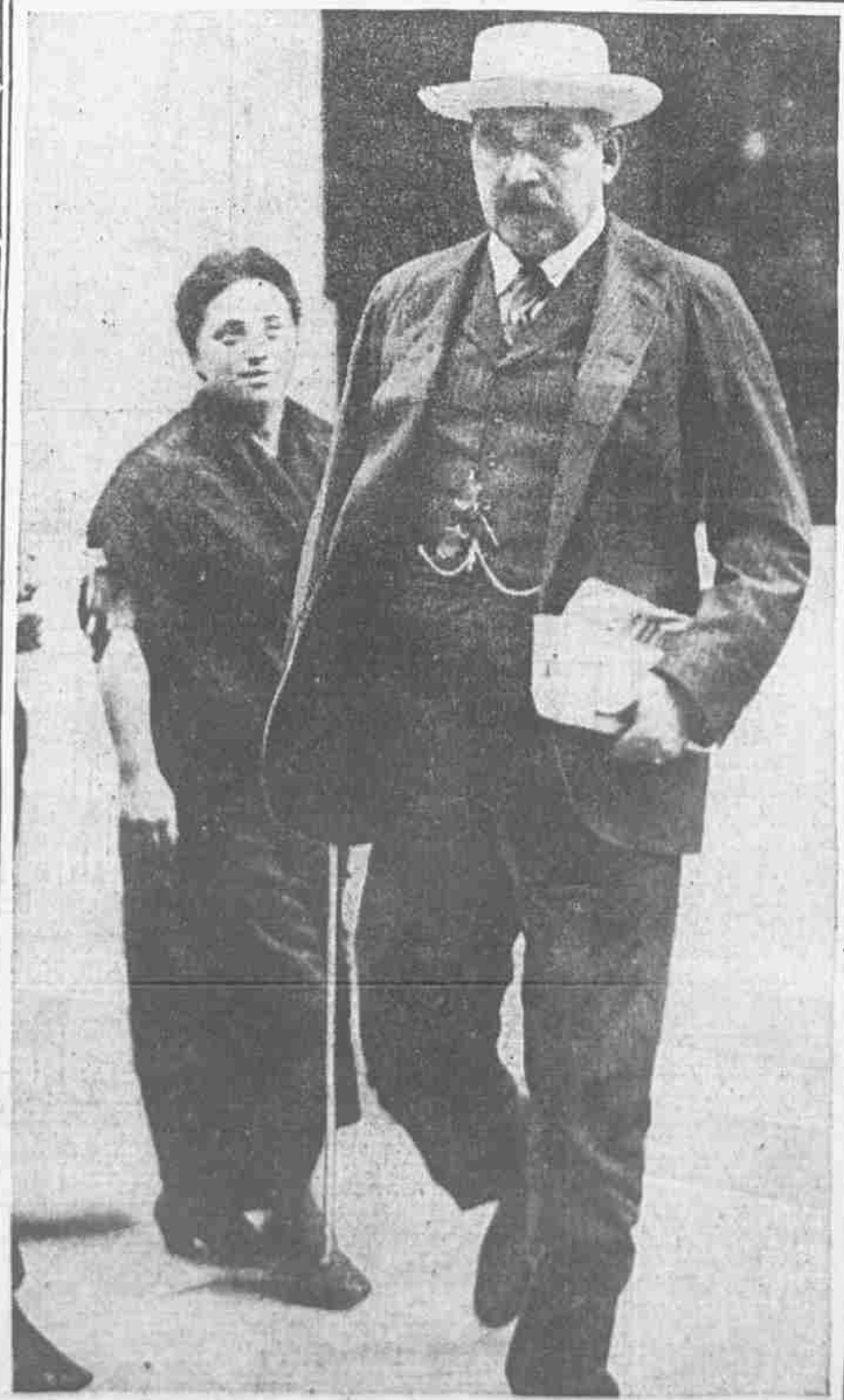
J. P. MORGAN RETURNS TO WALL STREET

General Sam Hughes is shown surrounded by participants in this, the survival of ancient Druidical rites. A contest for musicians is always included. The fete was held at Bangor, Wales, August 3.