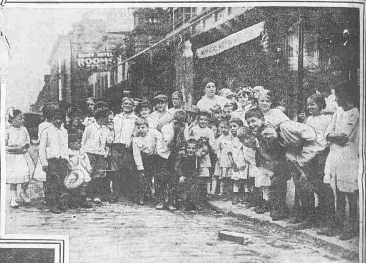
URCHINS OF THE STREET JOYFUL AT PROSPECT OF PICNIC

The prominence given to the activities of the submarine in the war was bound eventually to be reflected in the toy world.