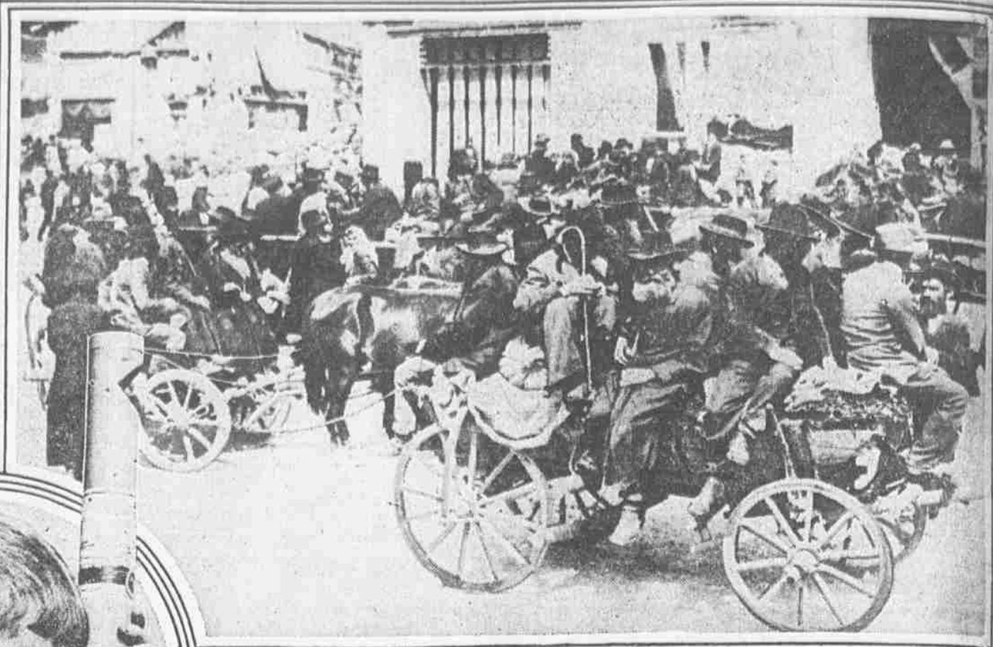
JEWISH FAMILIES FLEEING FROM WAR-TORN GALICIA

It is estimated that this was the sum expended in the bombardment of San Marino, smallest republic on earth, when this wine cellar was the only thing struck. The other shells fell harmlessly in the fields.