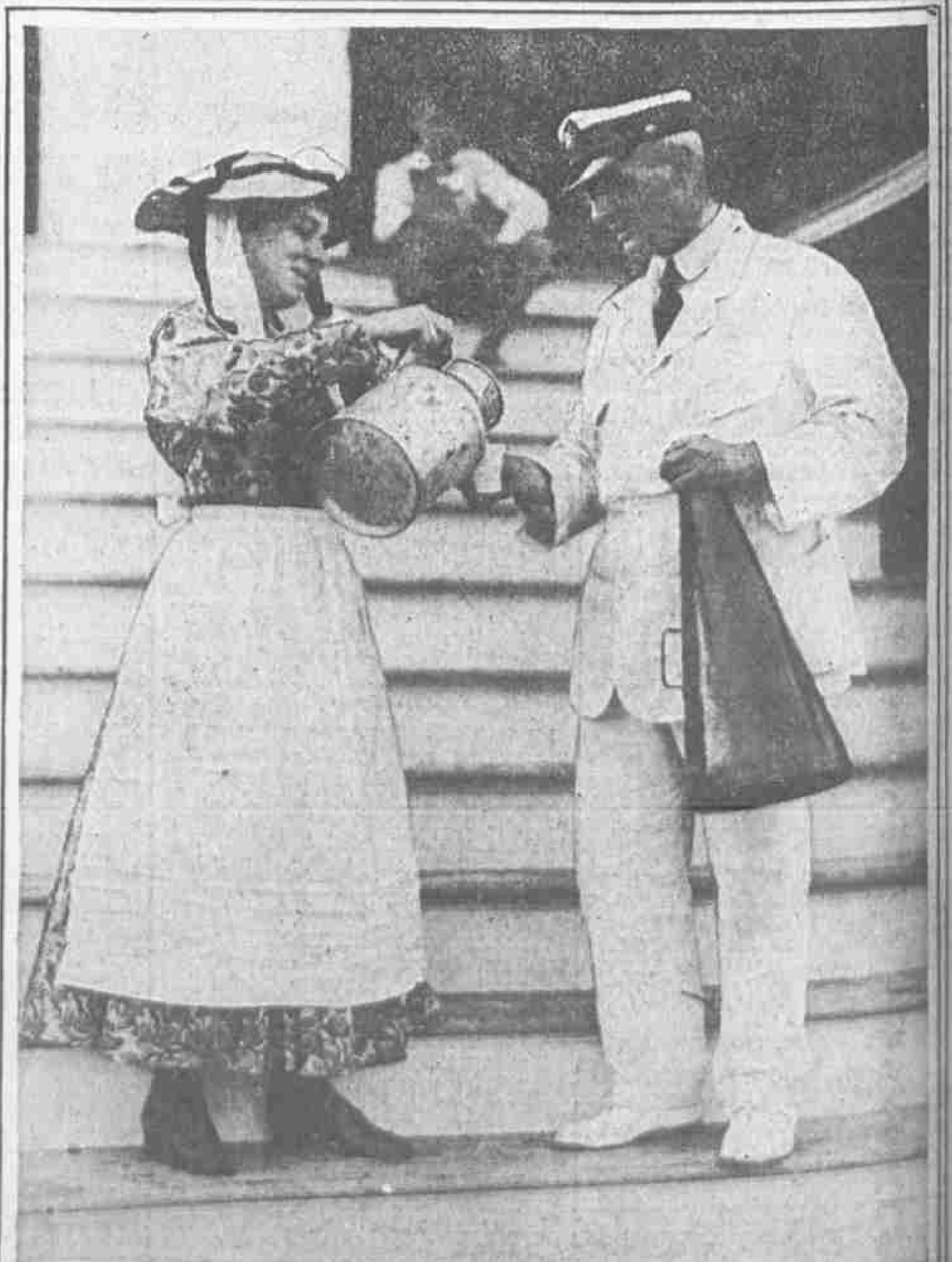
SEEN AT THE CHELSEA YACHT CLUB'S FESTIVAL