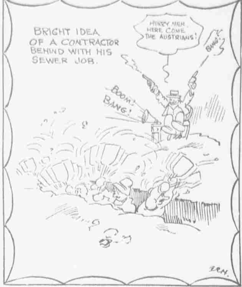
DID IT EVER HAPPEN TO YOU?