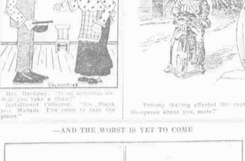
AND THE WORST IS YET TO COME