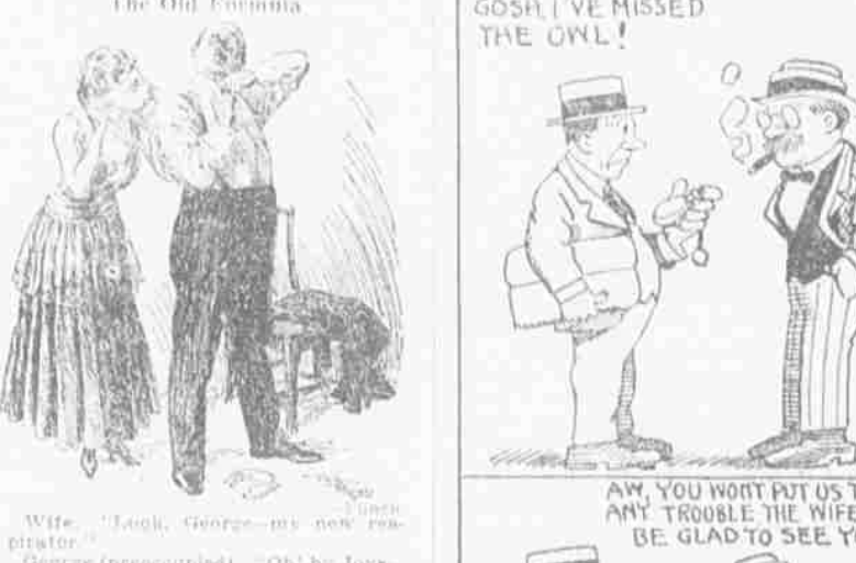
A Noisy Member