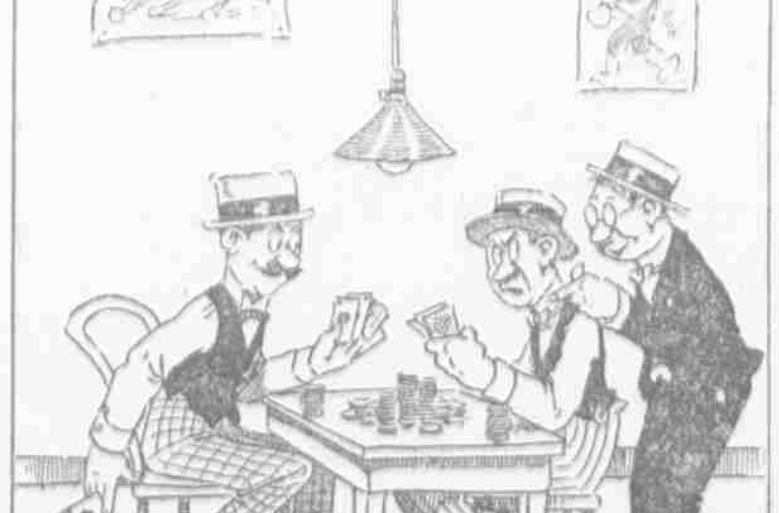
HEN WAS PRACTICAL