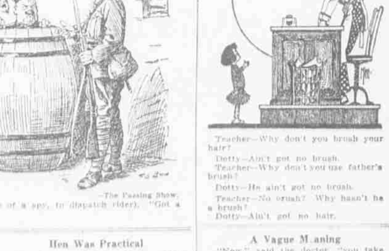
HEN WAS PRACTICAL