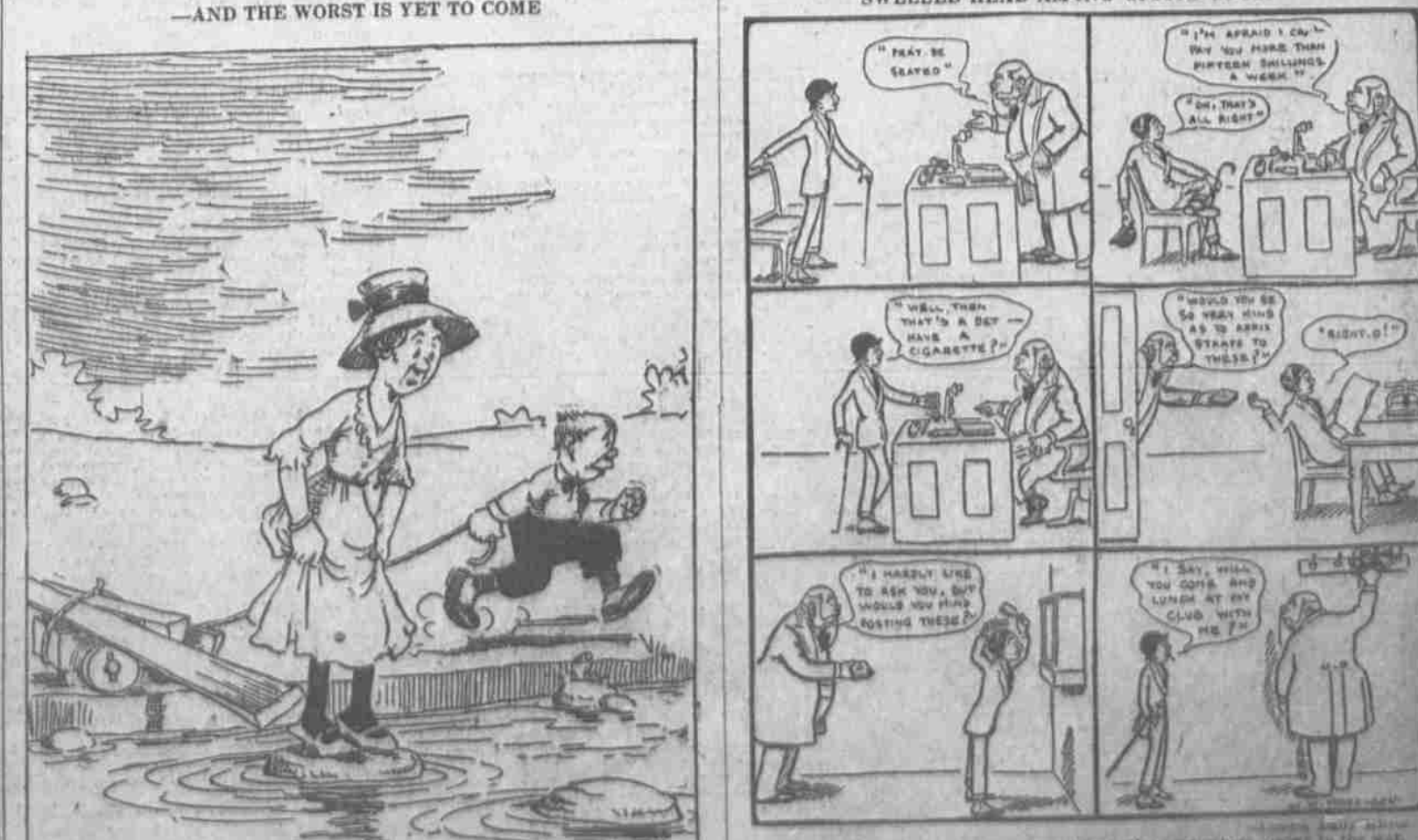
Will it grow to the size suggested here? For years when coming in the city, boy labor is growing scarce. That means that anybody will do any job or work word to the higher-paid office boy now.