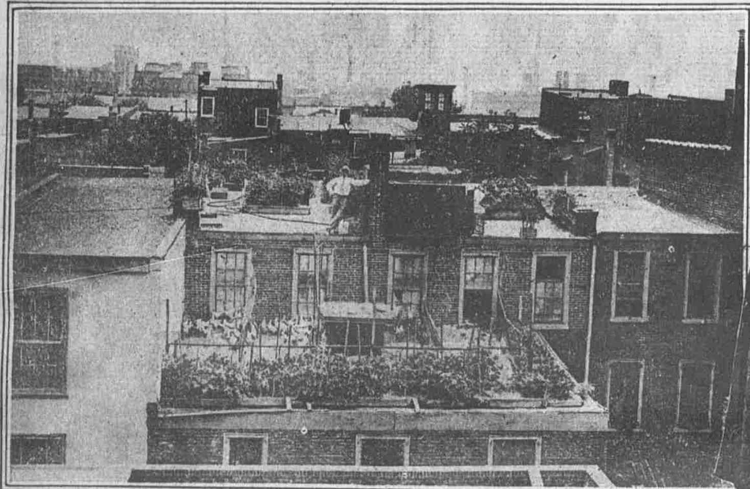
SHOWING HOW KONOLLMAN OPERATES FARMS ON TWO DIFFERENT ROOF LEVELS