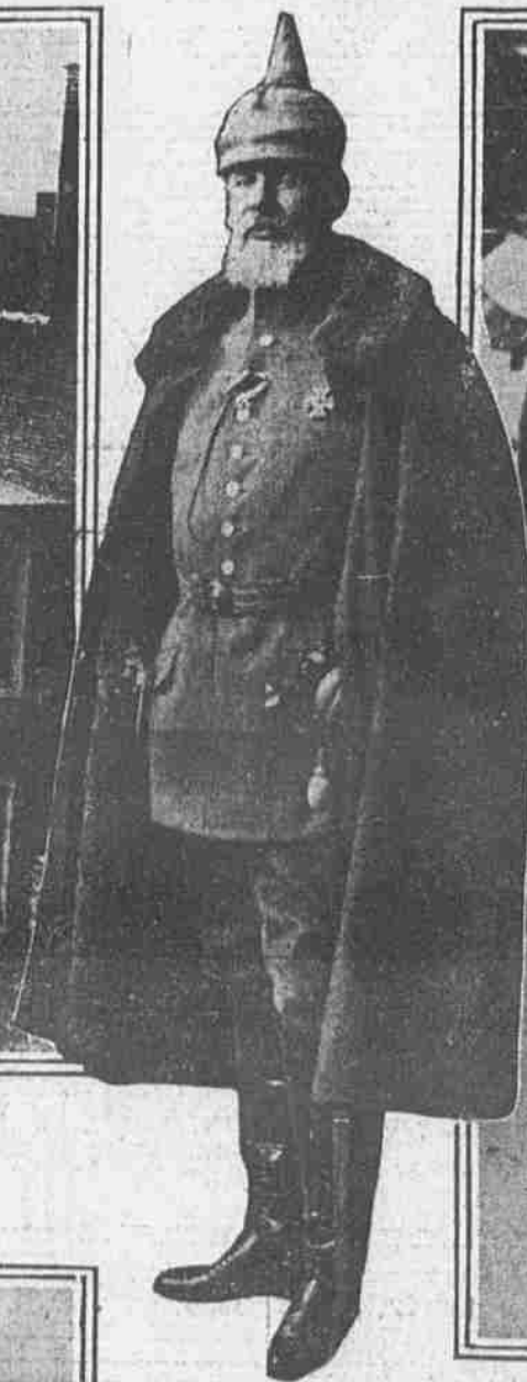
CONQUEROR OF WARSAW Prince Leopold.