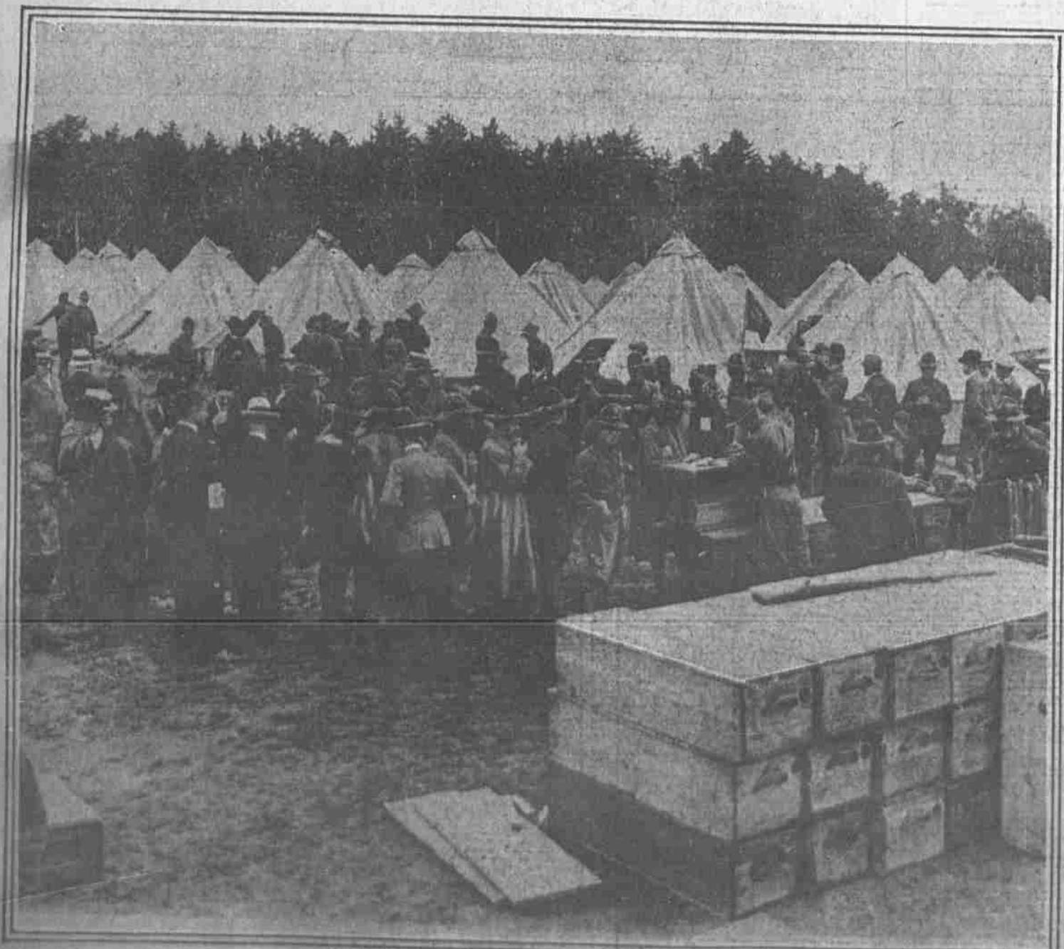
PLATTSBURG, N. Y., CAMP WHERE BUSINESS MEN ARE TAKING A COURSE IN MILITARY TRAINING. The picture shows the line-up for the distribution of equipment. Some of the recruits are in their first uniform. Others have not yet had time to put aside their citizens' clothes.