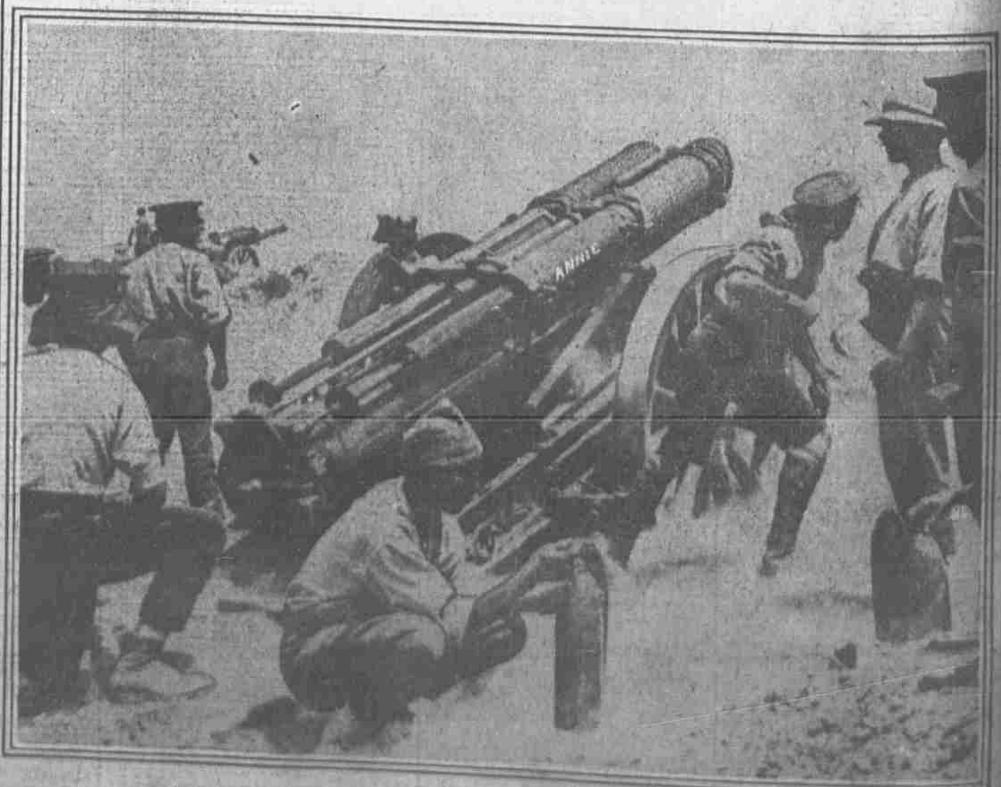
AN ENGLISH GUN IN THE DARDANELLES One of the English guns in action on the Gallipoli Peninsula. Its crew have affectionately christened the powerful weapon "Annie," and have painted the name on one of the two cylinders.