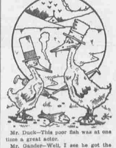
Mr. Duck—This poor fish was at one time a great actor. Mr. Gander—Well, I see he got the hook after all!