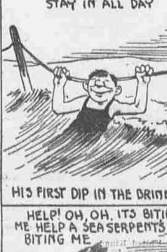
His first dip in the drine