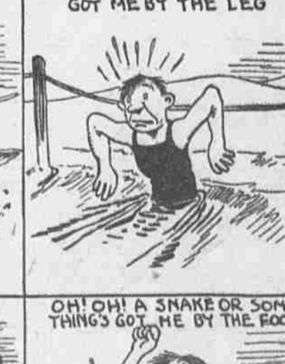
Help! Oh, oh, its biting me help a sea serpents biting me