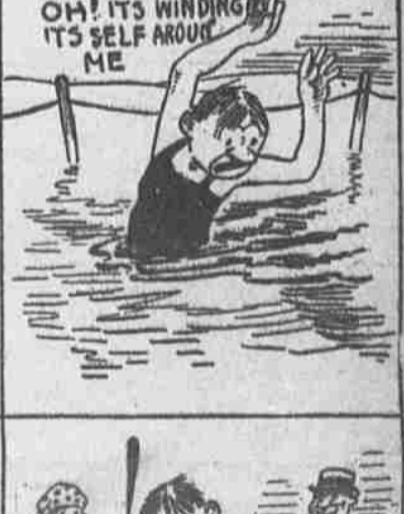
How women help (According to the Pictorial Dailies)