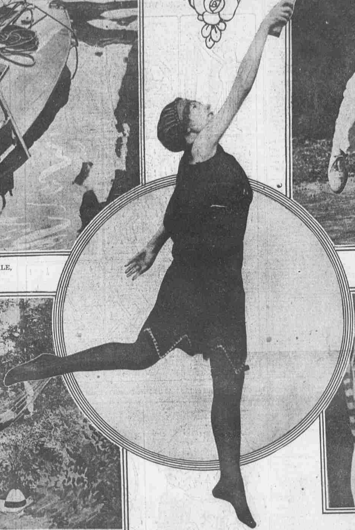
THE LATEST BEACH FAD—TENNIS IN A BATHING SUIT