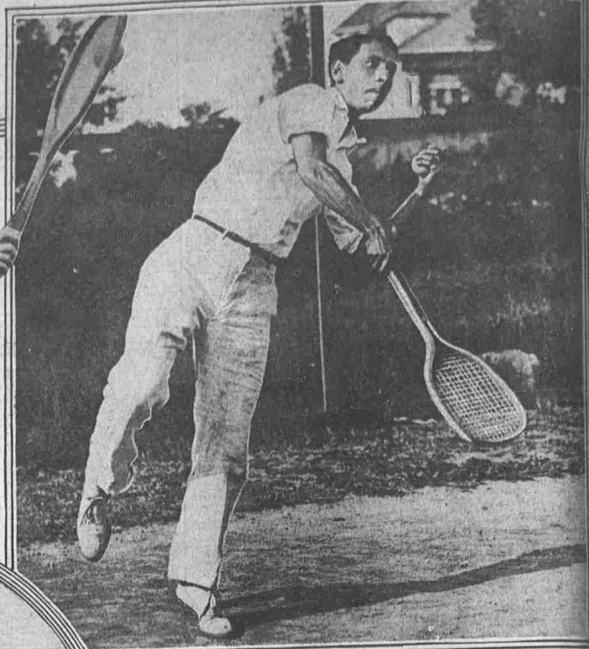
"F. P. A.," POPULAR PARAGRAPHER, AT HIS FAVORITE SPORT