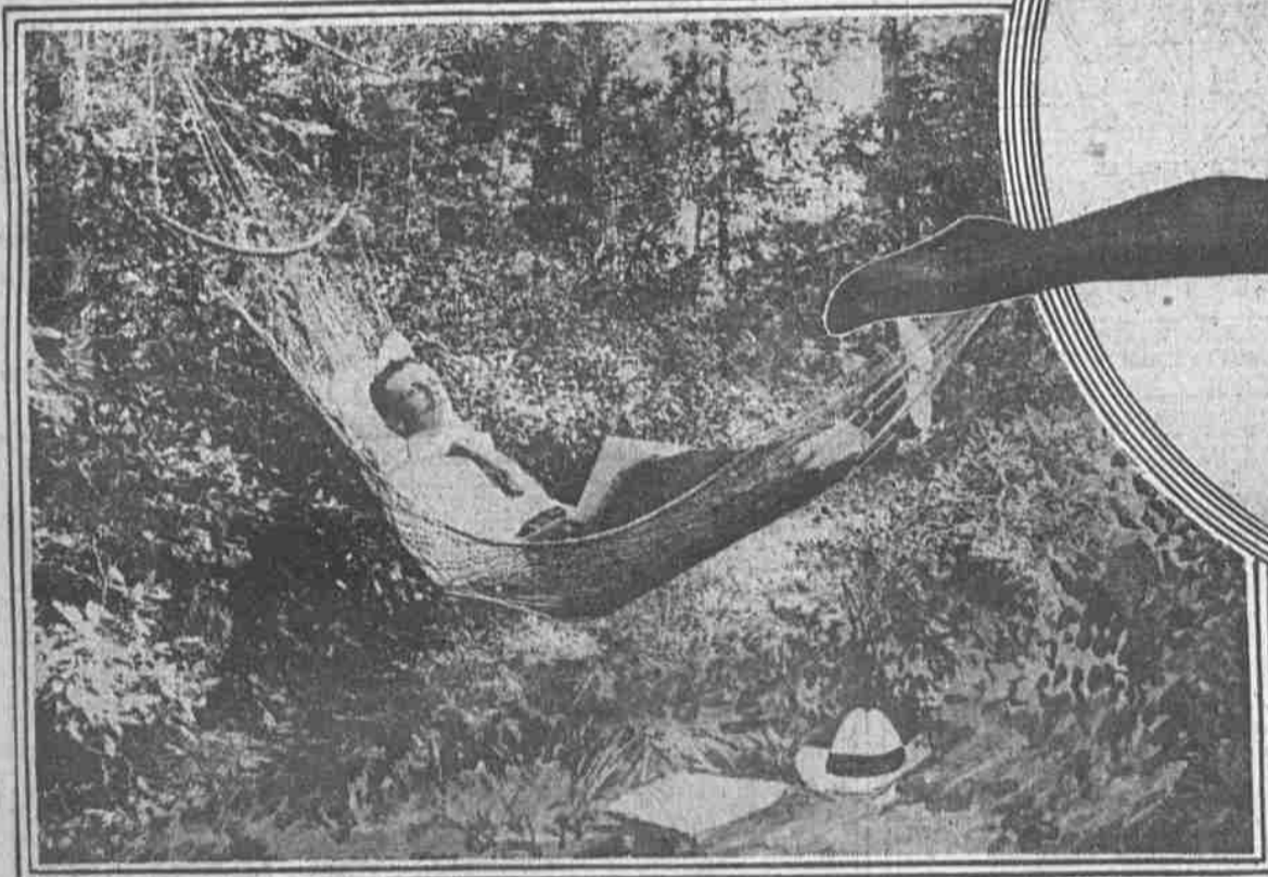
"THIS IS THE LIFE"; JUST OUTSIDE A JERSEY CAMP