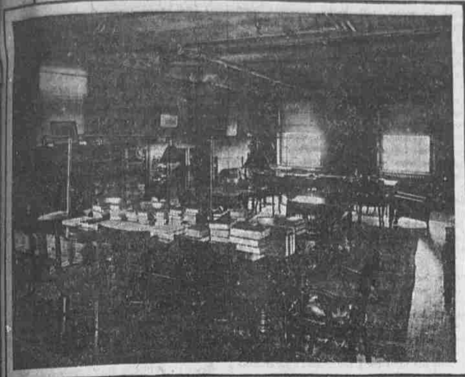
LIBRARY AND READING ROOM Containing the valuable Reference Library of the School