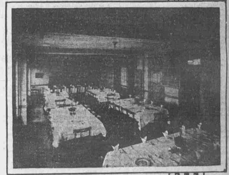
DINING-ROOM Conducted for the convenience of Peirce School Students