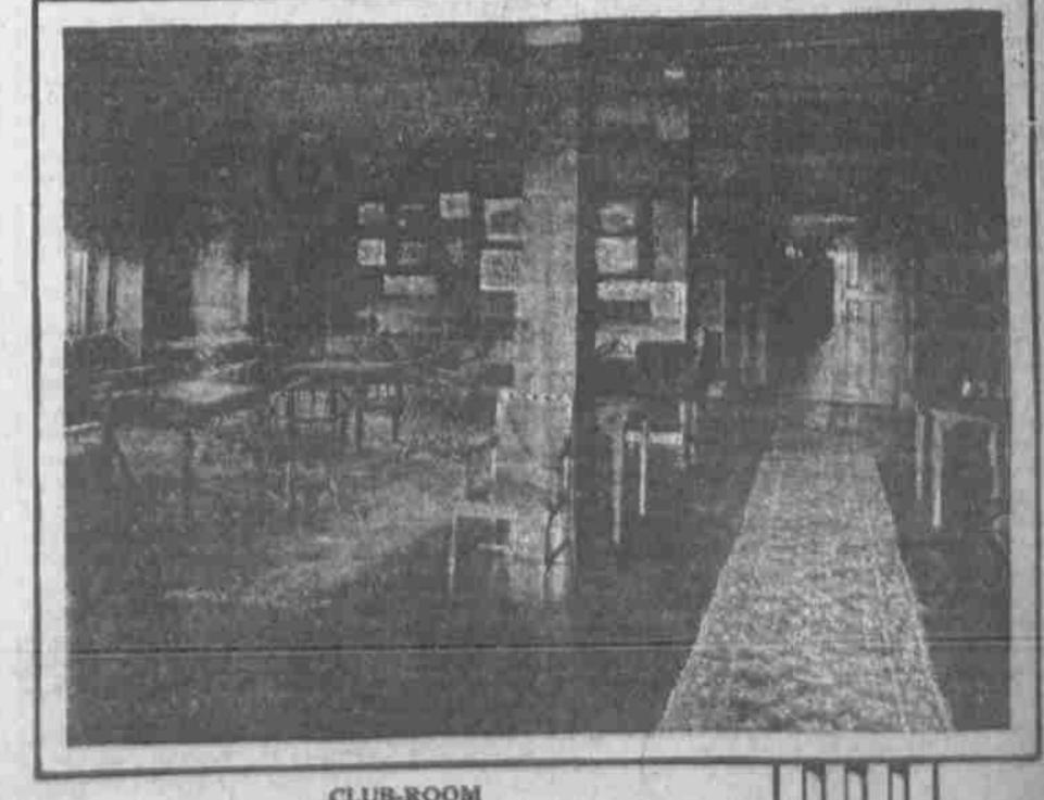
CLUB-ROOM To be devoted to recreation purposes of students