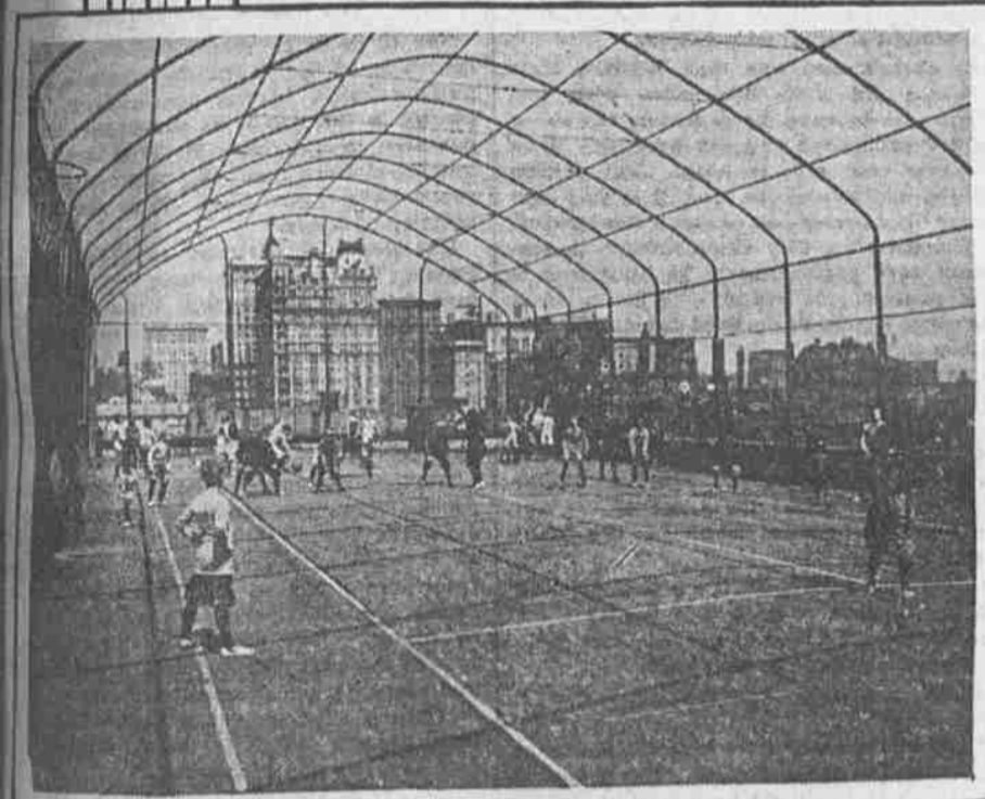
CAGE-COVERED ROOF Practically every outdoor game but golf can be played on this roof