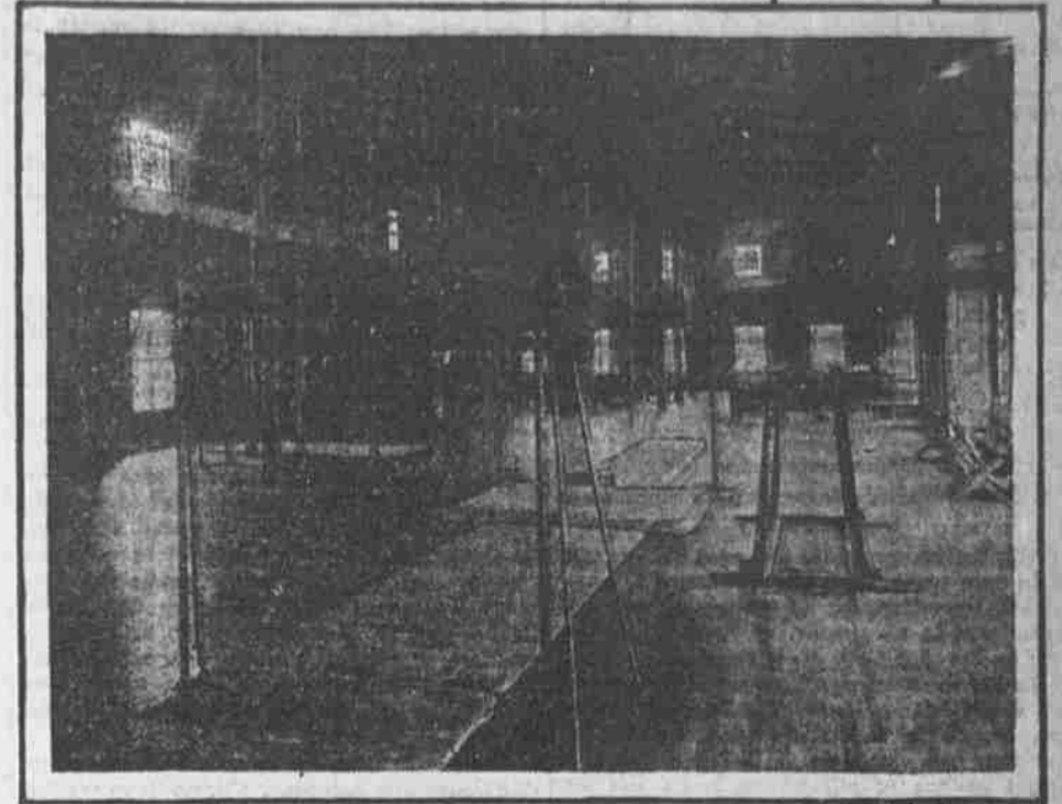
GYMNASIUM Physical development keeps pace with mental at Peirce School