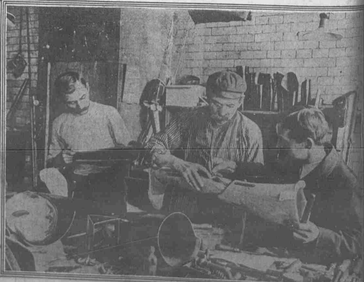
AN INDUSTRY VASTLY STIMULATED BY THE ARMAGEDDON IN EUROPE