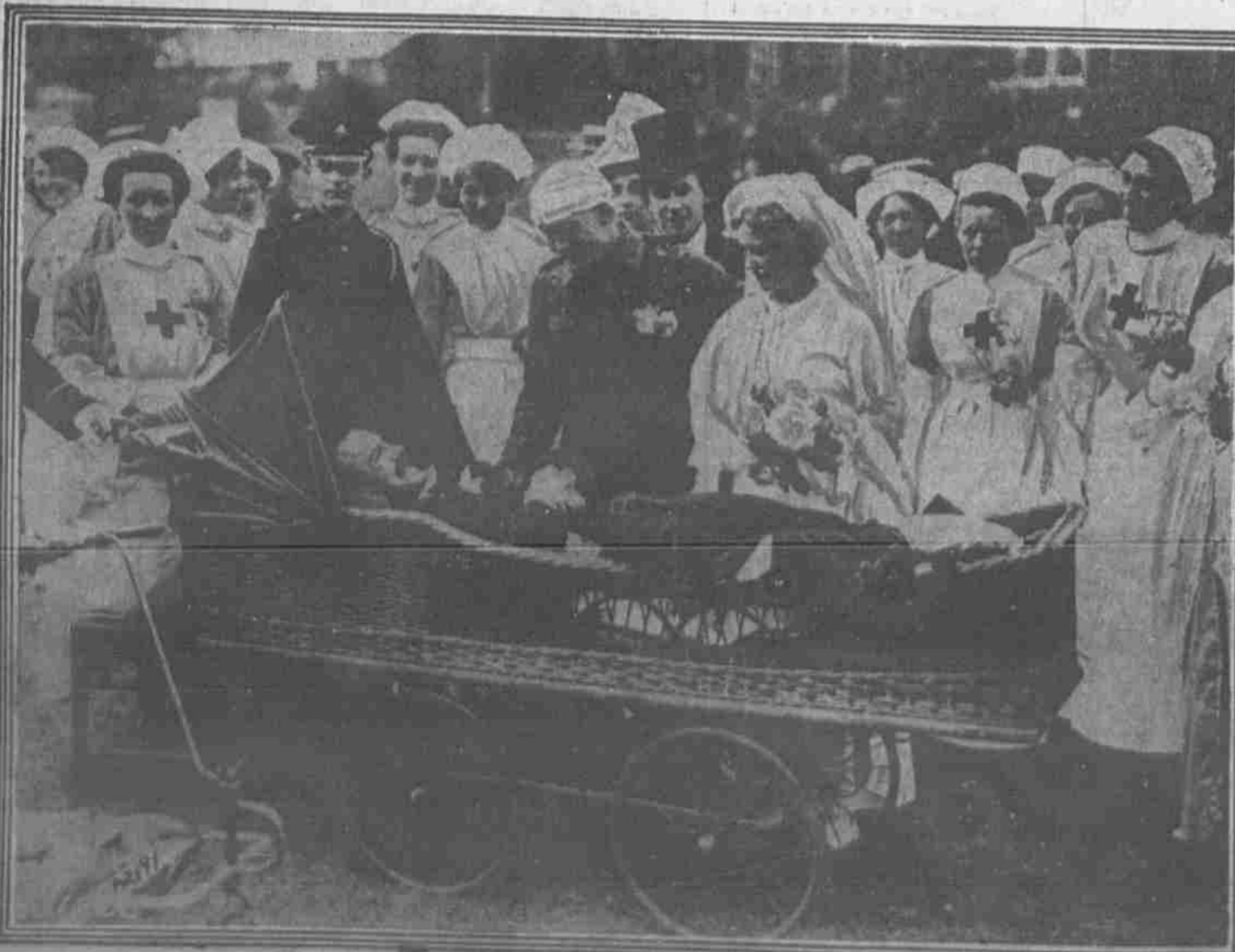
CANADIAN GIRL RUSHES ACROSS OCEAN TO WED HER WOUNDED SOLDIER LOVER

Edward O'Dwyer, winner of the Victoria Cross, is shown speaking to a throng by the side of one of the famous lions around the Nelson Monument, in Trafalgar Square, London. This is a new plan of the Government to reinforce its poster advertisements calling for the youth of the land to come to the aid of the hard-pressed Empire.