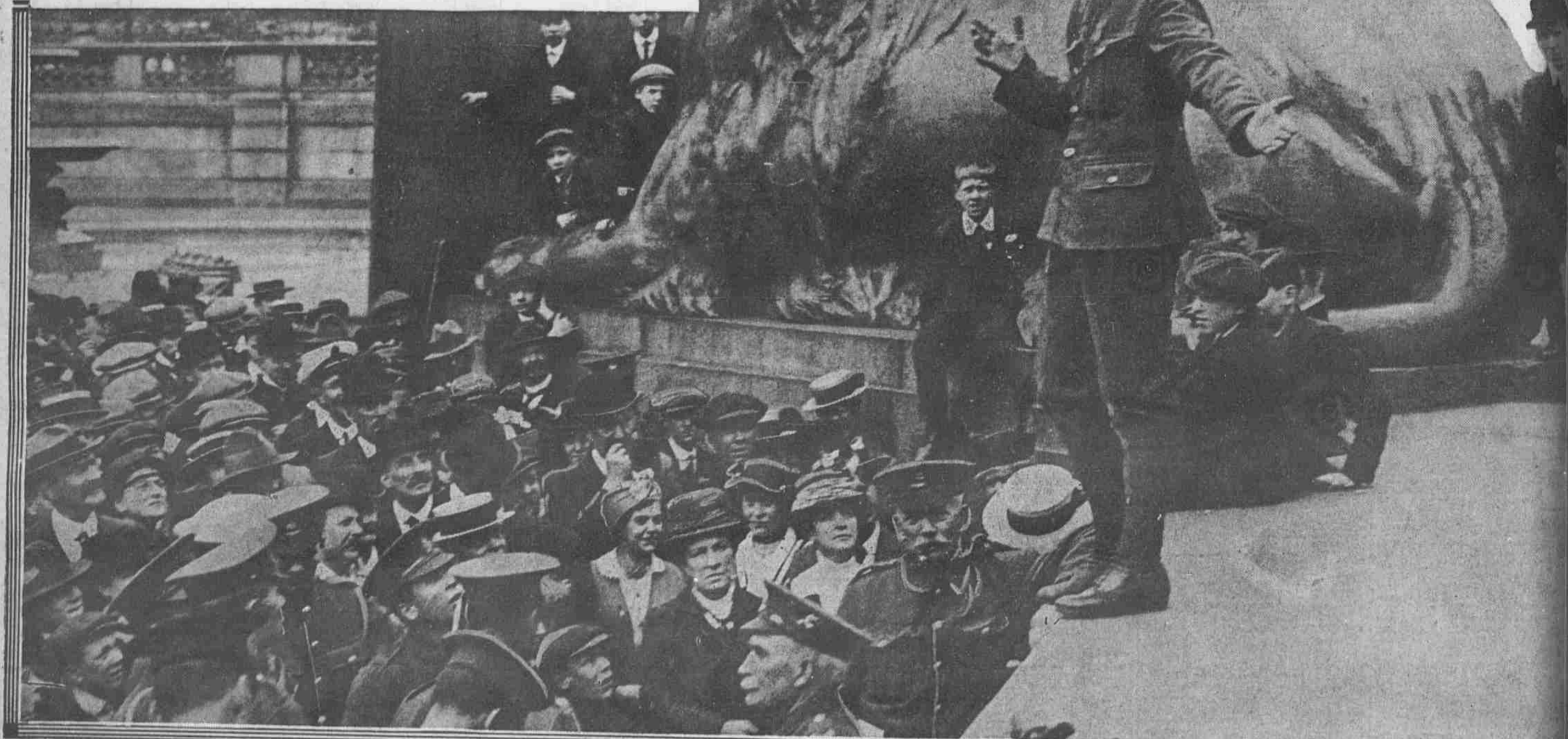
GREAT BRITAIN USES ITS WAR HEROES AS OPEN-AIR ORATORS IN EFFORT TO STIMULATE LARGE FLOW OF RECRUITS

Edward O'Dwyer, winner of the Victoria Cross, is shown speaking to a throng by the side of one of the famous lions around the Nelson Monument, in Trafalgar Square, London. This is a new plan of the Government to reinforce its poster advertisements calling for the youth of the land to come to the aid of the hard-pressed Empire.