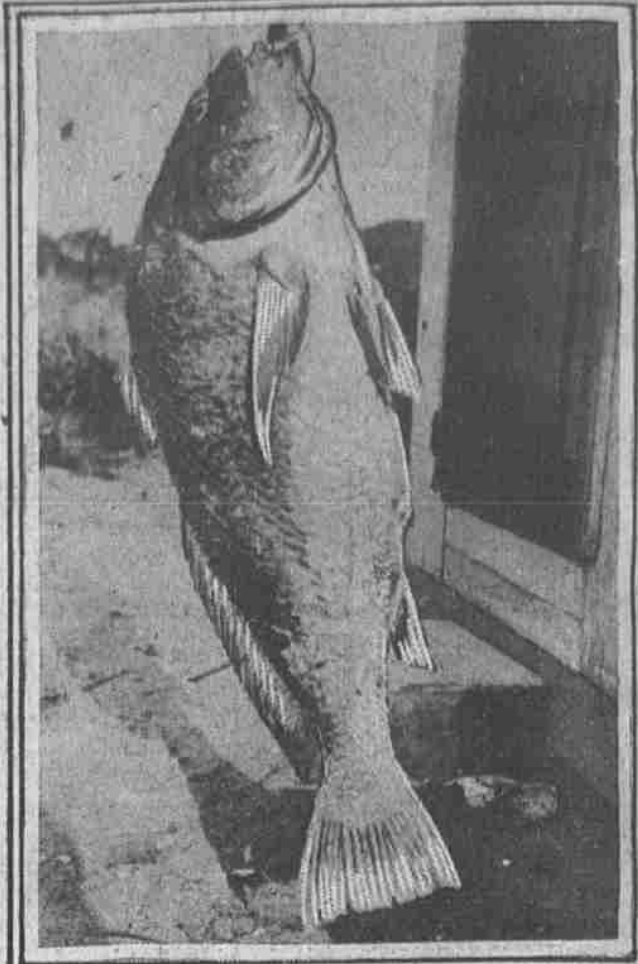
60-POUND DRUM CAUGHT AT WILDWOOD CREST A gamy fish that Philadelphians take by the hundred every season.