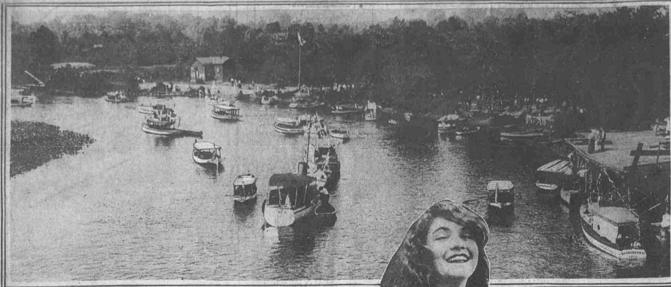
RANCOCAS CREEK AT THE WISSINOMING YACHT CLUB LANDING One of the most delightful waterways around Philadelphia for canoeing or motorboating.

NOBODY THINKS OF ANYTHING BUT GREEN FIELDS, SHADY RIVERS, SEA AND SURF ON SATURDAYS