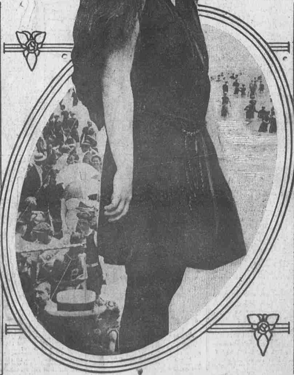
A NYMPH OF THE MIDSUMMER SURF