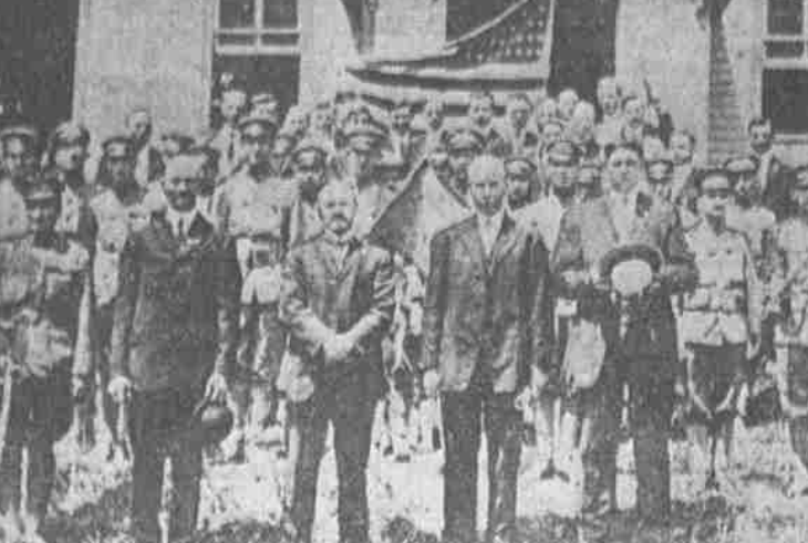
Armstrong Guard and members of the order in the Eastern District on annual outing.