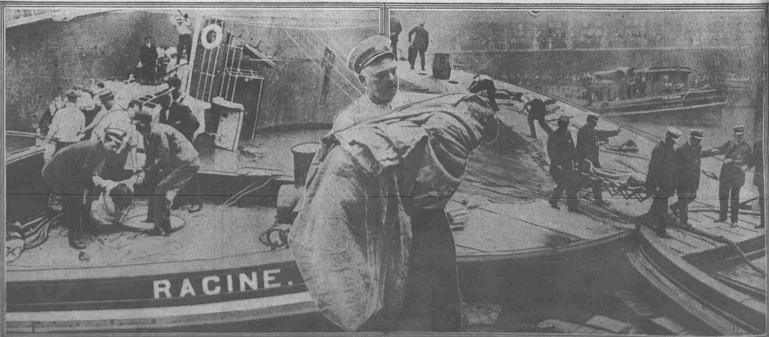
POLICE, FIREMEN AND BOATMEN REMOVING BODIES OF WOMEN AND CHILDREN, WHO COMPOSED BY FAR THE GREATER PORTION OF THE VICTIMS OF ONE OF THE WORST WATER DISASTERS IN HISTORY