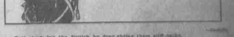
IT'S MY MOVE, TESS. GOOD NIGHT!