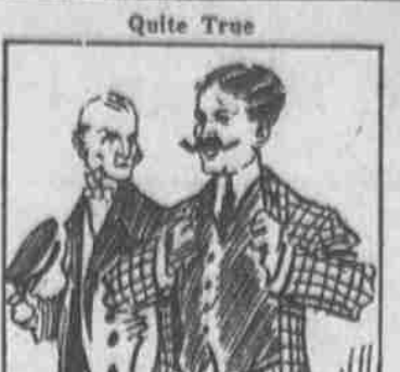
Sporteman-Murphy, you told me there was good hunting on your land. Why, we've been here an hour and haven't seen any game. Murphy-Just so, but the less game the more hunting you have.