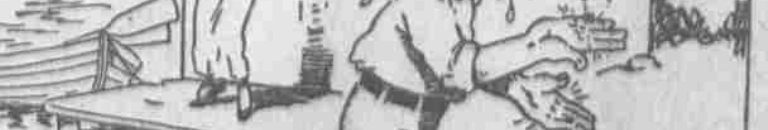
TESS BECOMES ABSORBED IN THE GAME AND THE VILLAIN'S ACCOMPICE SNEAKS IN GRABS A BAG OF CHANGE.