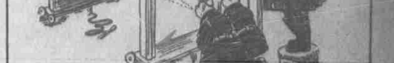
HELLO, TESS! WANNA PLAY A GAME OF CHECKERS? WHILE THEY ARE PLAYING, THE VILLAIN'S ACCOMPICE STEALS A BAG OF MONEY.