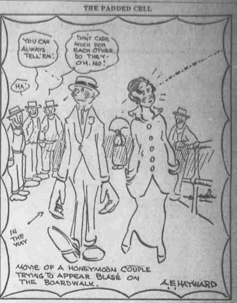
MOVIE OF A HONEYMOON COUPLE TRYING TO APPEAR BLASE ON THE BOARDWALK. LEHAYWARD