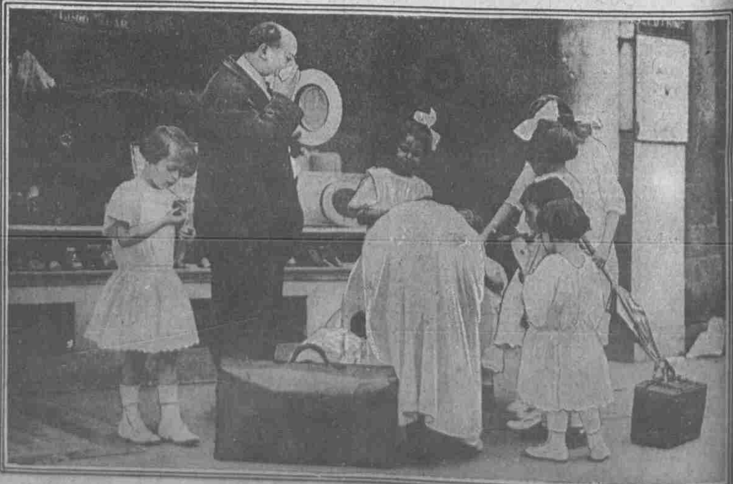
A PICTURE TO ROUSE THE SYMPATHY OF HUSBANDS AND FATHERS This snapshot at the ferry, by an Eyewitness Lensman photographer, reveals a substantial citizen about to depart with his family on a vacation. Having surveyed the sight—wife and seven girls—thus far, he pauses to mop his steaming countenance. One can almost hear him say "Whew!"