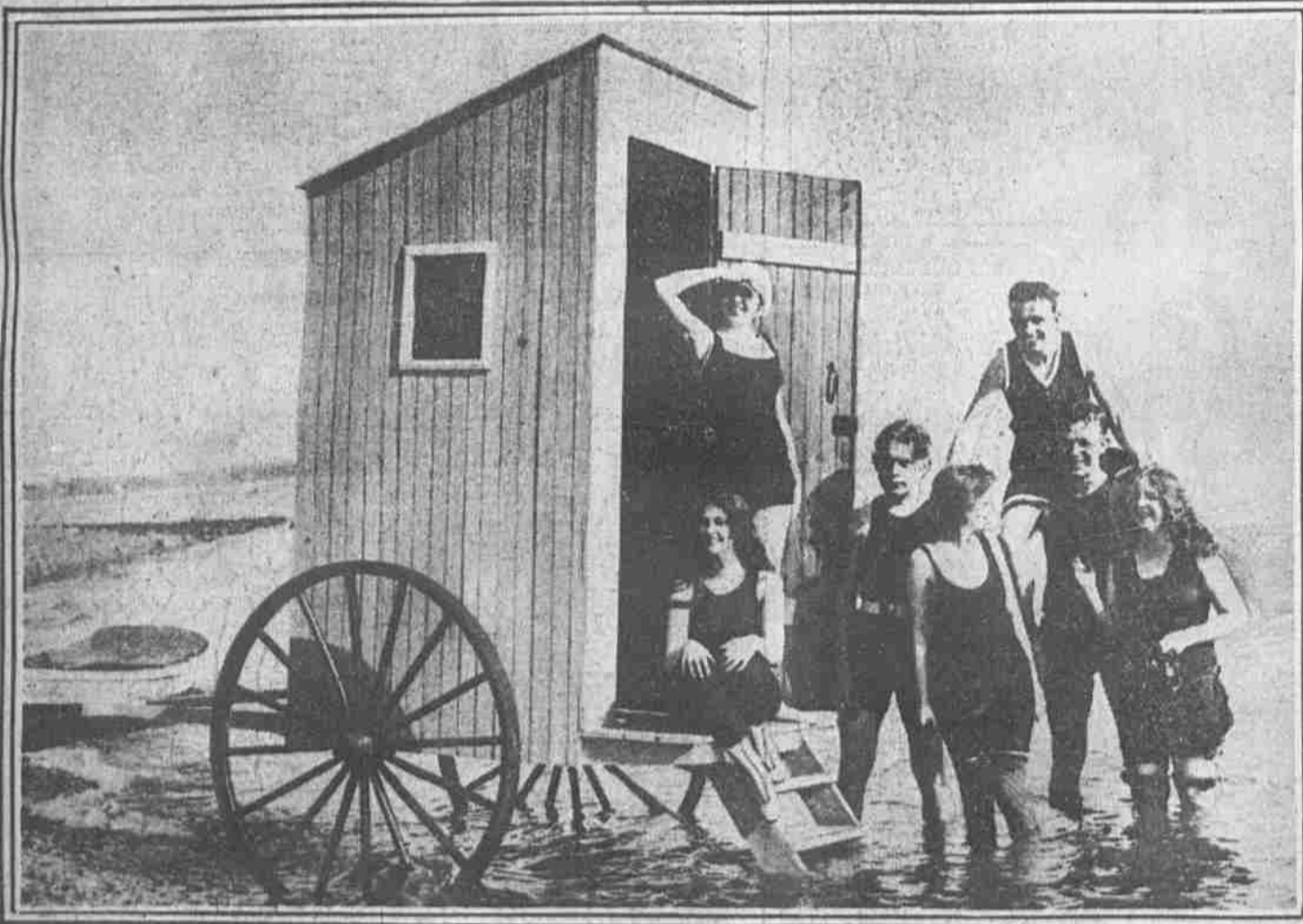
CONTINENTAL BATHING COSTUMES REACH AMERICAN SHORES The skirtless bathing suit and the bathing machine, which long have been favored at seashore resorts in Europe, like Ostend, Trouville and Scheveningen, are being tried out, as shown here, at City Island, New York.