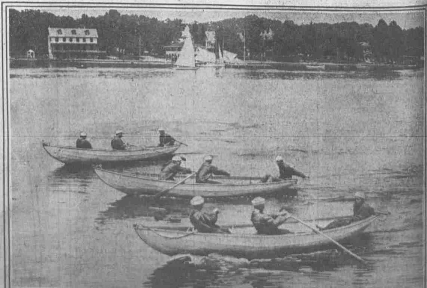
SEA SCOUTS HOLD BOAT RACES ON PRACTICE OUTING Members of the nautical branch of the Philadelphia Boy Scouts are now learning the art of rowing on the houseboat Young America, which is based at Island Heights, N. J., in Barnegat Bay.