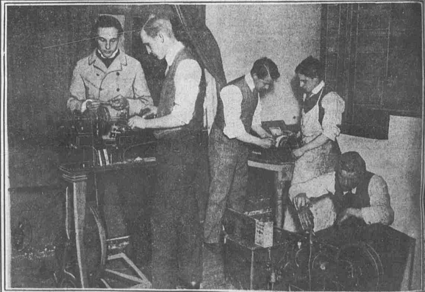
CHURCH VESTRY TRANSFORMED INTO MUNITIONS FACTORY This picture shows the remarkable situation that has arisen in England, where pastors are urging their congregations to aid in the making of powder and shells. The view here is from St. James' Church of Scotland, Lealwick, London.