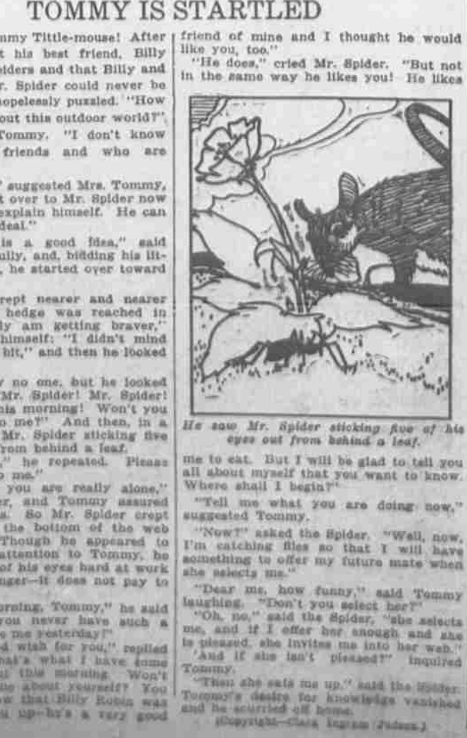
He saw Mr. Spider sticking out of his eyes out from behind a leaf.

friend of mine and I thought he would like you, too. "He does," cried Mr. Spider. "But not in the same way he likes you. He likes me to eat. But I will be glad to tell you all about myself that you want to know."