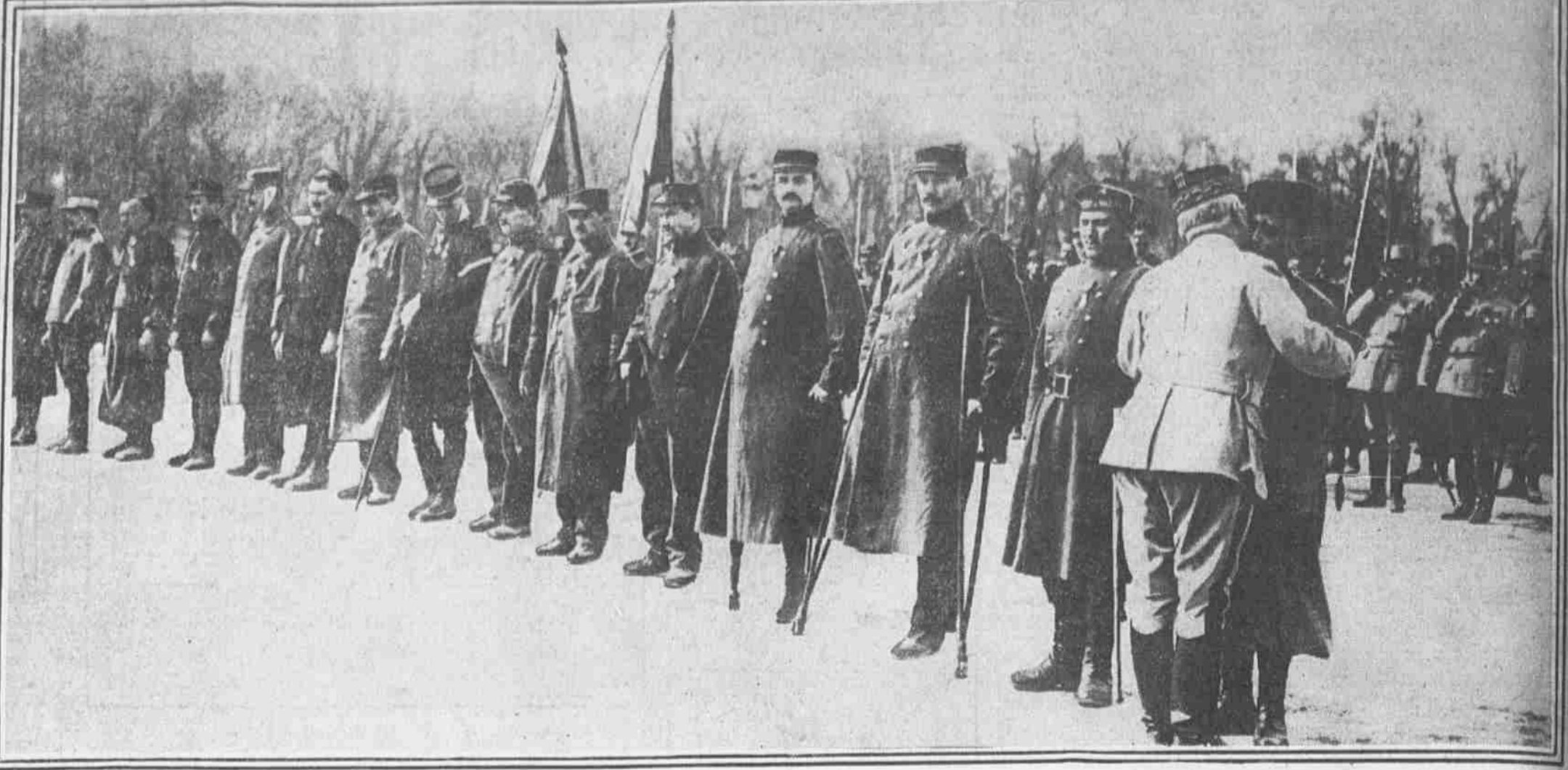
HONORS PAID TO HEROES OF BATTLE AT REVIEW IN PARIS General Gallopin is shown kissing one of the soldiers who have just been decorated for gallantry in action. The ceremonies took place at the Place des Invalides, where the tomb of Napoleon is situated, while all Paris looked on and applauded. The men decorated include members of all branches of the service. Some of them are wounded.