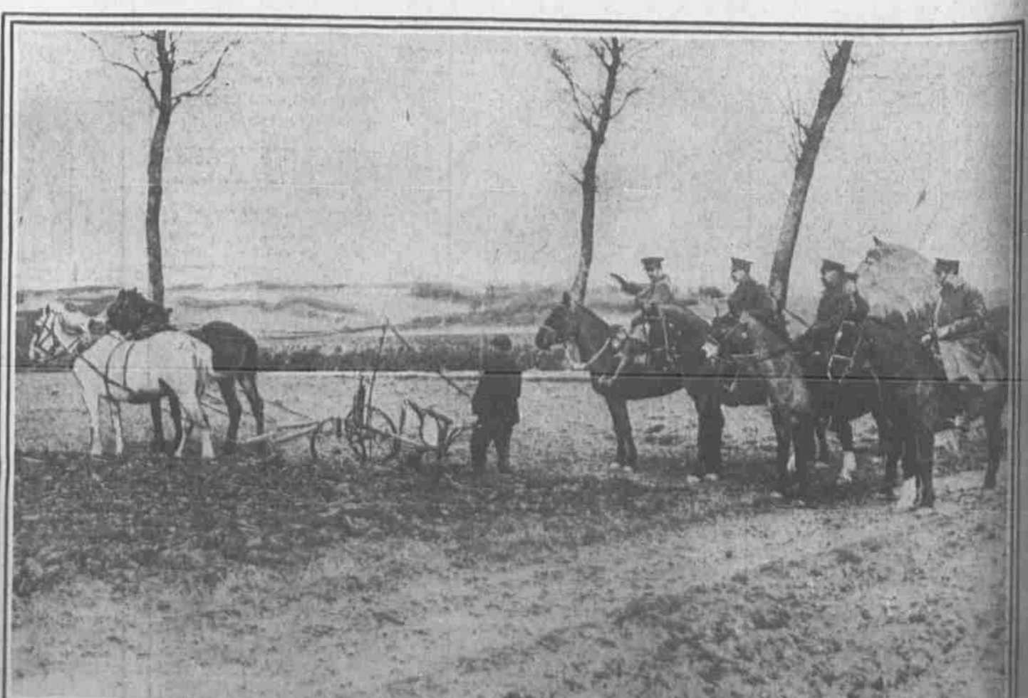
BRITISH CAVALRY HALT TO QUESTION TOILING FRENCH PEASANT They are some of the strange figures which war has cast upon the face of sunny, peaceful France. The scene is typical of the French farming country—long, rolling hills covered with squares and rectangles of green-marking-growing crops.