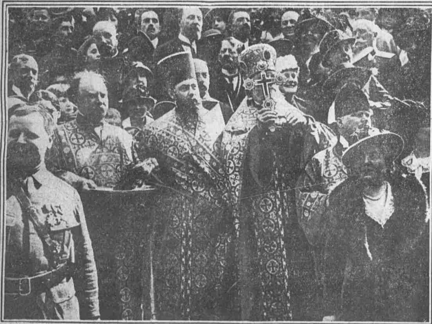
RUSSIAN HIGH PRIEST BLESSES AMBULANCES PRESENTED TO FRENCH ARMY The Russian Society recently made a gift to the French Government of a completely equipped ambulance corps. At the ceremonies of presentation all residents of Russian blood attended, including prominent ecclesiastics.