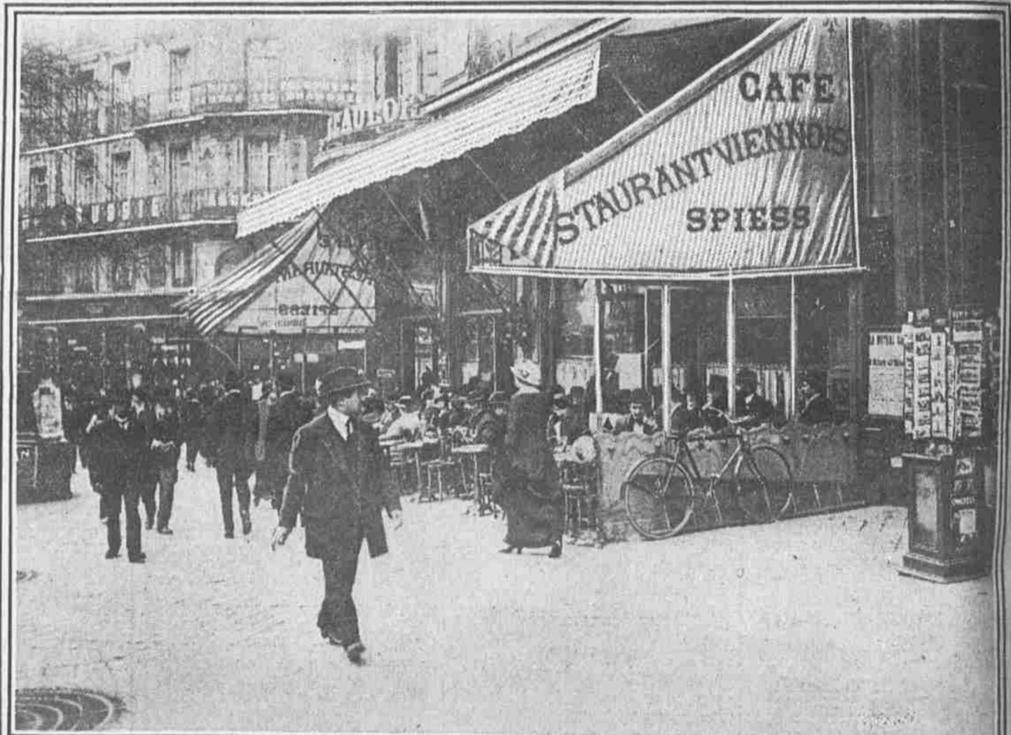
THE SIDEWALK CAFES OF PARIS IN WAR TIME Not even the ever-present gloom of the overhanging war cloud has driven the inhabitants of the capital away from their favorite places of refreshment. Few men of military age, however, are visible.