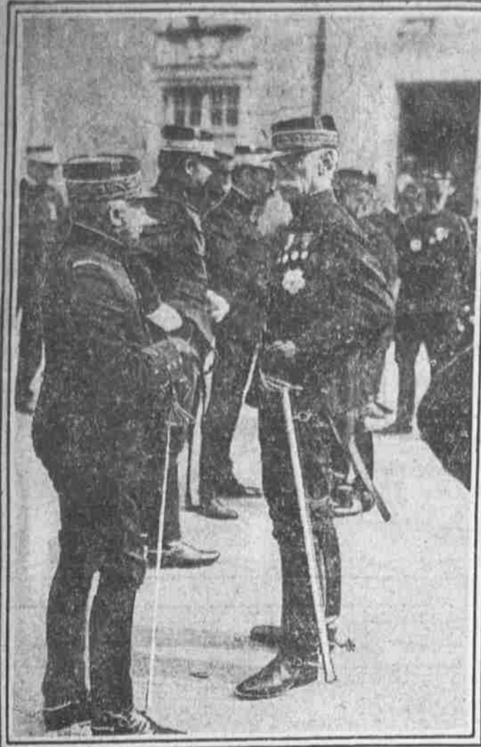
FAMOUS COMMANDER AND HIS OFFICERS General Gallieni (wearing medals) was in command of the Paris garrison at the time it was hurled upon the Germans at the battle of the Marne.