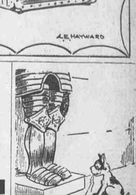
The Pup-H'm, it strikes me a feller hadn't much chance of having a bit o' fun with a slipper in those days.

Pierrot-And did you really see Man-tell in Richard III"? Was he belli-Creme Tvette-Why no. I found him rather thin.-- Lampoon.