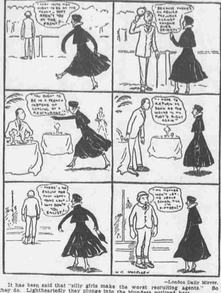
It has been said that "silly girls make the worst recruiting agenta." So they do. Lightheartedly they plunge into the blunders outlined here.