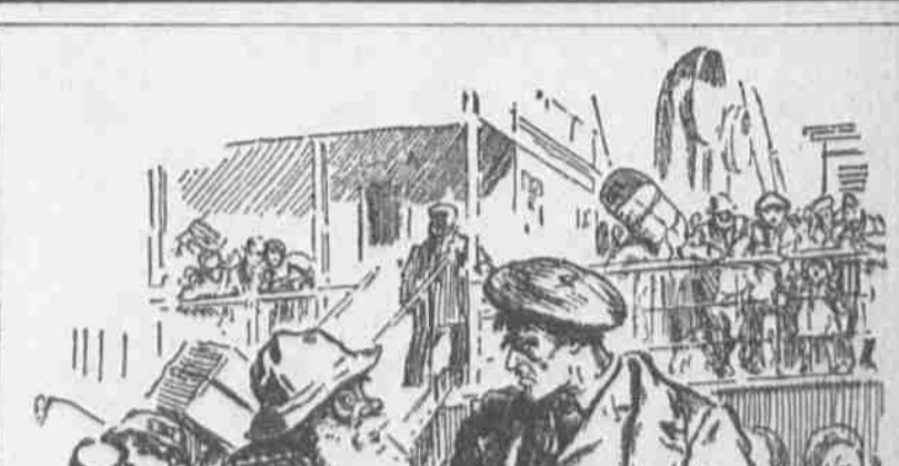
"My wife reminds me of my automobile!"

REAL ESTATE FOR SALE CITY MODERN HOMES OVERLOOKING N. W. BOULEVARD $30,500.