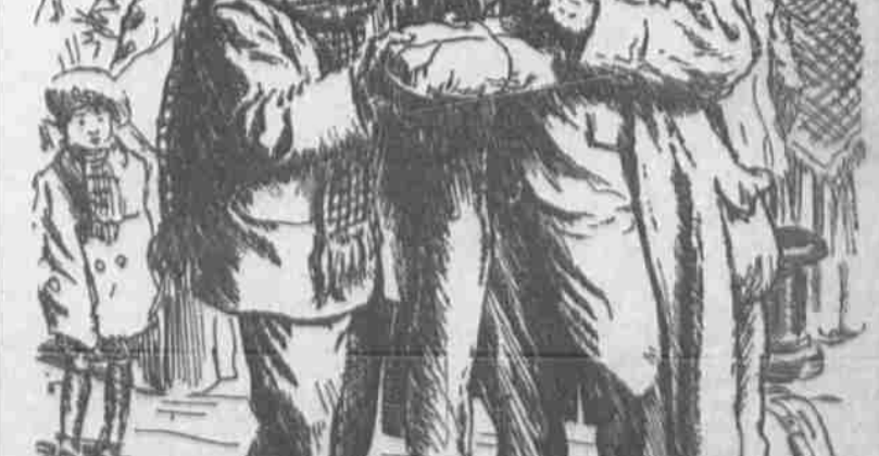
"My wife reminds me of my automobile!"

REAL ESTATE FOR SALE CITY MODERN HOMES OVERLOOKING N. W. BOULEVARD $30,500.