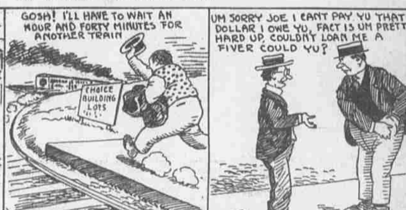
"My wife reminds me of my automobile!"

REAL ESTATE FOR SALE CITY MODERN HOMES OVERLOOKING N. W. BOULEVARD $30,500.