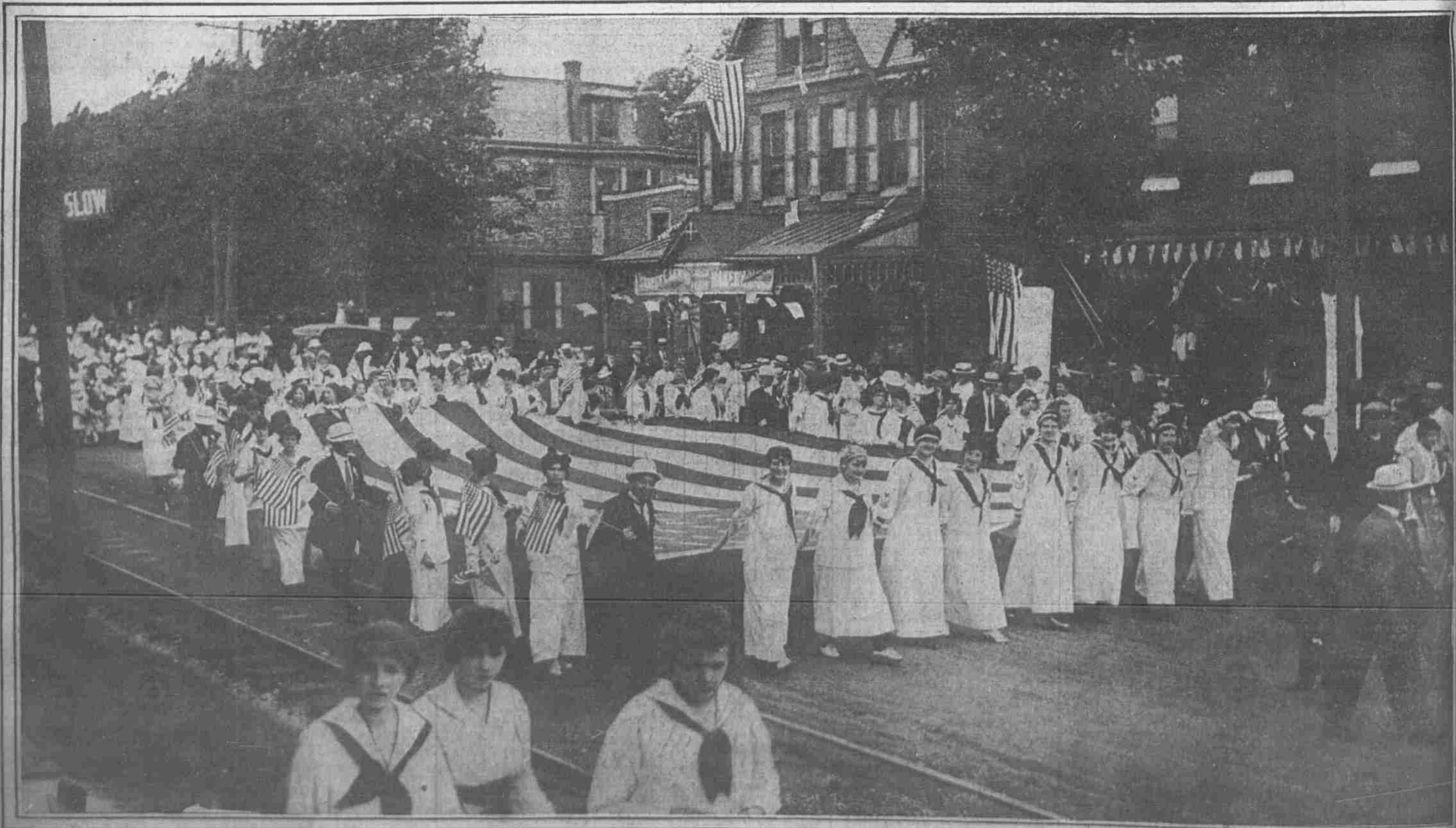
YOUNG WOMEN OF LAWNDALE AND CRESCENTVILLE, IN COSTUMES OF RED, WHITE AND BLUE, CARRY UNITED STATES FLAG IN PROCESSION