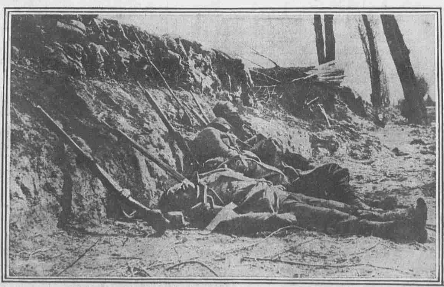
VICTIMS OF GERMAN GAS BOMBS IN FLANDERS TRENCHES Many of the British soldiers who inhaled the asphyxiating gases released by the Germans collapsed and died where they fell. The gas is said to have a dissolving effect on the tissues of the lungs, and puts out of action permanently those whom it does not quickly kill.