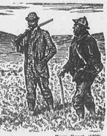
-From Punch (1890). A Lament From the North "And, then, the weather's been so bad, Donald!" "Ou ay, sir. Only three fine days, and two of them snappit up by the Sawbath!"