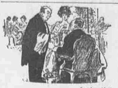
Bridegroom-Walter, I hope you haven't told anybody here we are newly married? Irish Walter-No, sor; Oive kaped it a secret. Why whenever anybody tries to pump me, sor, Oive told them you weren't married at all, at all!