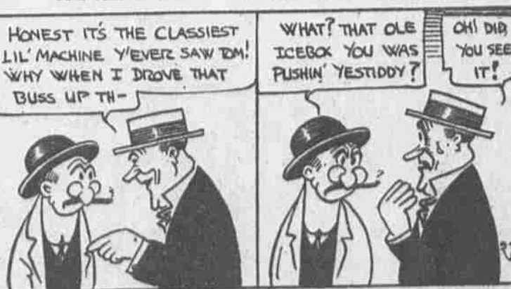
OH! DIR YOU SEE IT!