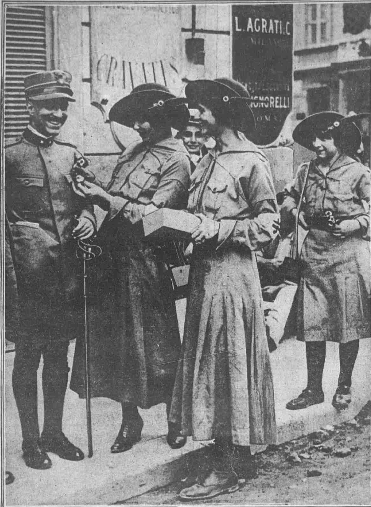
AN EXCHANGE OF SMILES RELIEVES THE GRIMNESS OF WAR Italian girl scouts are shown here holding up a fully accoutred military man in order to obtain his contribution to the Italian Red Cross Fund. Judging by his expression, the soldier does not at all object to the situation. The signorinas apparently like their task, too.

PERSONS AND SCENES THAT FIGURE IN THE VARIED NEWS OF THE DAY FROM FAR AND NEAR