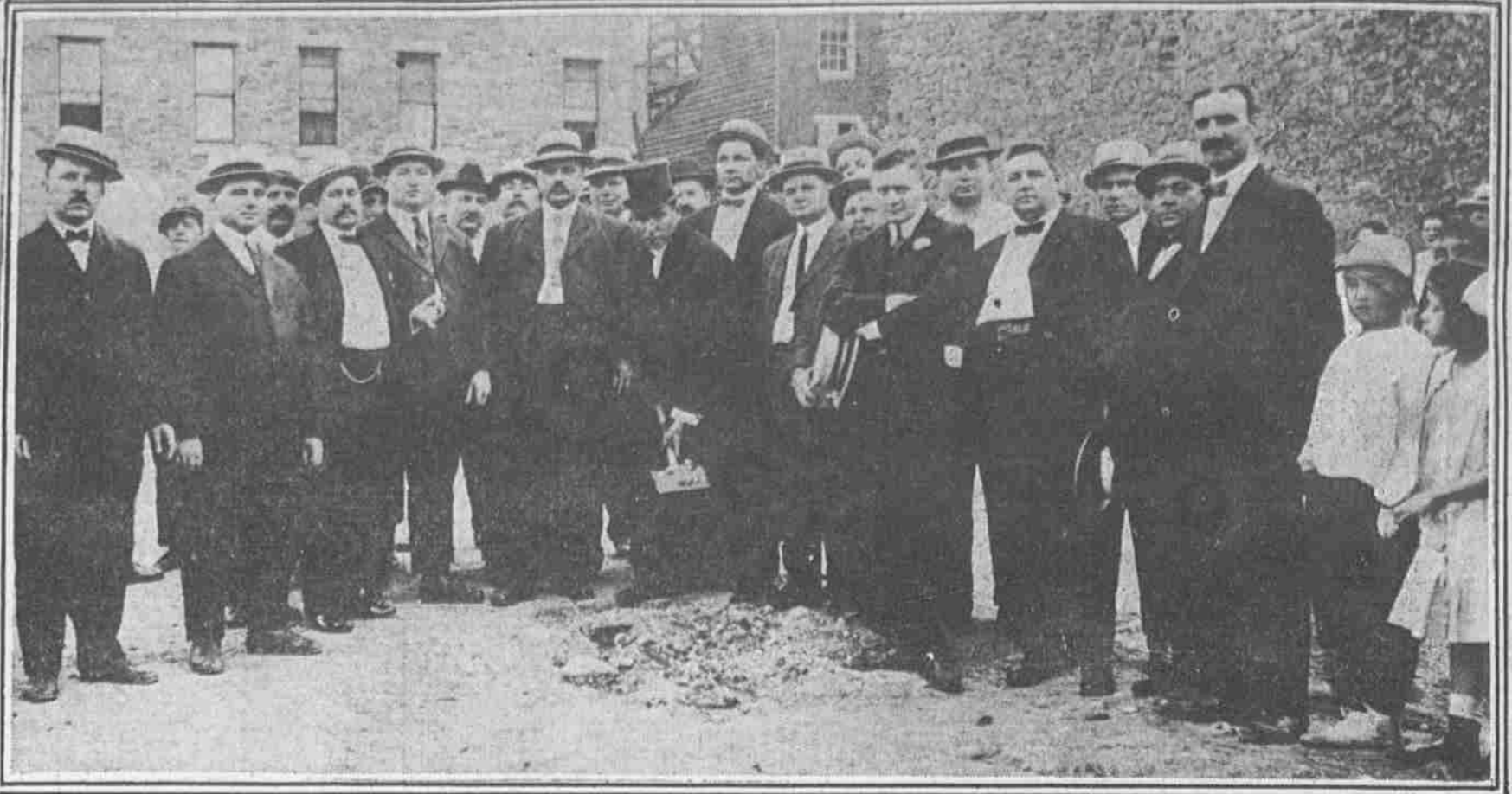
CITY'S LITHUANIANS TO BUILD A NATIONAL HALL Members of the Lithuanian Real Estate Society are shown at the start of the excavation for the foundation of the building on Moyamensing avenue. There are 20,000 Lithuanians in Philadelphia and they intend this hall to be the centre of their life in this city. They have been looking forward to it for many years.