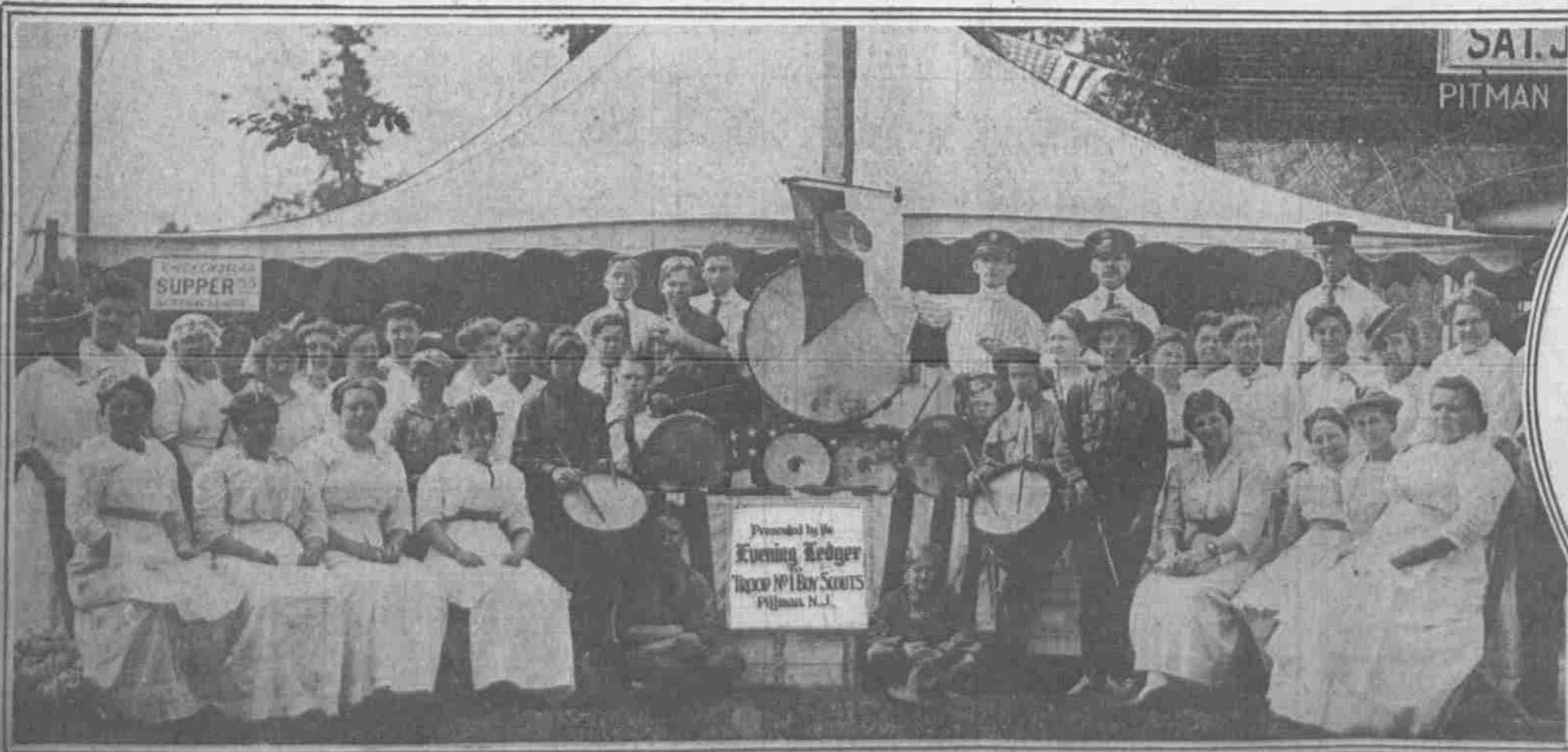
PITMAN GROVE BOY SCOUT FIFE AND DRUM CORPS IN NEW OUTFIT This outfit was presented to the troop by the Evening Ledger, as the sign indicates. Grouped around the scouts are the ladies who gave their assistance in the carnival held by the Jersey town's volunteer firemen.