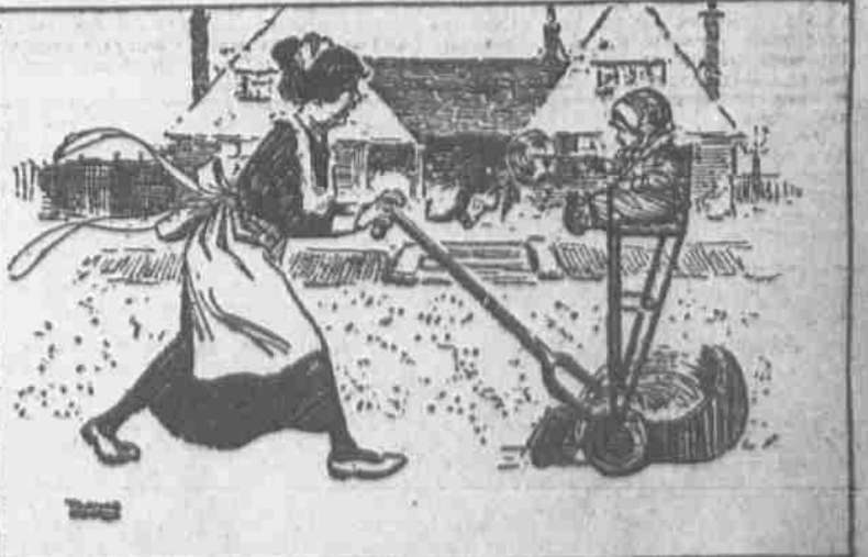
The 'Mill-two-birds-with-one-stone' Baby Carrier can be fixed to any lawn mower.