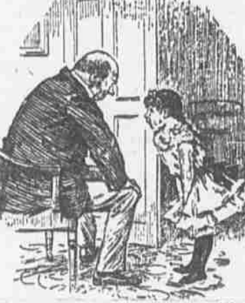
Well Out of It

Uncle—And you love your enemies, Ethel? Ethel (promptly)—Yeth, Uncle. Uncle—And who are your enemies, dear? Ethel (in an awful whisper)—The Day.