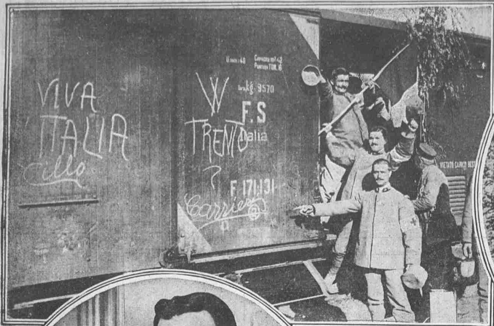
ITALIANS BOARD CARS FOR FRONT The soldiers of King Victor followed the example of the warriors of the other fighting nations in chalking up their carriages with legends signifying patriotism and expectation of early victory.

PICTURES FROM NEAR AND FAR MAKE CLEARER THE VARIED NEWS OF A BUSY WORLD