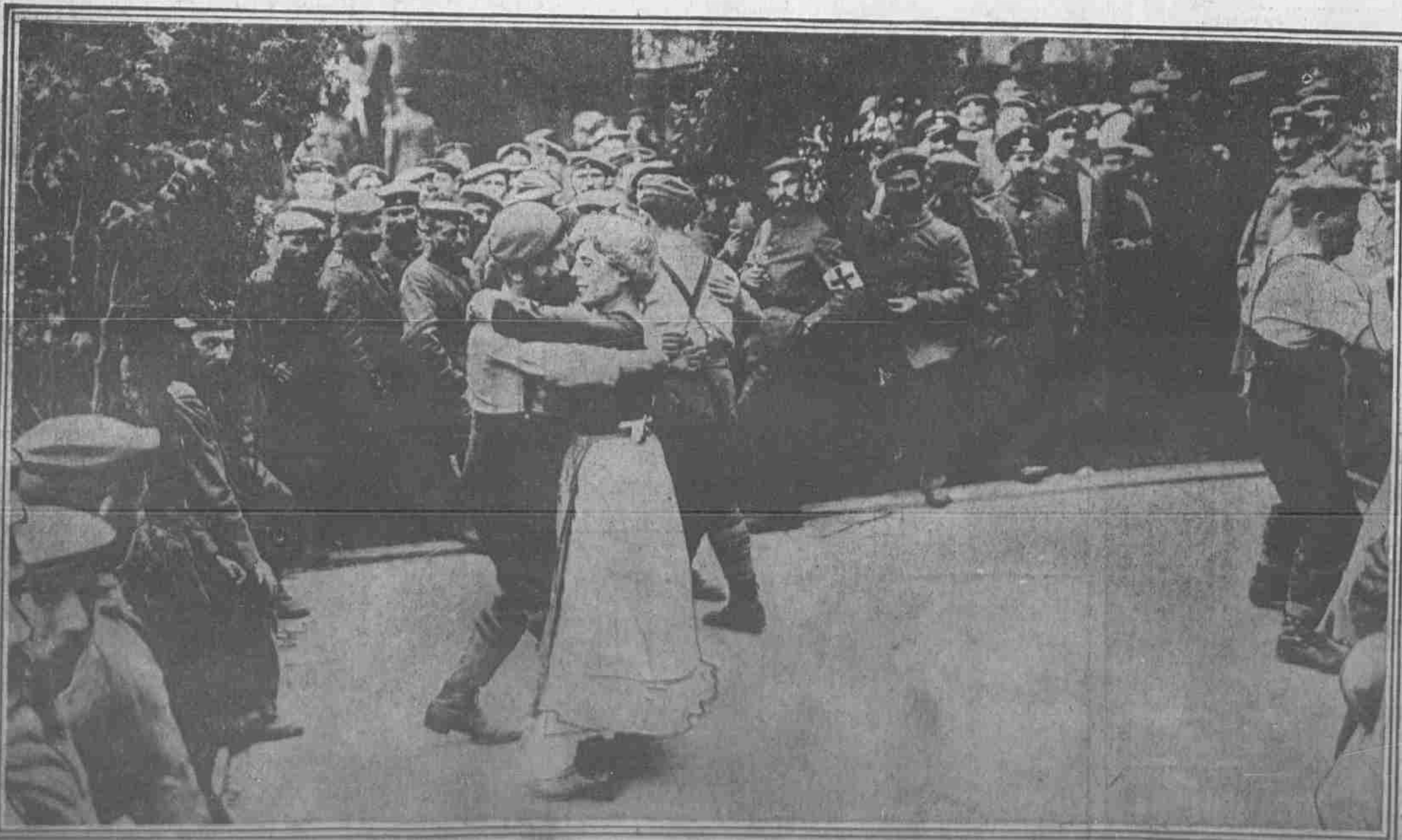
GERMAN SOLDIERS WILLINGLY CHANGE GOOSE STEP TO TURKEY TROT Military discipline is so rigid that it is no doubt a great relief to be able to abandon one's self to the one-step now and then. In this picture a pink-haired soldier is shown acting the part of the "lady," since, of course, real members of the fair sex are scarce in the war zone.