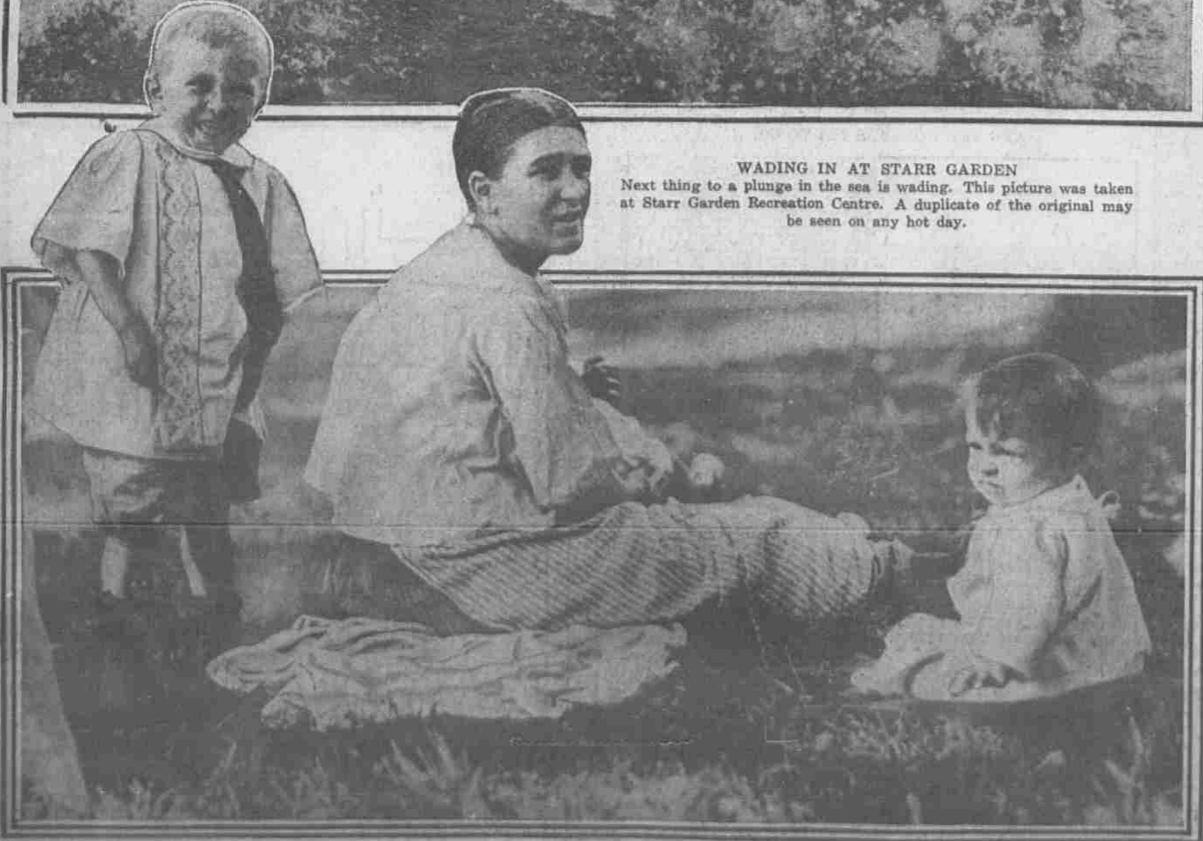
THE COMFORT OF A BIT OF GREEN FIELD Those who cannot reach the shore or some equally cool spot when the city sizzles are put to it to discover other means of forgetting the heat. The subjects of this picture seem successful.