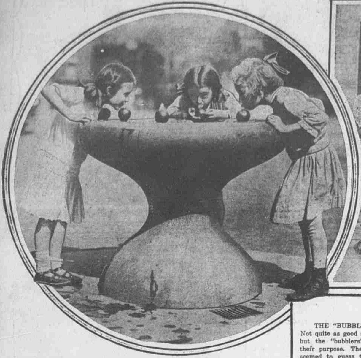
THE "BUBBLERS" Not quite as good as a bath, but the "bubblers" serve their purpose. The drinkers seemed to guess they were being snapped.