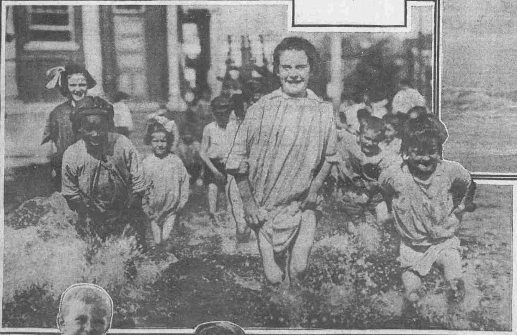
WADING IN AT STARR GARDEN Next thing to a plunge in the sea is wading. This picture was taken at Starr Garden Recreation Centre. A duplicate of the original may be seen on any hot day.