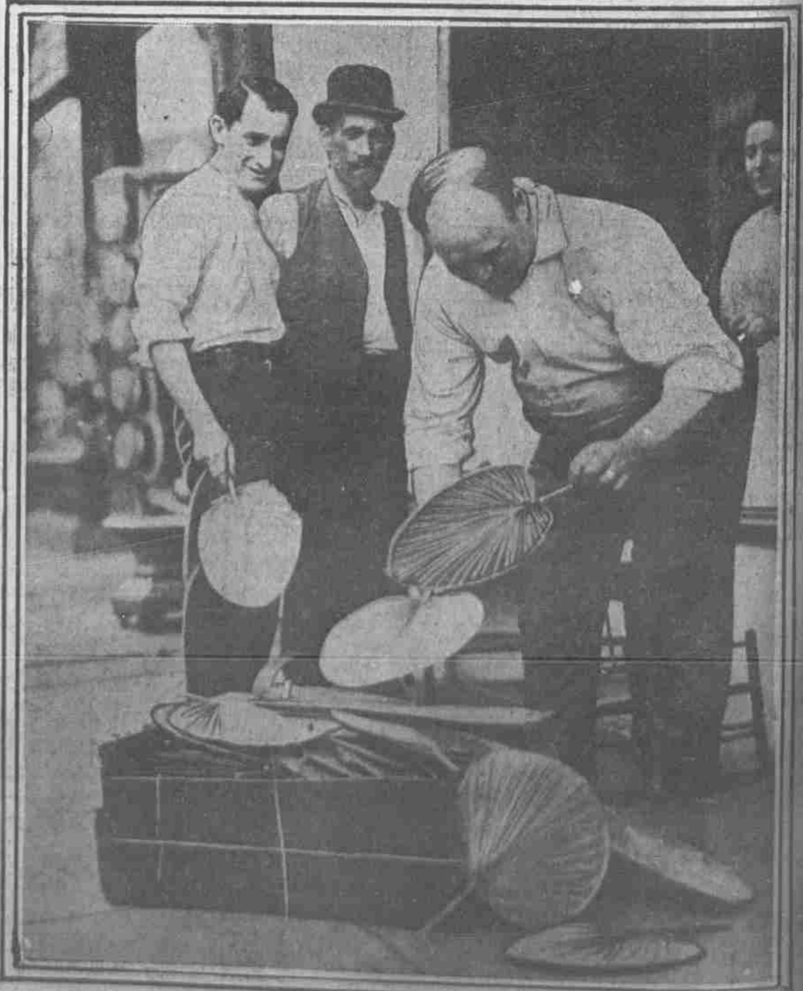
CAPITALIZING THE HEAT WAVE Soft drinks cannot be carried from place to place, so the itinerant salesman must choose what to sell in demand during the summer. Fans seem to be good business.