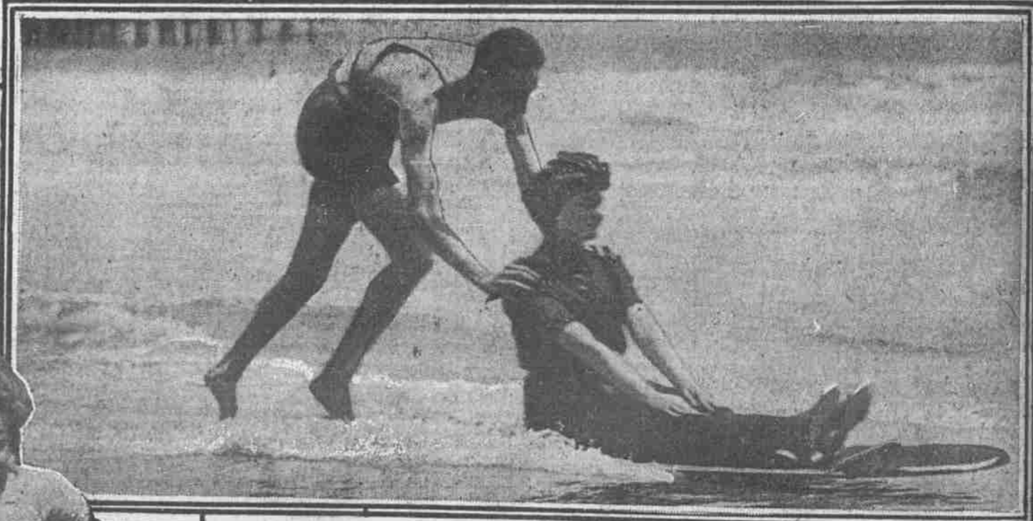
A GALLANT SPORT AT ATLANTIC CITY You may name it for yourself; anything from "pushboard" to "ocean-toboggan" is acceptable. The sport itself is more than acceptable.