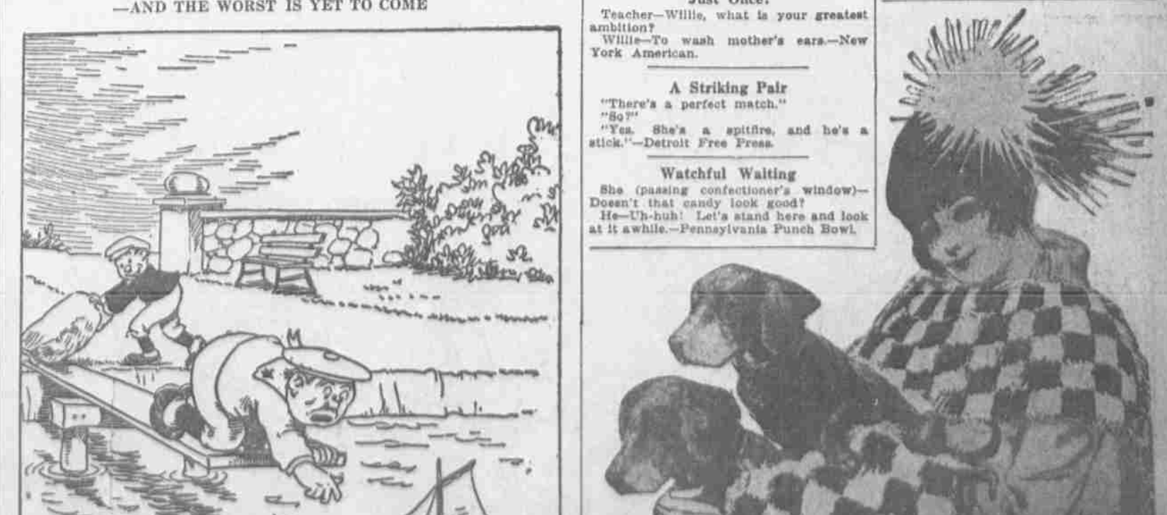
Speeches to Be Lived Down if Possible

Eighty-I had hoped for the pleasure of taking you down to supper, Mrs. Maaham!