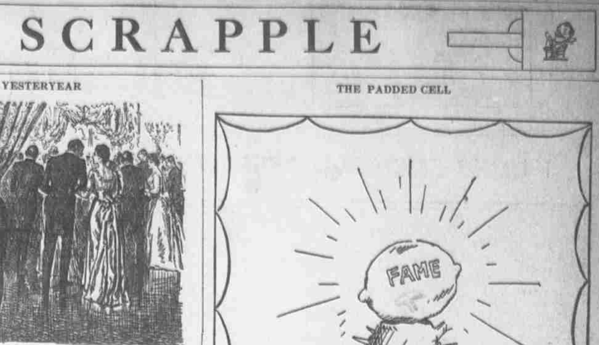
Speeches to Be Lived Down if Possible