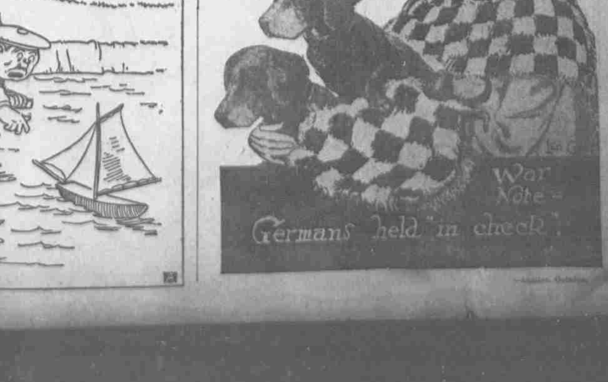
German's held in check

She (passing confectioner's window)-Doesn't that candy look good?