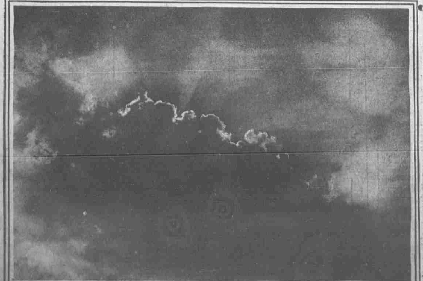
TWO VIEWS OF TIMBER CREEK, THE DELAWARE'S TRIBUTARY, BELOVED OF PIKE FISHERS AND SUMMER CAMPERS The views are before and after the storm of last Sunday. Both show the strange lights which played over Timber Creek. It is said that pike will be biting soon and daharmen will presently be poking the nones of their houts around the lifty pads of the