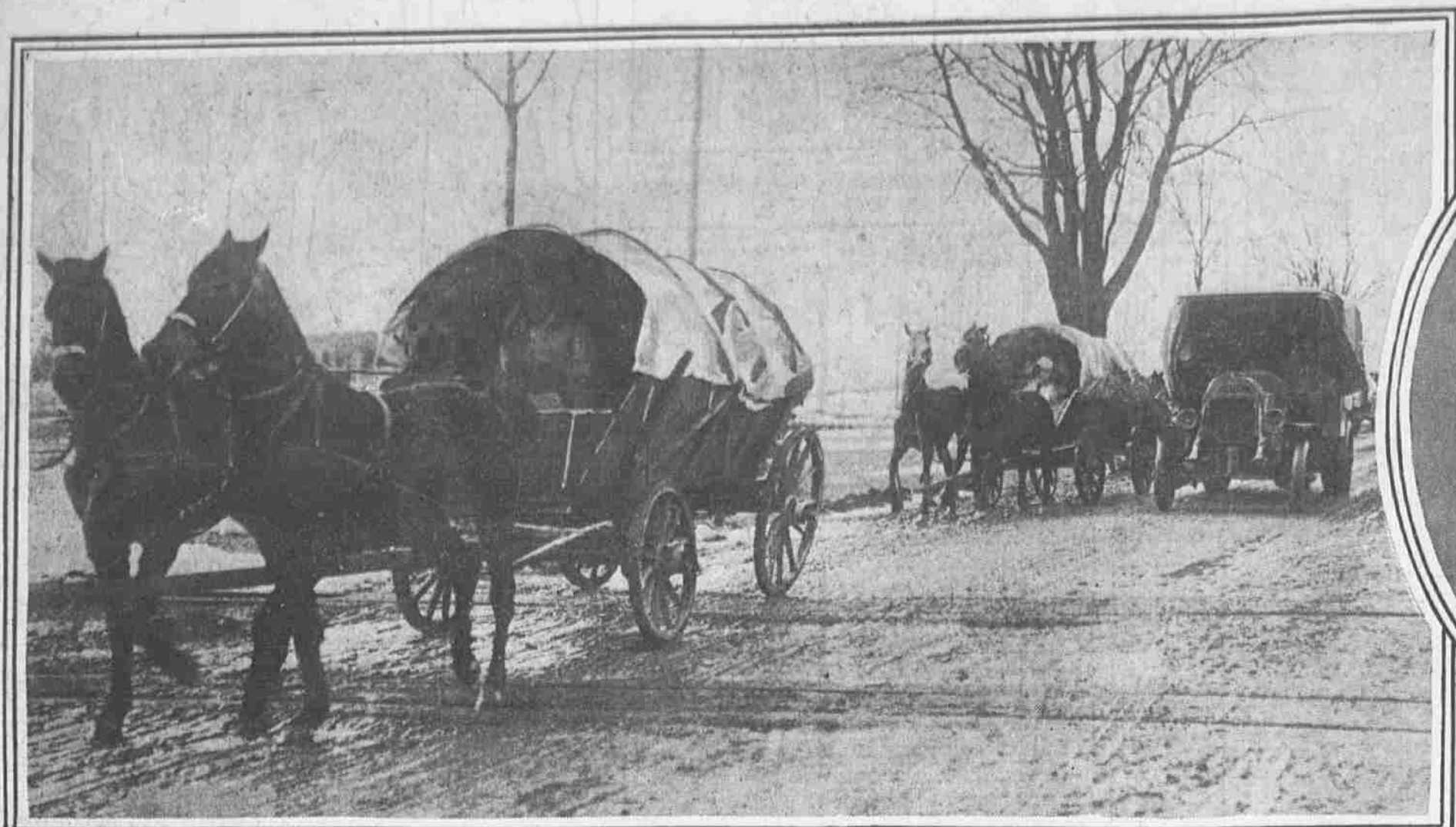
GERMAN AMMUNITION WAGONS APPROACHING THE FIRING LINE IN GALICIA The importance of the ammunition transport in modern warfare cannot be overestimated. In this picture there is a sharp study in methods where the

heavy truck is seen swiftly overhauling the slower-moving schooner-wagons.