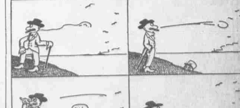
There's Nothing to It 'GOOD MORNING, SIR! CAN YOU-ALL TELL ME WHERE THE NEW AUSTRALAS BOAT?'