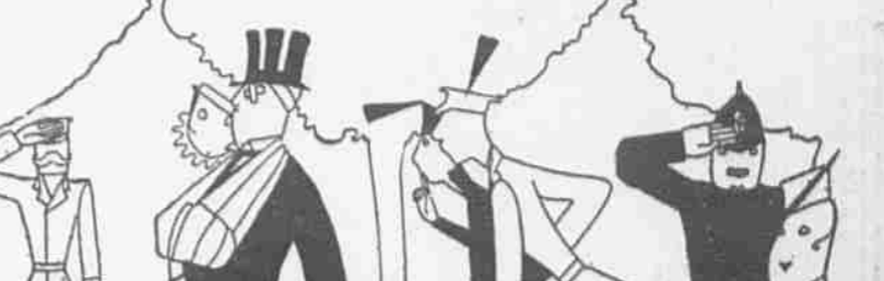
Close Than a Brother 'That French count sticks very tight to your skin, Mac.'