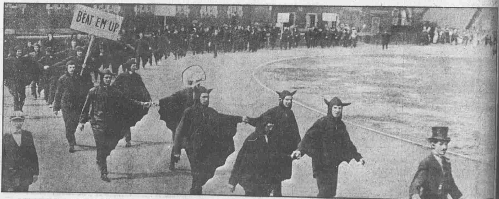
CHARLIE CHAPLIN (NOT HIMSELF) TAKES PART IN ALUMNI DAY AT PENN His appearance, followed by that of a horde of red-clad devils, was the signal for loud and hearty laughter. His antics, arranged by the class of 1912 which followed him, were hugely appreciated.