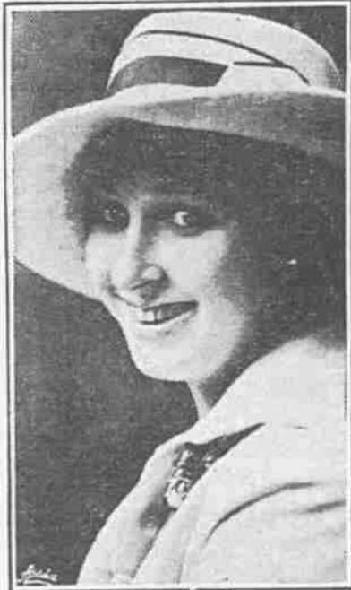
EDITH STOREY One of the Vitagraph stars

Things are not always as pleasant as the photoplaygoer imagines. Take the production of the "Island of Regeneration," which was started on Labor Day. The scenes on the beach were taken on J. Stuart Blackton's estate on Long Island, New York State. The estate is very beautiful, but it is hardly tropical, and in order to gain the proper effect it was necessary to drape the trees with great quantities of Spanish moss, and hundreds of natural palms were employed to lend a southern atmosphere to the background. The weather was pleasant at this time, and it was no great hardship to go about on the beach scant-