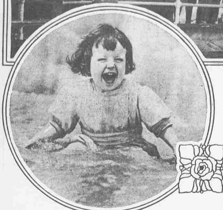
"AS HAPPY AS A CHILD" And who wouldn't be? She is one of a thousand enviable ones.