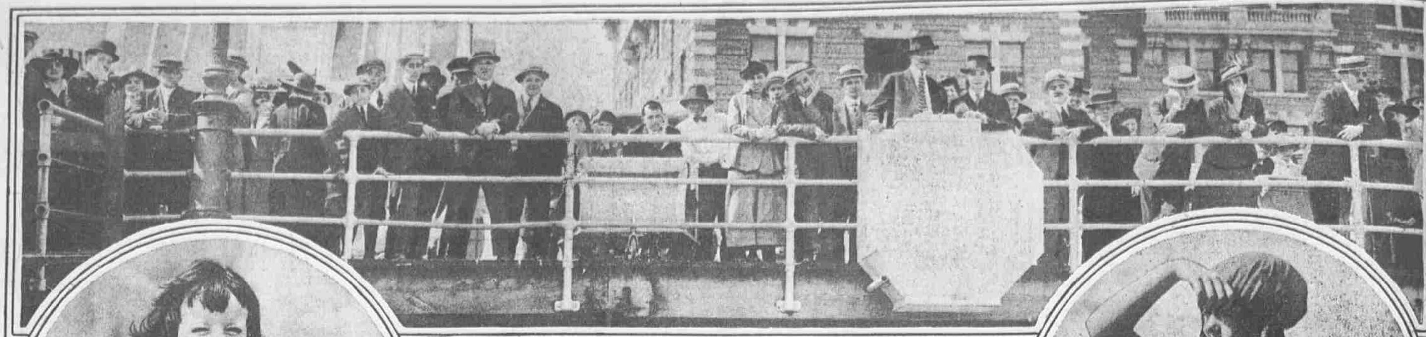
THE "RAILBIRDS" AT ATLANTIC CITY WATCHING AND WISHING June is now in midseason form, otherwise known as "the pink of condition." The crowds at the shore are divided between those who are in again and those who wish they were. Above are the latter.

A BREATH OF SALT SEA AIR AND A GLIMPSE OF SPORTS TO BRIGHTEN THE DAY'S WORK