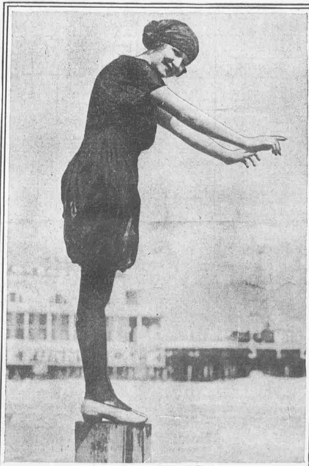
ABOUT TO DESCRIBE A BOW OF BEAUTY IN A PLUNGE When "lovely woman" prepares for a high dive she presents a sight which may not be described—except by the camera, as above.