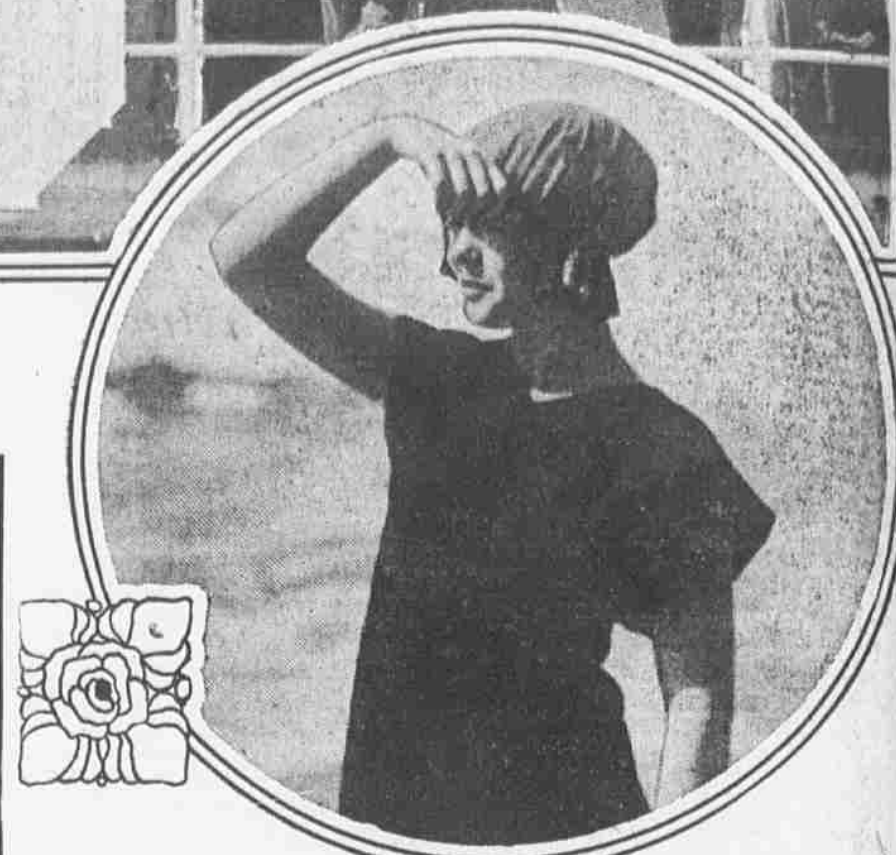
LOOKING OUT TO SEA A pensive moment after the heyday of excitement on the beach.