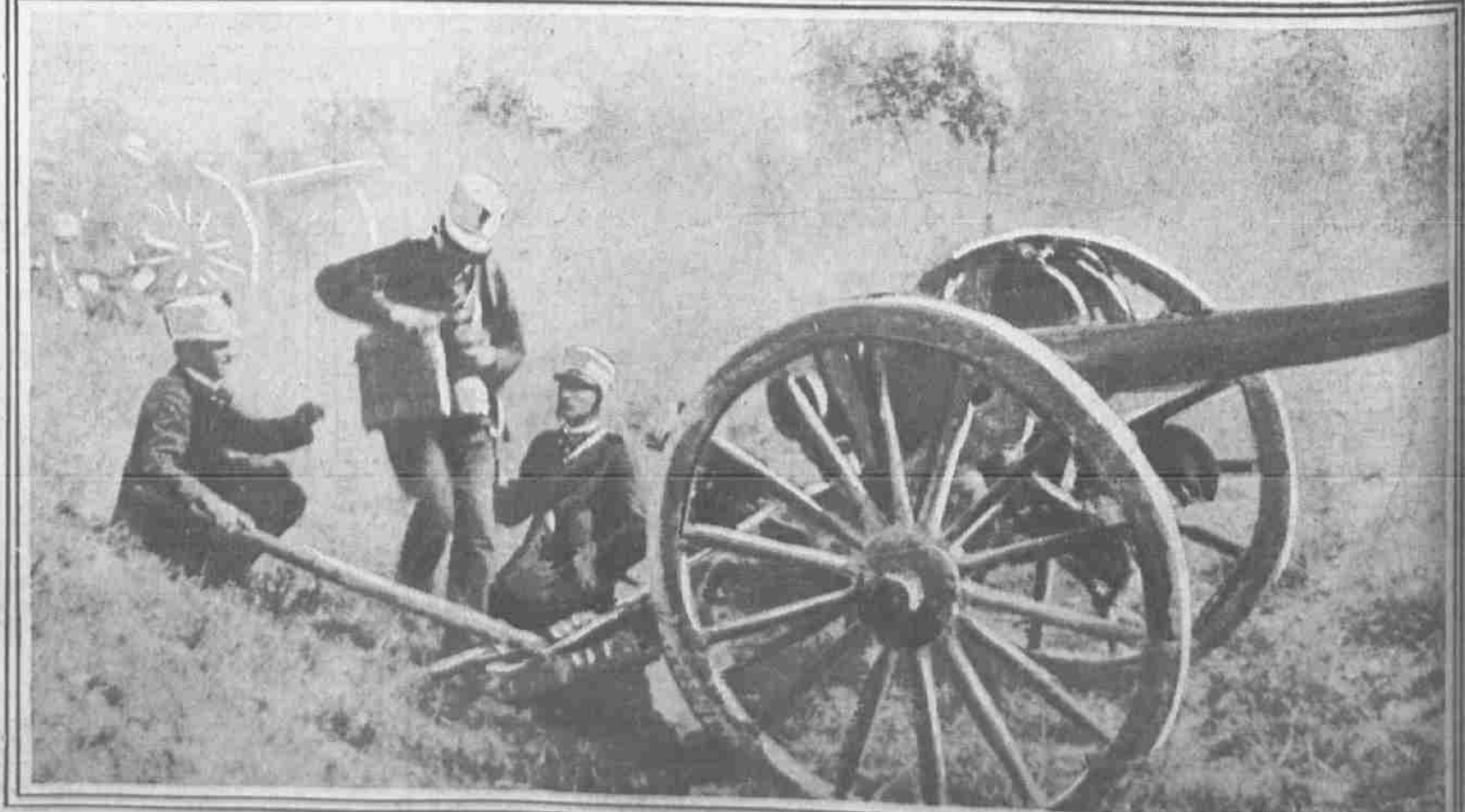
AN FALIAN BATTERY IN ACTION One of the batterizes which are now being trained against the Austrian forces. The march of the Italian army seems to have been virtually unopposed p to this time.