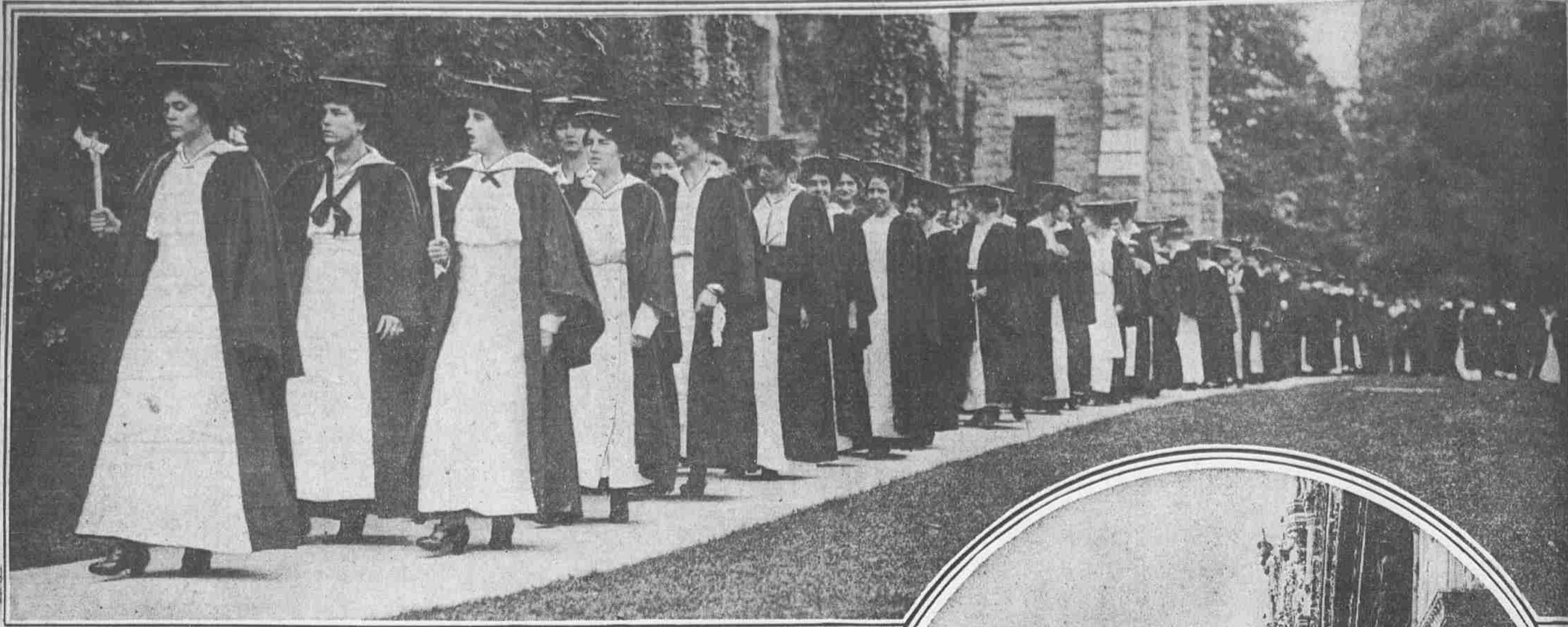
85 BRYN MAWR STUDENTS LEADING PROCESSION TO GYMNASIUM WHERE DIPLOMAS WERE AWARDED This picture was taken when the procession of graduates, students and guests started from the library led by three marshals bearing batons. It was one of the most impressive processions in the history of the Main Line institution. After the marshals came the sophomores, then the juniors and then two more marshals. Then came the resident graduates, two marshals, the alumni, two marshals and the candidates for degrees.

SCENES AND PERSONS IN DAY'S GRIST OF NEWS FROM HOME AND ABROAD AS CAUGHT BY THE CAMERA