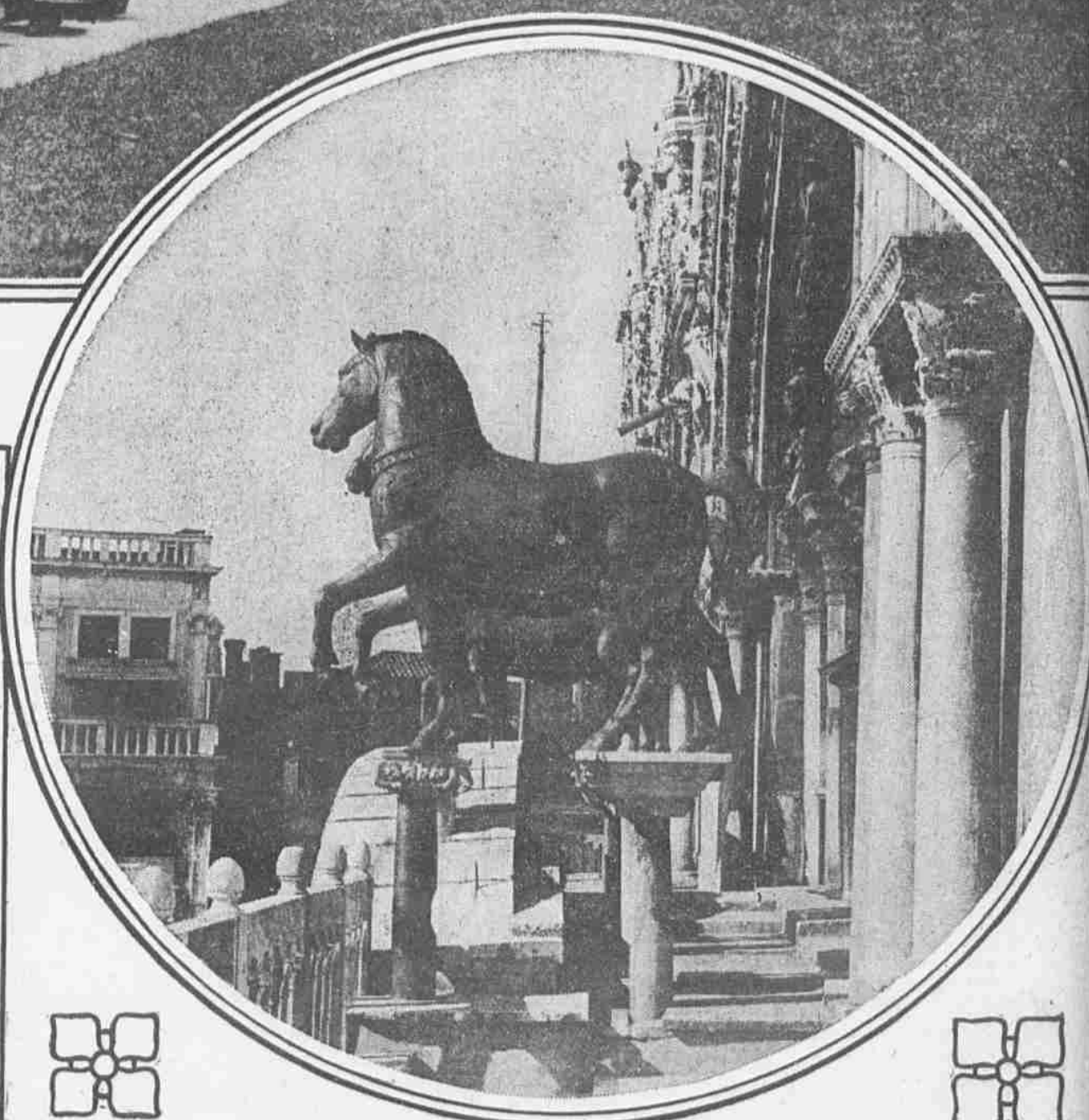
THE GILDED HORSES OF VENICE DISAPPEAR IN FACE OF WAR The famous horses which have adorned for a century the principal portal of the Cathedral of St. Mark's at Venice have been removed to a place of safety because of the fear they might be damaged by hostile aviators. They probably once adorned the Triumphal Arch of Nero and afterward that of Trajan. In 1797 they were carried to Paris by Napoleon, but in 1815 they were restored.