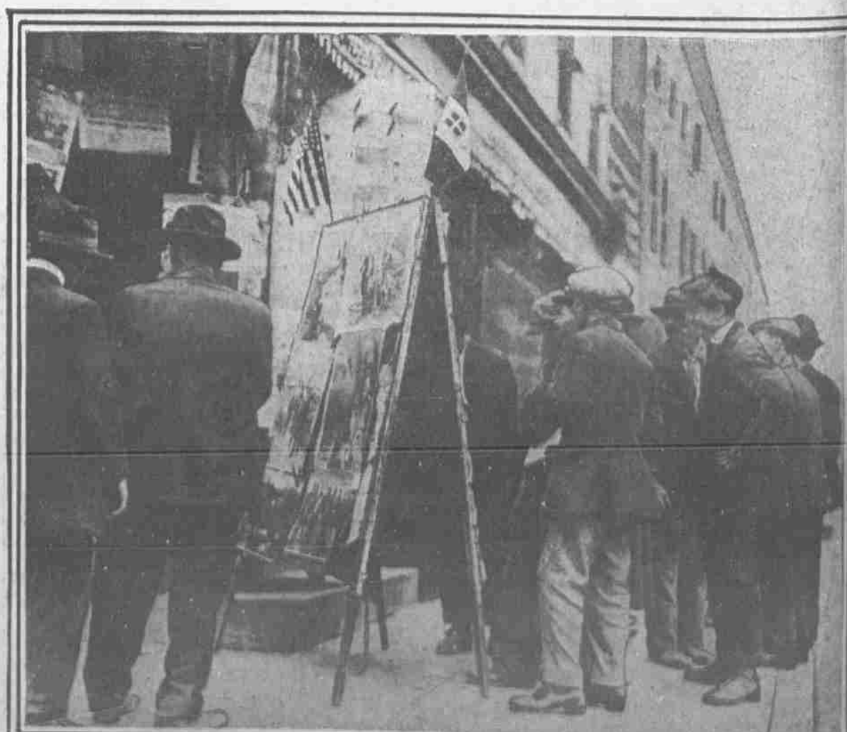
LITTLE ITALY DISCUSSES THE WAR, WHICH HAS NOW BECOME A PERSONAL MATTER On the bulletin board are seen pictures of soldiers, cartoons and symbolic representations of Italy in arms. The flag, too, is prominently displayed. At such rendezvous gather the old Garibaldians now in this country and the young manhood which may soon leave to take its part in the fighting.