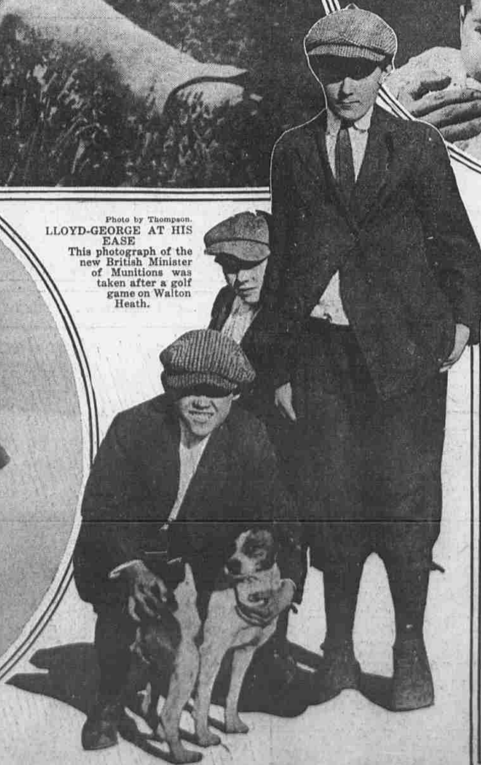
CITY'S CHAMPION RAT CATCHER "Billie," the dog, is attached to Engine Co. 48. When not on duty he takes pleasure in joining his two boy friends on a hunt among the warehouses on the water front. He sometimes earns 50 cents a day for them, they declare.