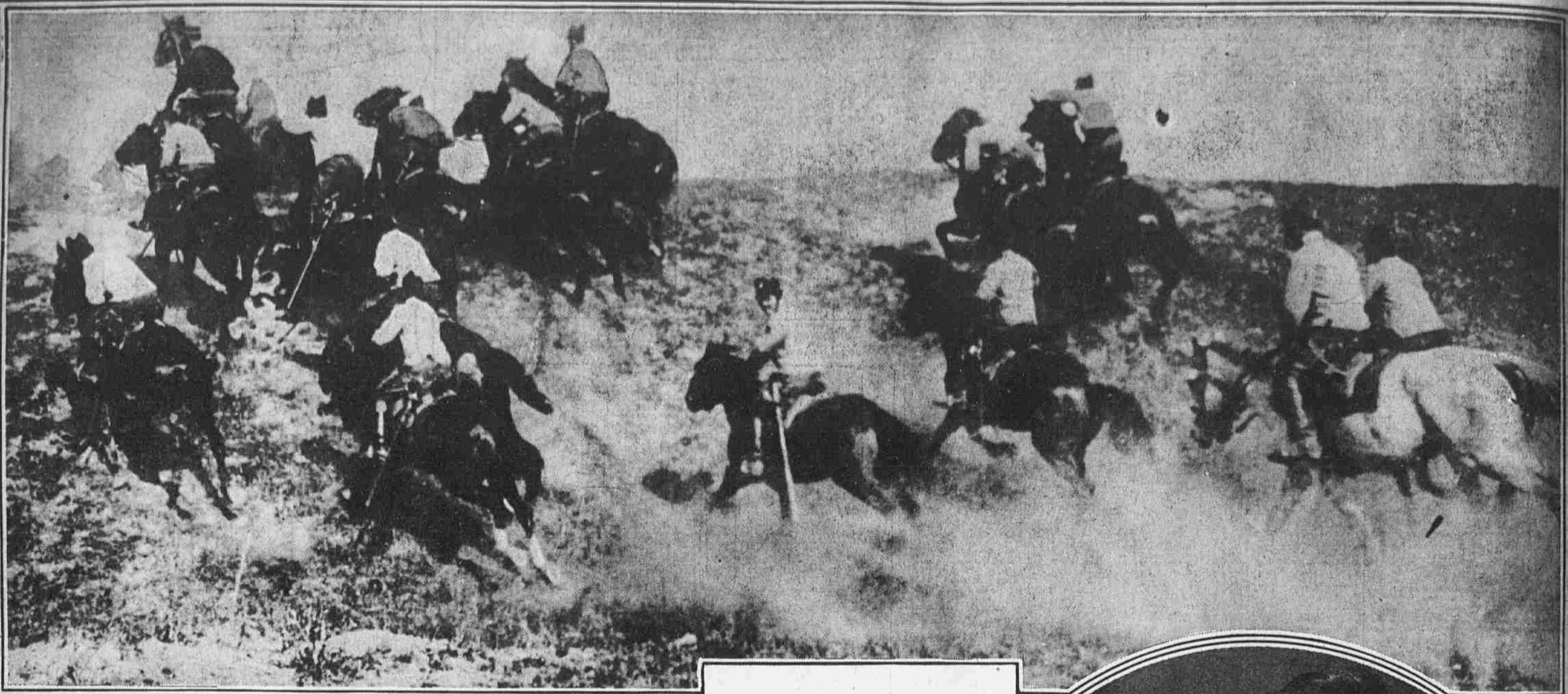
ITALIAN CAVALRY CHARGING UP A HILL A scene that doubtless will be repeated many times in the coming battles among the Alps.

THE CAMERA MAKES CLEARER THE NEWS OF THE DAY FROM A WORLD'S VARIED SOURCES