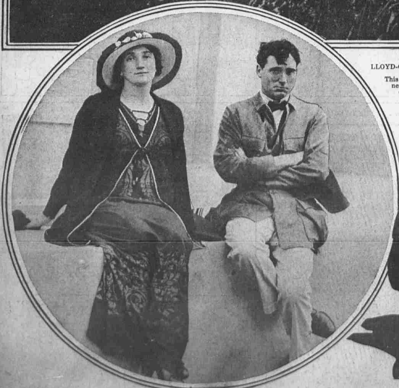
TO BE SEEN HERE IN OUTDOOR DRAMA Granville Barker is the much-talked-of young English stage manager who produces "Iphigenia in Tauris." His wife, Lillah McCarthy, plays the leading feminine role, and will be seen here at the amphitheatre being built in the Botanical Gardens. Mr. Barker had just come from rehearsal. This explains his rumpled hair.