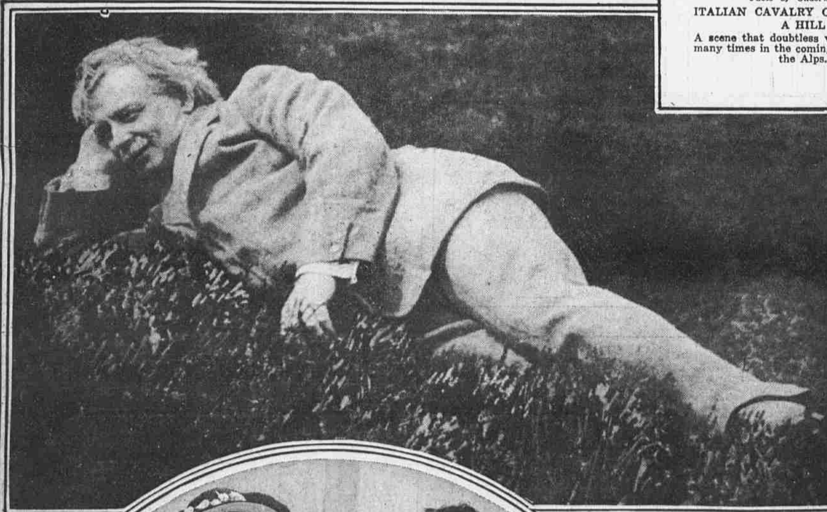
LLOYD-GEORGE AT HIS EASE This photograph of the new British Minister of Munitions was taken after a golf game on Walton Heath.