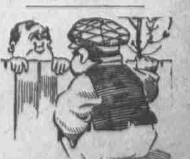
"Hang it, Jones, I've just been stung by one of your confounded becal I demand reparation!" "Certainly, Blison. You just abow me which bee it was and l'it punish the horrid thing severely?"