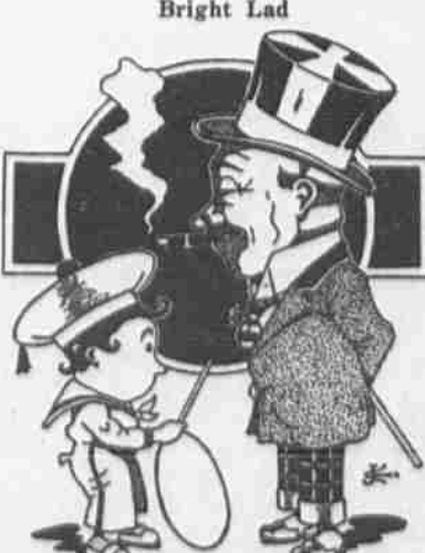
'How old are you my little man?' 'And when were 'On my last birthday!