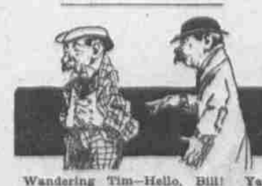
Wandering Tim-Hello, Bill! Yer lookin' mighty seedy. Been sick? Weary William—No, it's work wot's doin' it—work from seven in the mornin' till seven at night, and no time off. Think of it, mate! Wandering Tim—And how long have you bin thore? Weary William—I alm't been there yet. Besip temporow. Begin tomorrow.