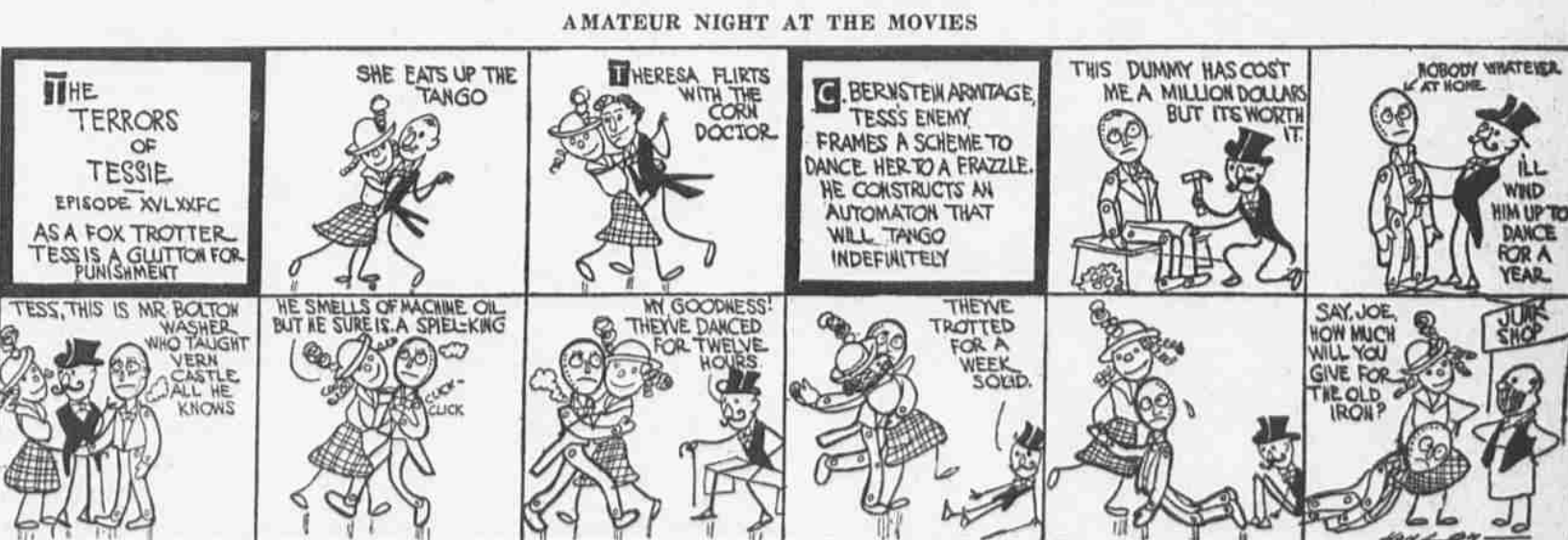
-AND THE WORST IS YET TO COME

Patient-Sure, I can thot, sir. Faith, she gets plainer and plainer ivery day.