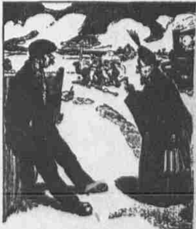
-The Passing Show. Dear! dear! can you tell me what's going on up there, my man?" "Ho, nuffink, mum, only the bloke wot works the roller wants us coves to call 'im a chauffeur.