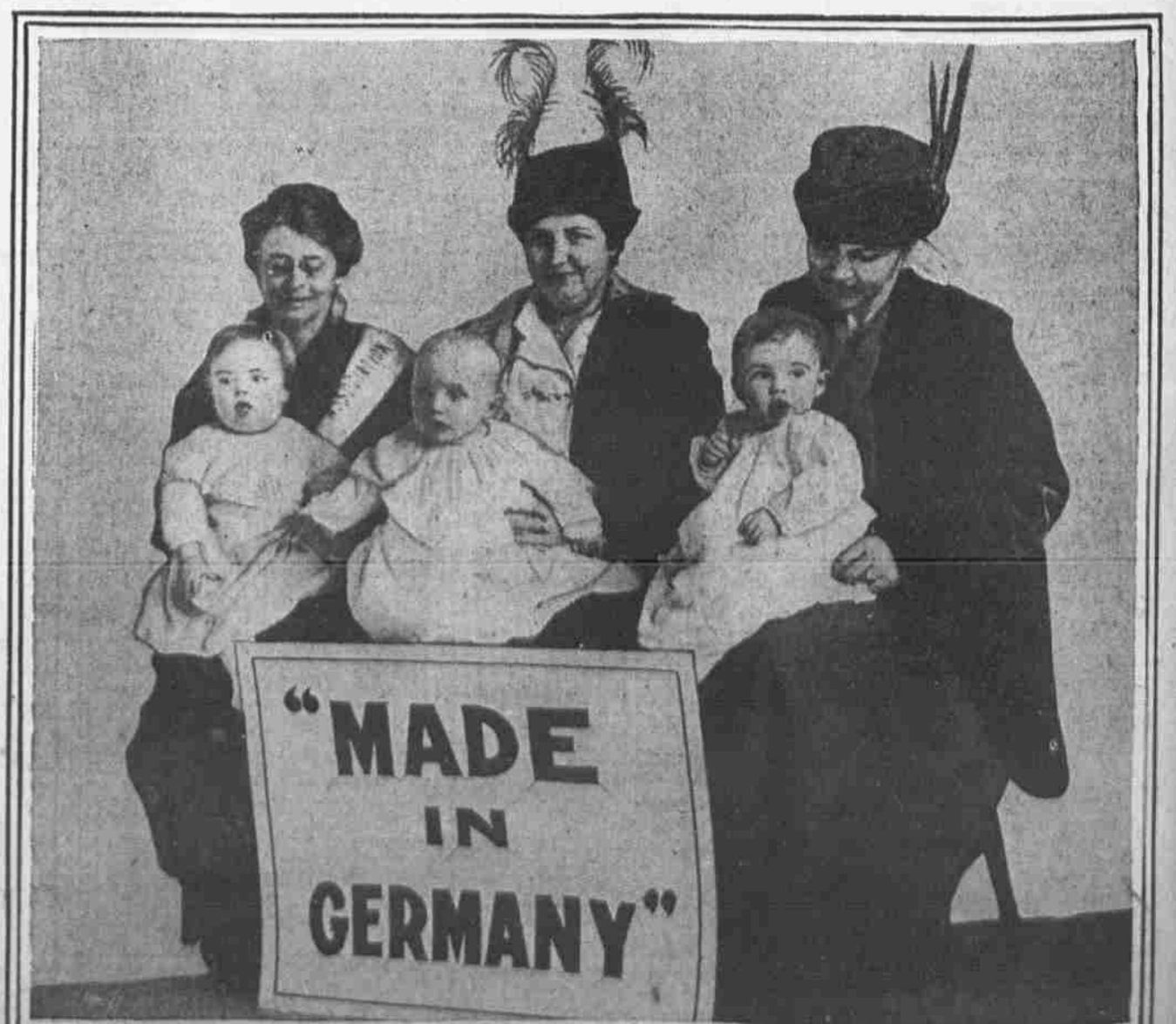
A FRIENDLY RIVALRY IN BABIES—WITH NO WARLIKE SUGGESTIONS

At the recent "Twilight sleep" exhibit in New York the babies born in the "Daemmer schlaf" were shown with the national "tags" as shown above. Daemmer schlaf, in its most recent form, got its greatest publicity in Freiburg, in Germany.