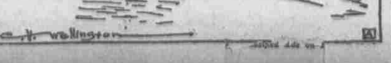
Something Had To A Mortgage 'I believe our climate is changing.'