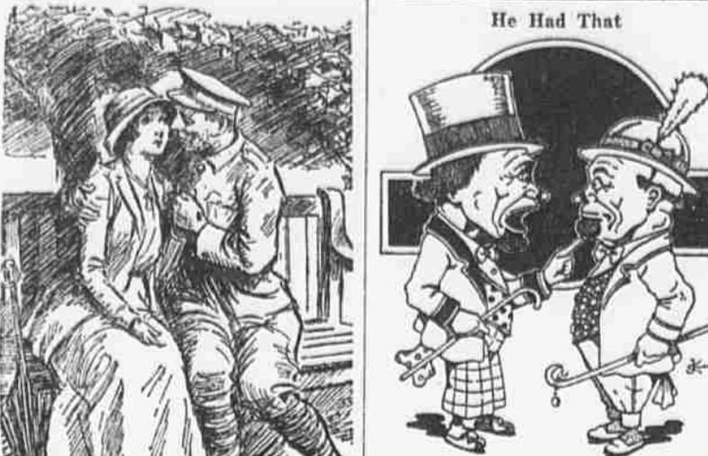
He Had That -London Opinion. 'You Miss Me Love You' Let's give 'em the 'Ym ov Hate.'