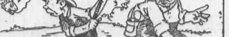
Something Had To A Mortgage 'I believe our climate is changing.'