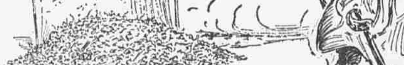
Footlight Flash Hazel-What is that scraping noise out front? Dawn-Must be the chorus girls filling off the stage.-Williams Purple Cow.