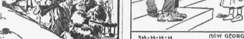
AND THE WORST IS YET TO COME FOR RENT-Modern, comfortable cottage; porch on 3 sides, 8th ave, Seaside Park.