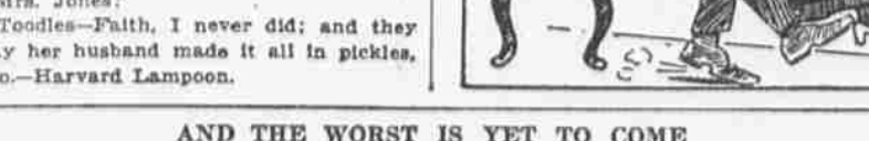
Something Had To A Mortgage 'I believe our climate is changing.'