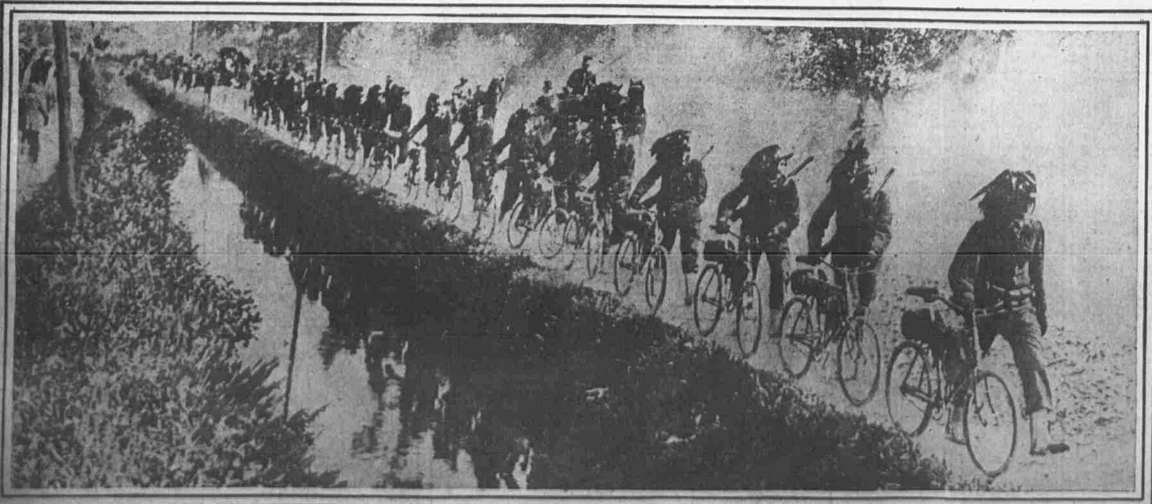
CYCLE CORPS CARRYING OUT MANEUVERS IN PREPARATION FOR AUSTRIAN CAMPAIGN Italy's total forces, including all branches, number about 2,065,000 men. Most of them have been mobilized and are ready to take the field.