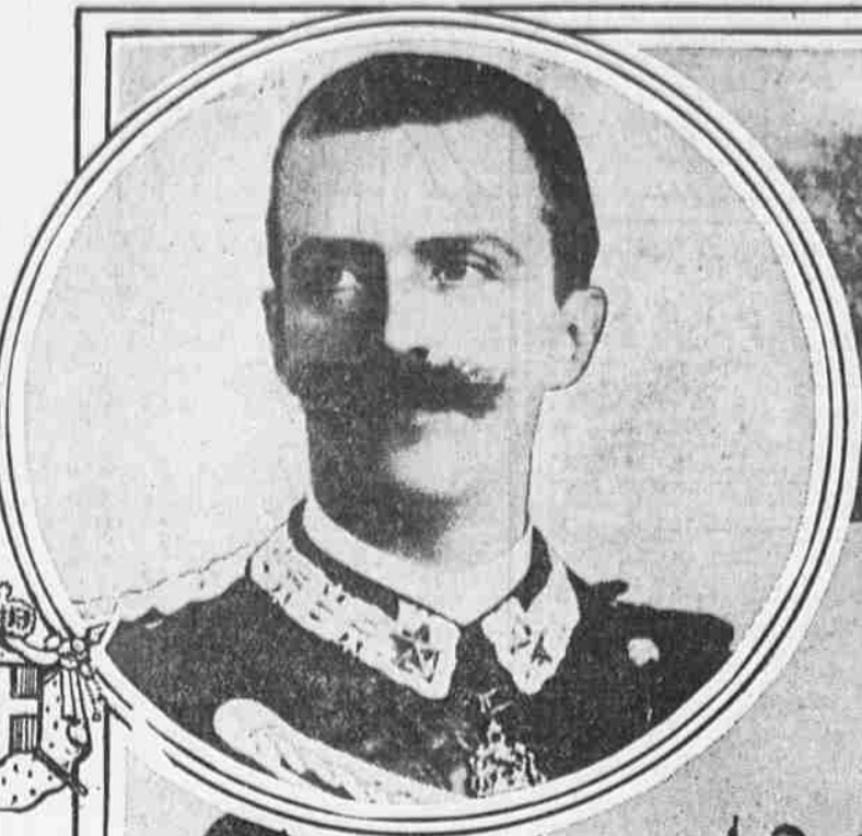
ITALY'S KING AND QUEEN Sovereigns of the latest European nation to send its young manhood out to join in the European war.