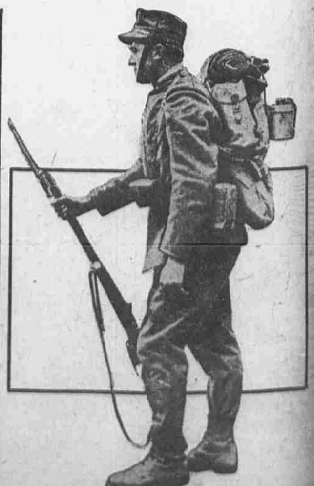
TYPICAL ITALIAN INFANTRYMAN Equipped with rifle and knapsack, ready to take the field.