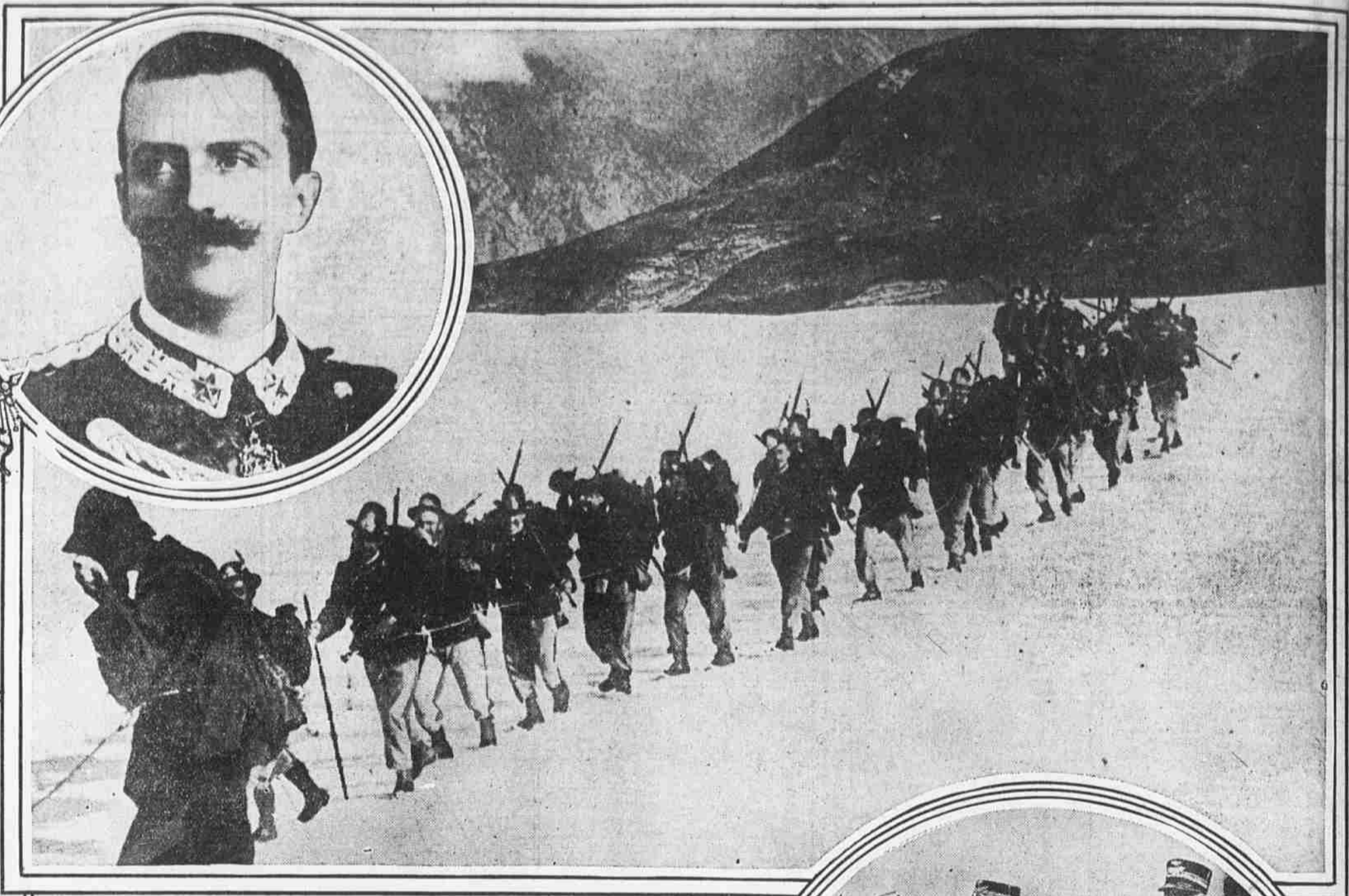
COLUMN OF ALPINE TROOPS ON MARCH Italy has eight regiments of these mountain chasseurs. On them the brunt of the early border fighting against Austria doubtless will fall.