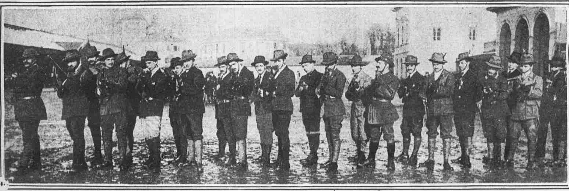
VOLUNTEERS PREPARING FOR WAR AGAINST AUSTRIA The motley dress and improvised accoutrements of these Italian volunteers indicate to a degree how widespread is the war fever in Italy. Rifle practice is held in unfrequented streets and courtyards.