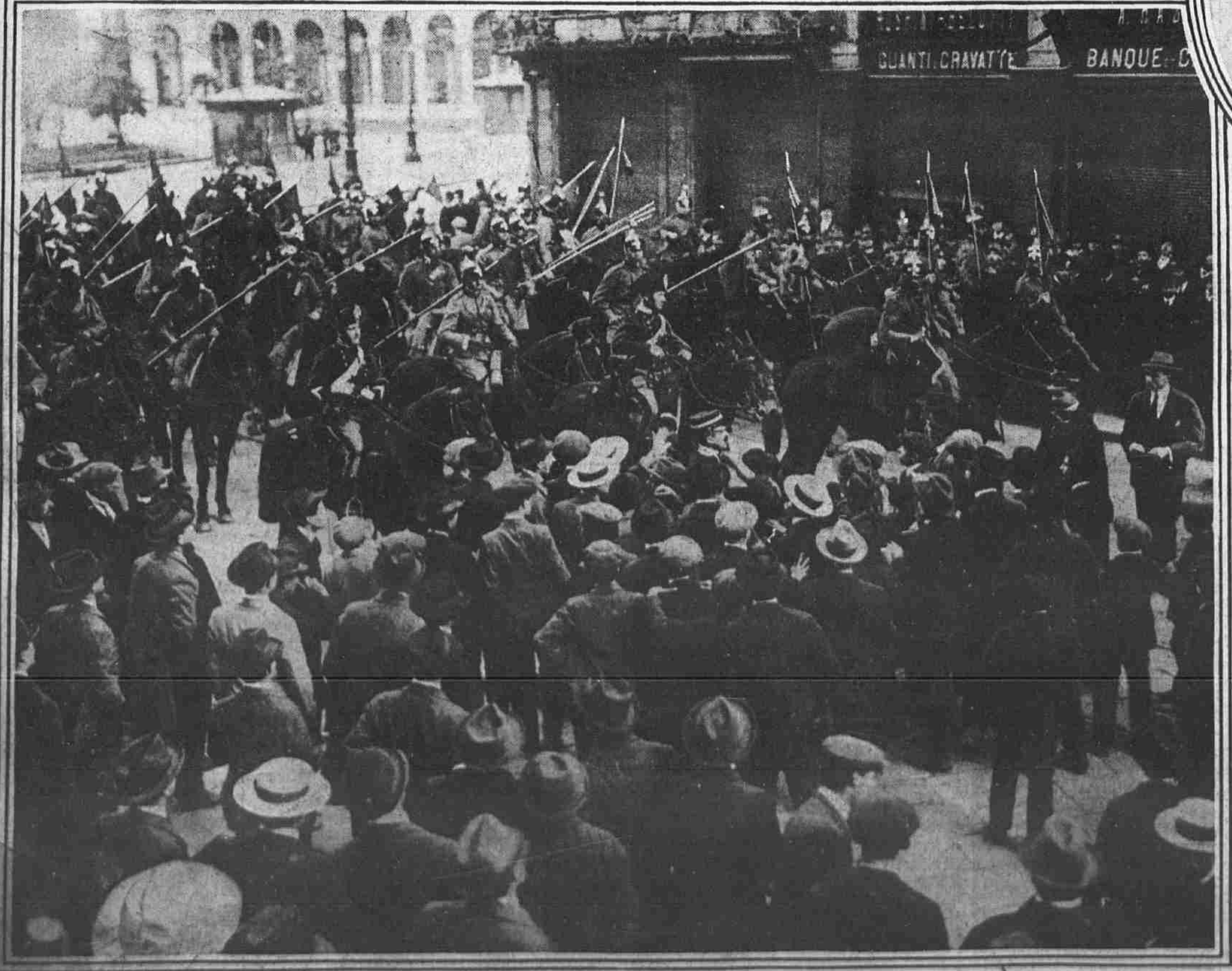
DEMANDING THE RIGHT TO BE SHOT IN ITALY