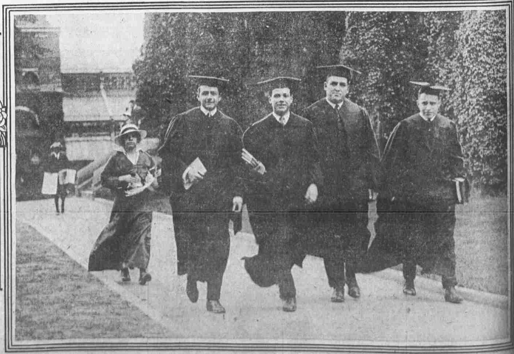
PENN STUDENTS DON INSIGNIA OF APPROACHING GRADUATION Seniors of the University of Pennsylvania have appeared in cap and gown, according to the old custom, which dictates these garments as a sign of their approaching graduation two weeks hence. The campus is now dotted with these figures in solemn, scholastic garb.