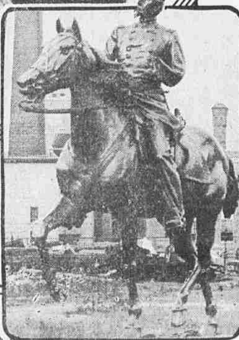
GENERAL PHILIP KEARNY This statue has been erected in Arlington Cemetery, near Washington, by survivors of his famous brigade, most of whom live in New Jersey.