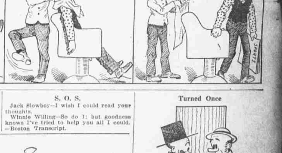
Jones—That coat looks shabby. Why don't you have it turned? Smith—Do you think this coat has three sides?