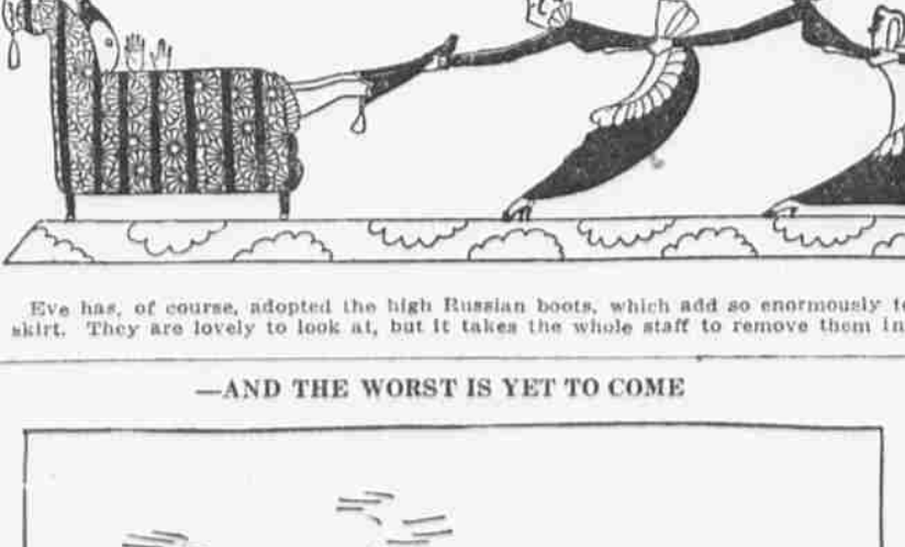
—The Tattler. Eve has, of course, adopted the high Russian boots, which add so enormously to the chic effect of the high and wide skirt. They are lovely to look at, but it takes the whole staff to remove them in the evening.