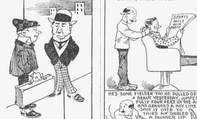
Jenkins—So you and Miss Watson are now one? Roberts—That's what I thought when the minister married us, but I have since concluded that we are ten.