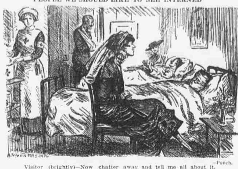
Visitor (brightly)—Now chatter away and tell me all about it.