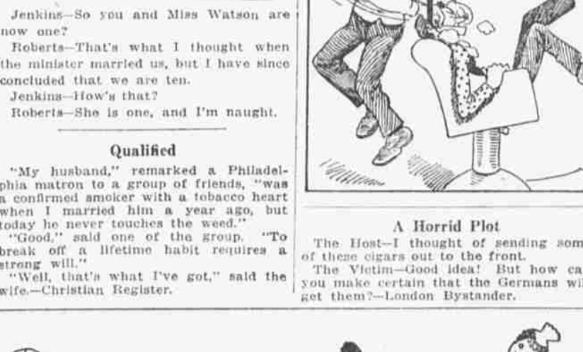
The Host—I thought of sending some of these cigars out to the front. The Victim—Good idea! But how can you make certain that the Germans will get them?—London Bystander.