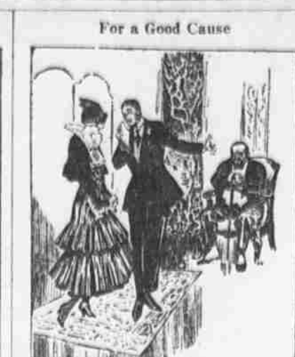
—The Passing Show. Timid Youth—At this p-p-point I have to—er—kiss you. I hope you and your husband won't mind awfully? Mrs. Newlywed—Oh, no! It's for the poor Belgians, you know!