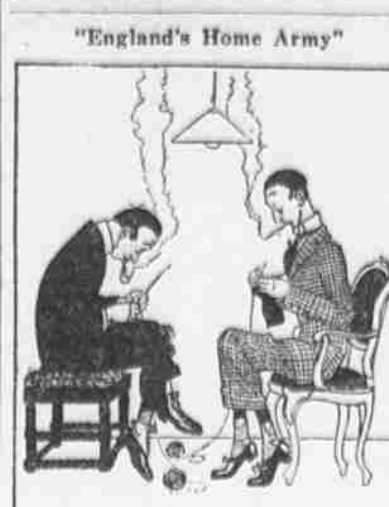
This cartoon, from the German paper, Der Brummer, represents two young English "nuts" boasting of their noble work for the Motherland by knitting socks!