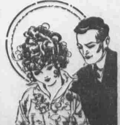
He-Darling, I love you and I always seal my love with a kiss. She-Yes, but be careful, for I always