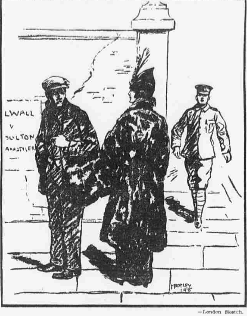
The Habitual Loafer-W'y ain't I enlisted? Wot am I waitin' for? I'm

THATS OUR DOOR BELL NOW WHO THE SAM HILL WARTS