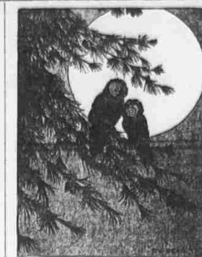
-Harvard Lampson First Owl-I don't fancy this moonlight. Second Murderer-No, I don't give a