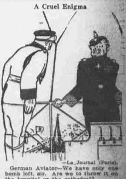
the hospital or the cathedral?