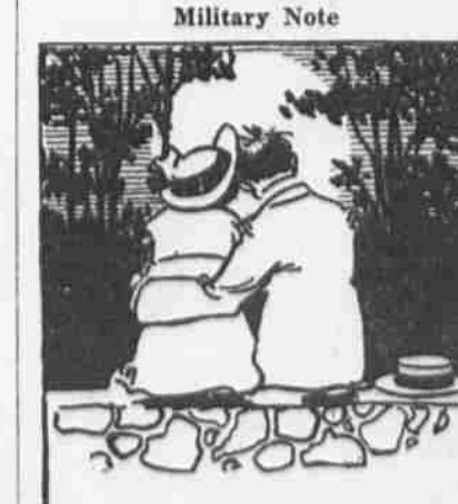
"Our left is firmly entrenched." Sealing Love