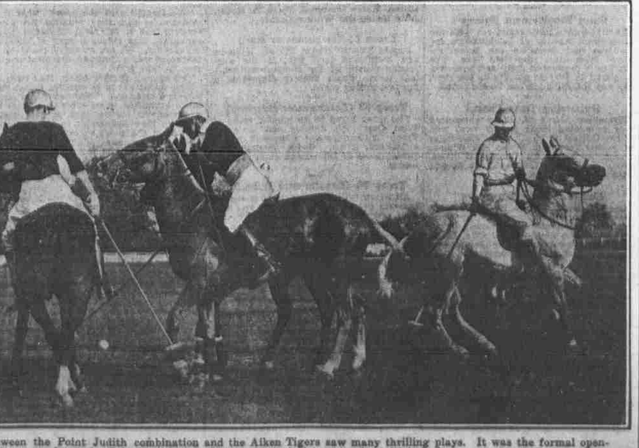
Speetators at yesterday's game between the Point Judith combination and the Aiken Tigers saw many thrilling plays. It was the formal opening of the polo season here, the Point Judith team being returned victors in the initial clash.