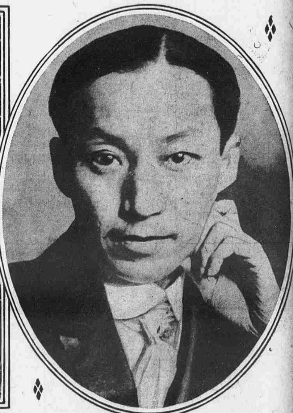
HERE TO RAISE FUNDS FOR TROUBLED CHINA

The guns and ammunition carts shown in the picture are on exhibit in a Polish village, apparently with the intention of showing the inhabitants that the Germans, who captured them, are not yet through on the eastern frontier. —The Germans take great pride in exhibiting these great parks of captured artillery.