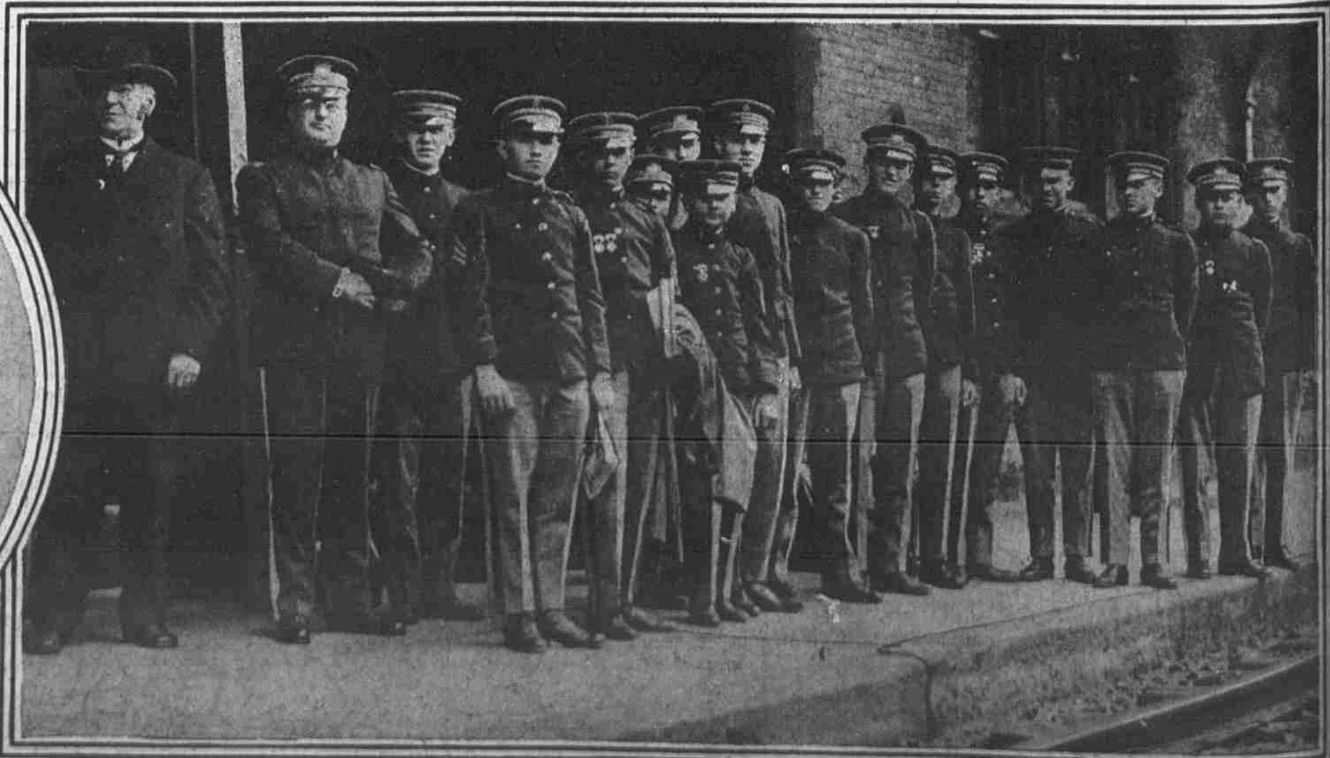
YOUNG CADETS ON THEIR WAY TO THE NATION'S CAPITAL