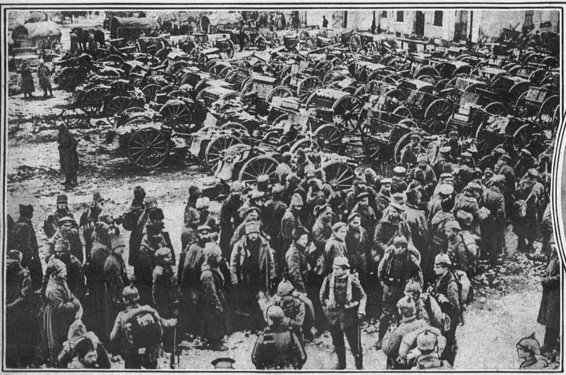
CELEBRATING A VICTORY IN THE ENEMY'S TERRITORY

A photograph showing recent operations at the Dardanelles. A French hydroplane is seen starting on a scouting expedition. The gunners on the battleships, which are also French, are dependent on such reconnoitering for the accuracy of their fire.