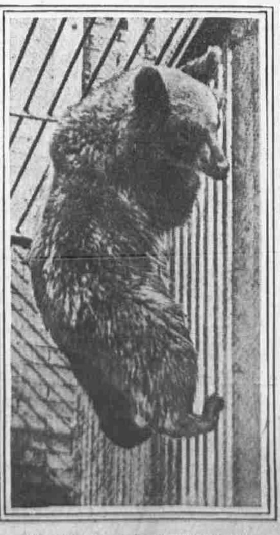
EXERCISE IS GOOD FOR THE BABY The newest bear baby at the Zoo, in Fair-mount Park, tries his climbing muscles on the bars of his mother's cage and peers out.