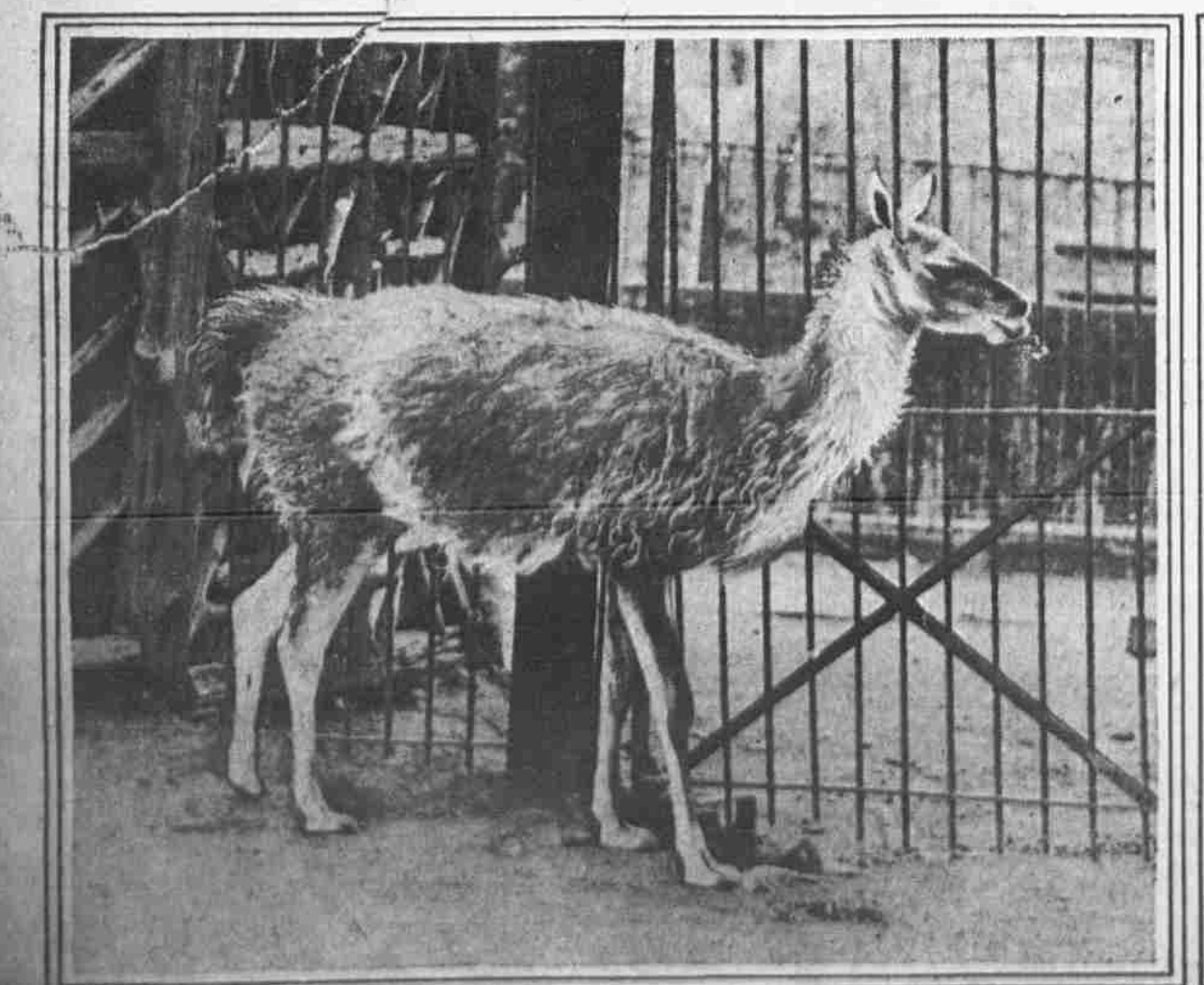
BABY LLAMA IS SPRING ARRIVAL AT THE ZOO The census is constantly being boosted these days at the menagerie in Fairmount Park. Keepers are hapf heavy preparing cradles and heating the milk for the fresh descendants of fumous old forest families. This youngster comes from one of the first families of Peru.